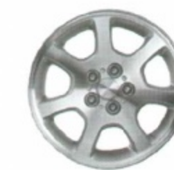
15-inch Cast Aluminum Wheel optional on Base, included in SRT Design Group