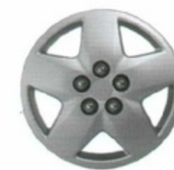
14-inch Bolt-on Wheel Cover standard on Base

P – Packaged with optional group noted S – Standard O – Optional *Always use seat belts. Children 12 and under should always be in a back seat correctly using an infant or child restraint system, or the seat belt properly positioned, dependent on the child's age and weight. Sentry Key is a trademark of DaimlerChrysler Corporation. Mopar is a registered trademark of DaimlerChrysler Corporation. Quaife is a registered trademark of Quaife Engineering Limited Corporation.