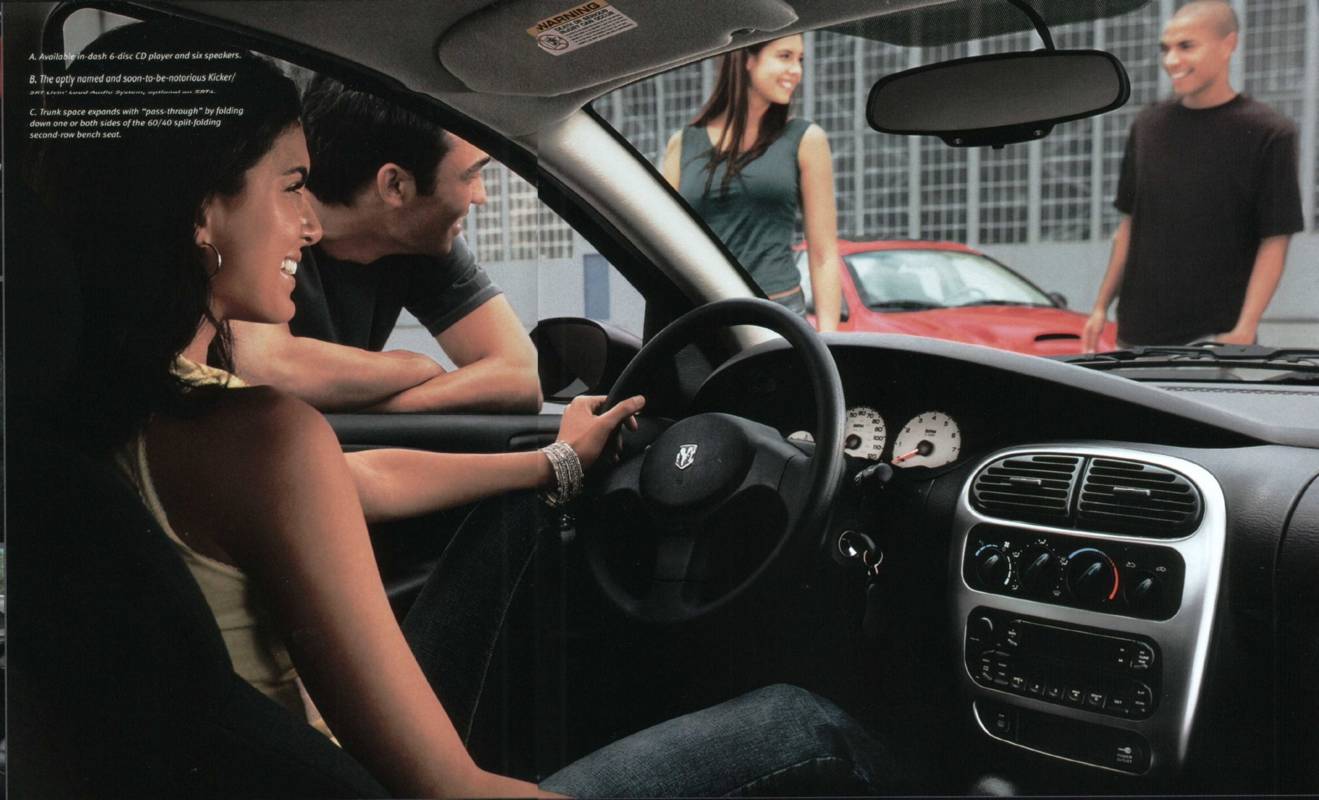
B. The aptly named and soon-to-be-notorious Kicker/ SRT Livin' Loud Audio System, optional on SRT4. C. Trunk space expands with "pass-through" by folding down one or both sides of the 60/40 split-folding second-row bench seat.

IF YOU'RE INTO MUSIC AND STUFF, YOU'LL LIKE THE SOUND OF THIS.