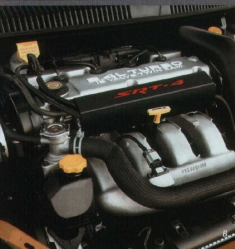
B. Visit your Dodge Dealer for a personal encounter with the 2.4-litre 16-valve 4-cylinder High-Output turbocharged DOHC engine that takes SRT4 from 0-60 mph (0-96 km/h) in 5.3 seconds.**