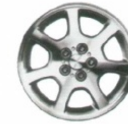
15-inch Cast Aluminum Chrome Wheel optional on Sport