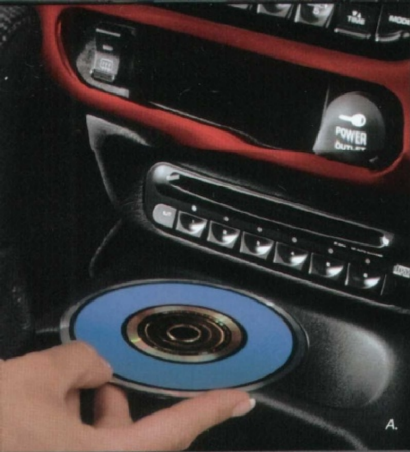
A. Available in-dash 6-disc CD player and six speakers.