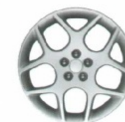
17-inch Cast Aluminum Wheel standard on SRT4