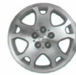
15-inch Cast Aluminum Wheel standard on Sport