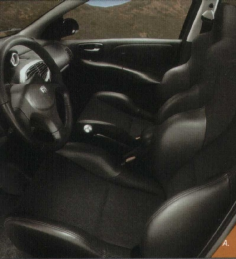
A. SRT4's race-influenced cockpit with Viper-inspired seats and Satin Silver console detailing.