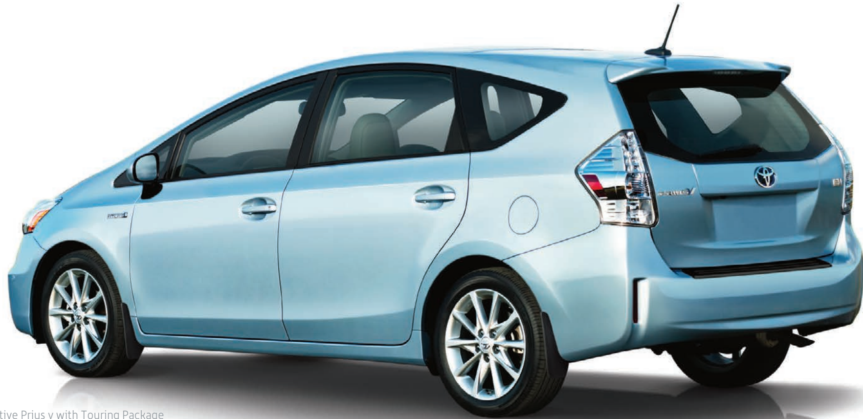
The innovative Prius v with Touring Package shown in Clear Sky Metallic.

delivers outstanding fuel efficiency with a combined city highway rating of 4.5 L/100 km 2 . Considering all of the benefits that Prius v has in store, it looks like the future is shaping up nicely. More Prius, more possibilities.