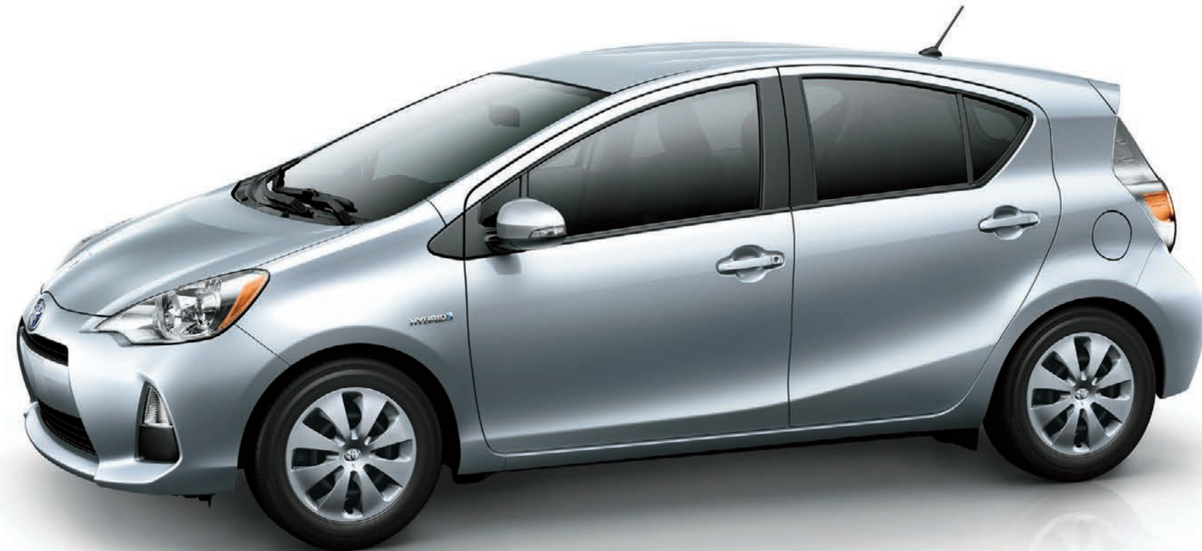
Prius c shown in Classic Silver Metallic.

Prius c features a large rear hatch that opens up wide for easy access to its spacious 17 cu.ft. cargo area.