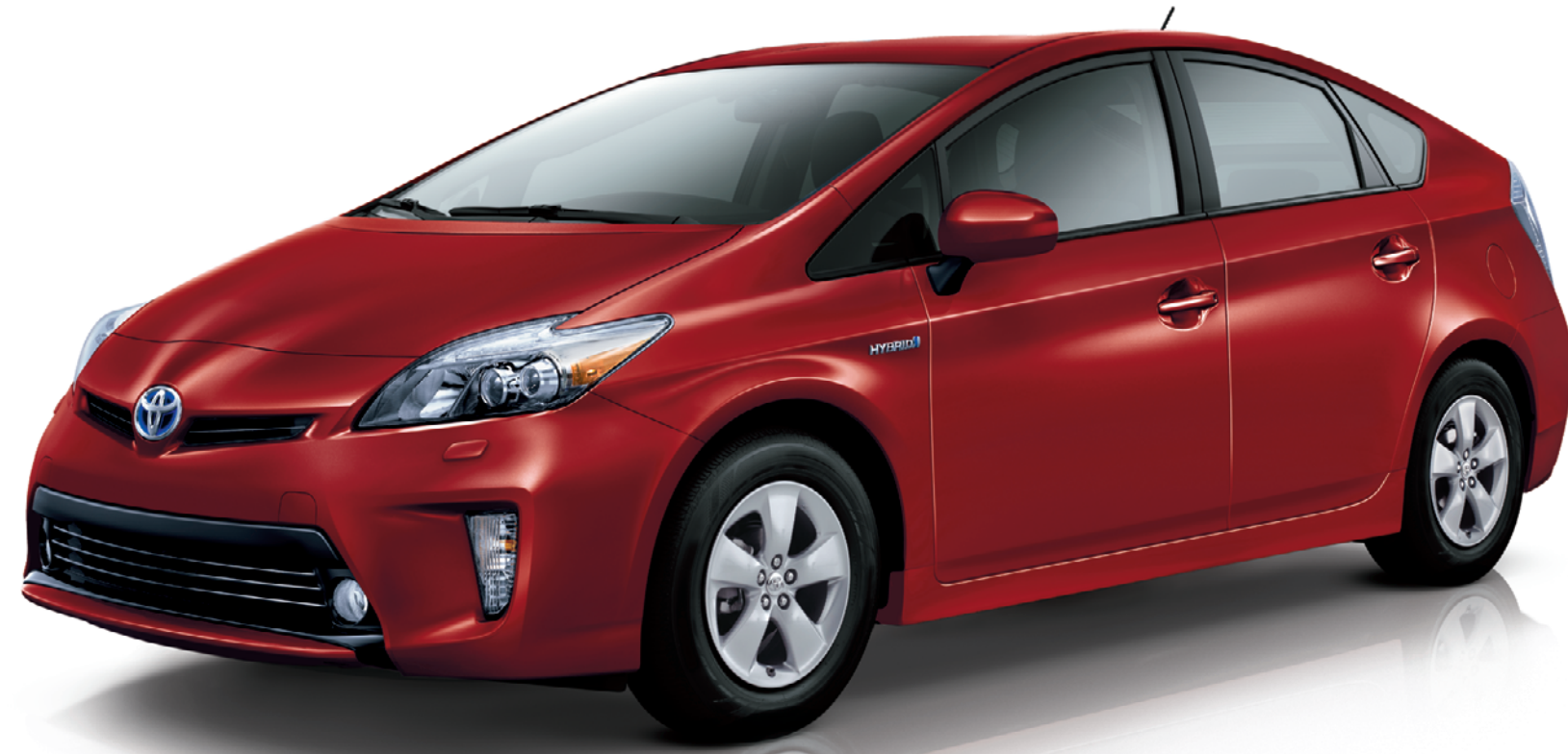
Prius with Touring Package shown in Barcelona Red Metallic.

proven reliability. Those interested in reducing their carbon footprint, and those who are hesitant to sacrifice practicality in order to do it. With all that Prius has to offer, it may well be the one form of transportation that we can all agree upon.