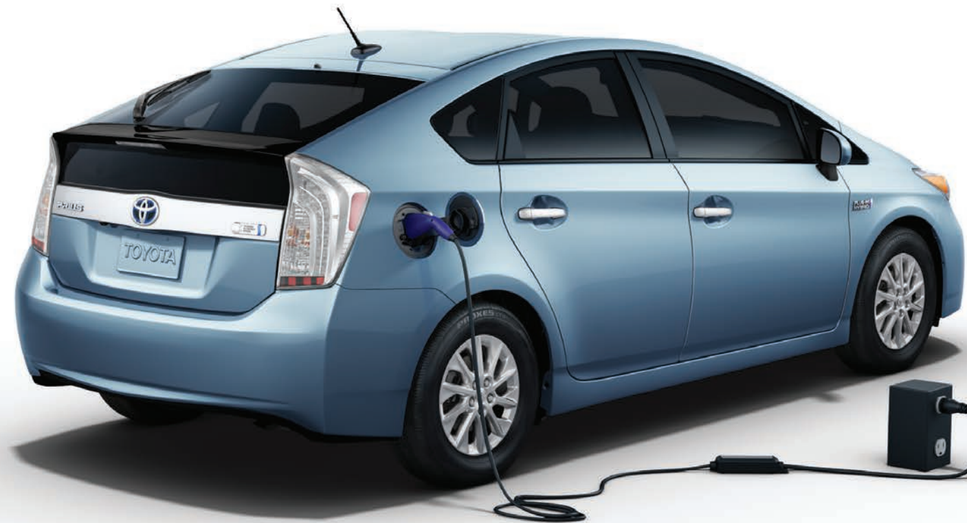
Prius Plug-in shown in Clearwater Blue Metallic.

up to 100 km/h 2 totally emission-free. And because Prius Plug-in is also a hybrid, you'll never have to worry about running out of a charge. When the battery runs low, the system automatically switches to Hybrid Mode, which is capable of operating in gas-mode only, electric-mode only or a seamless combination of the two.