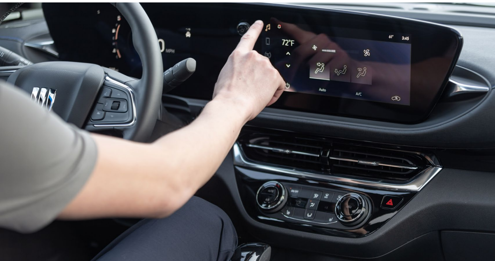
Sport Touring shown with available features.

1 Cargo and load capacity limited by weight and distribution.