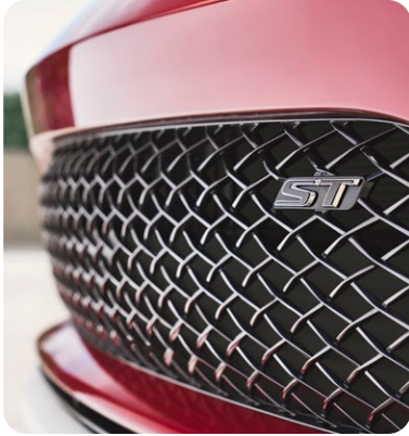
Sport Touring shown.

See your Buick dealer or buick.com for more package details and requirements.