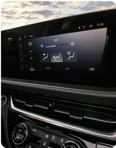
Sport Touring shown.