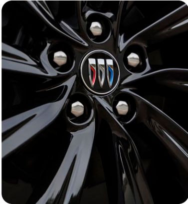
Sport Touring shown.

See your Buick dealer or buick.com for more feature details and requirements.