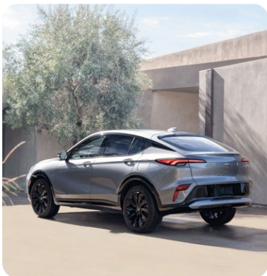
Sport Touring shown.