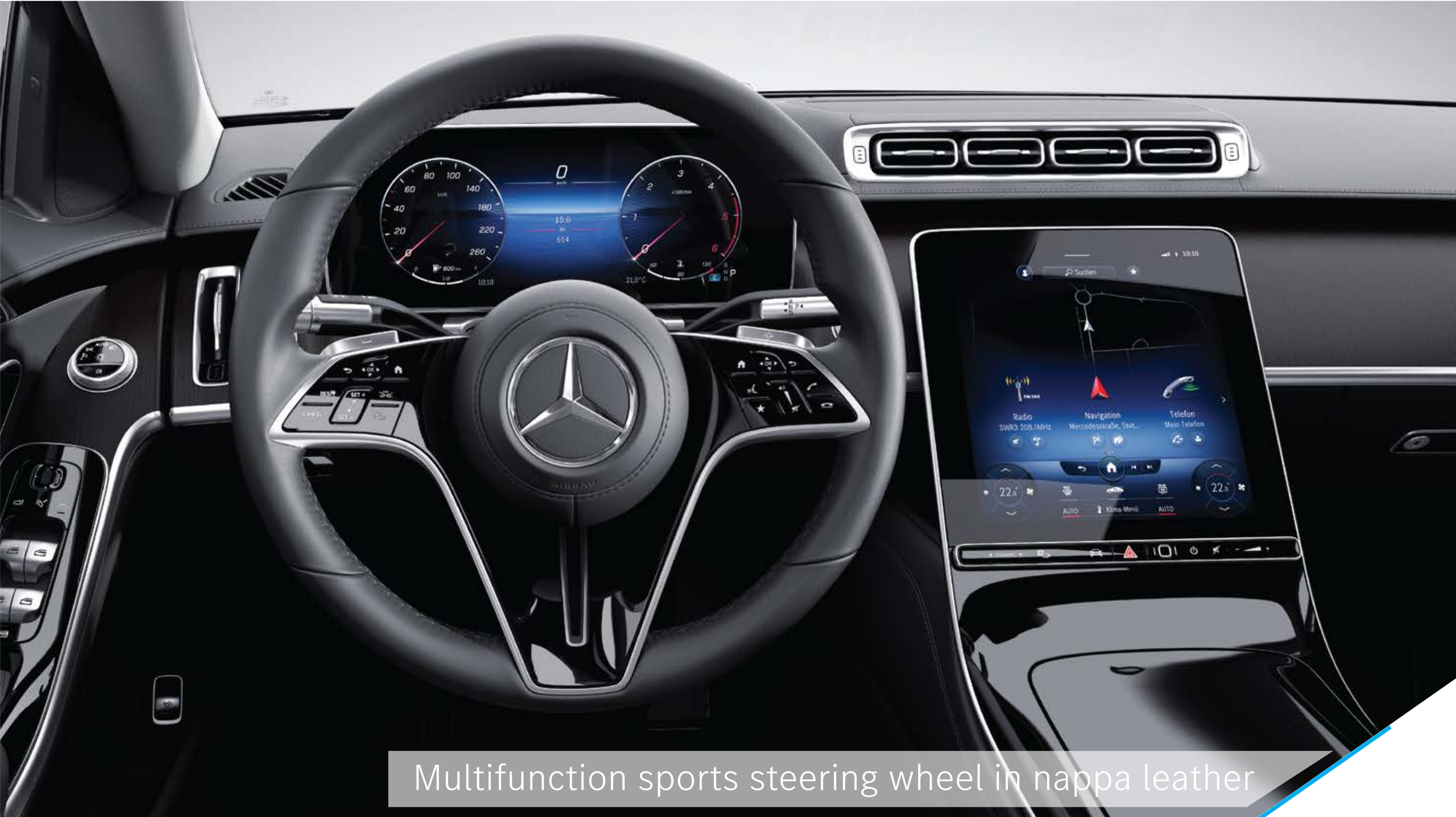
Multifunction sports steering wheel in nappa leather