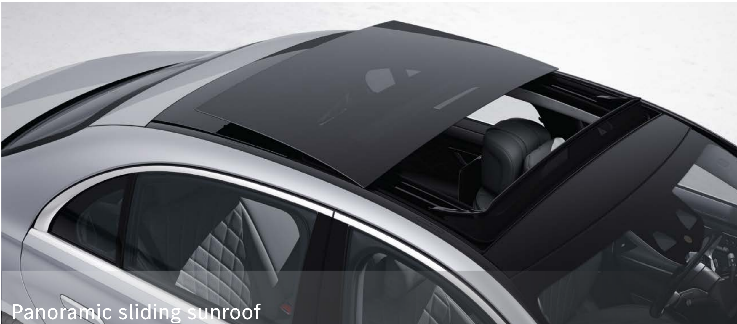
Panoramic sliding sunroof