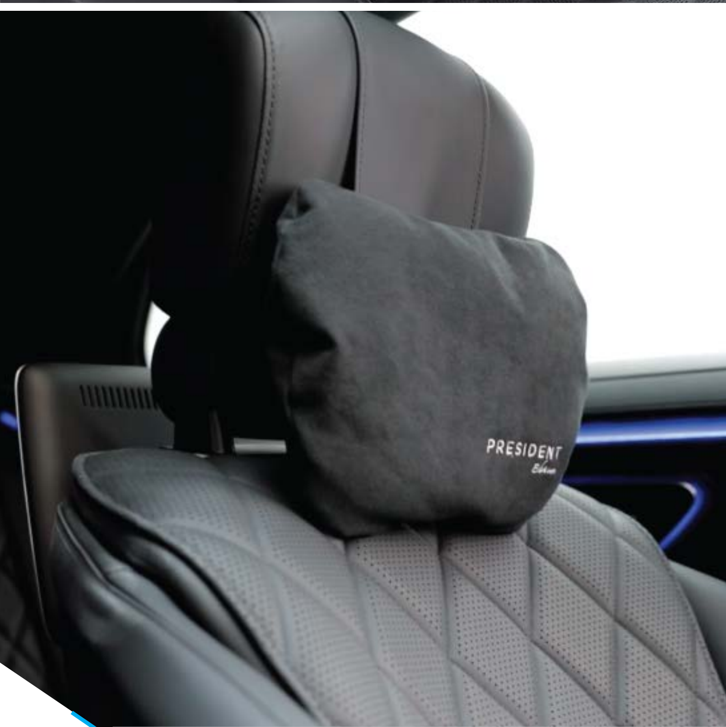
President Edition headrest cushions