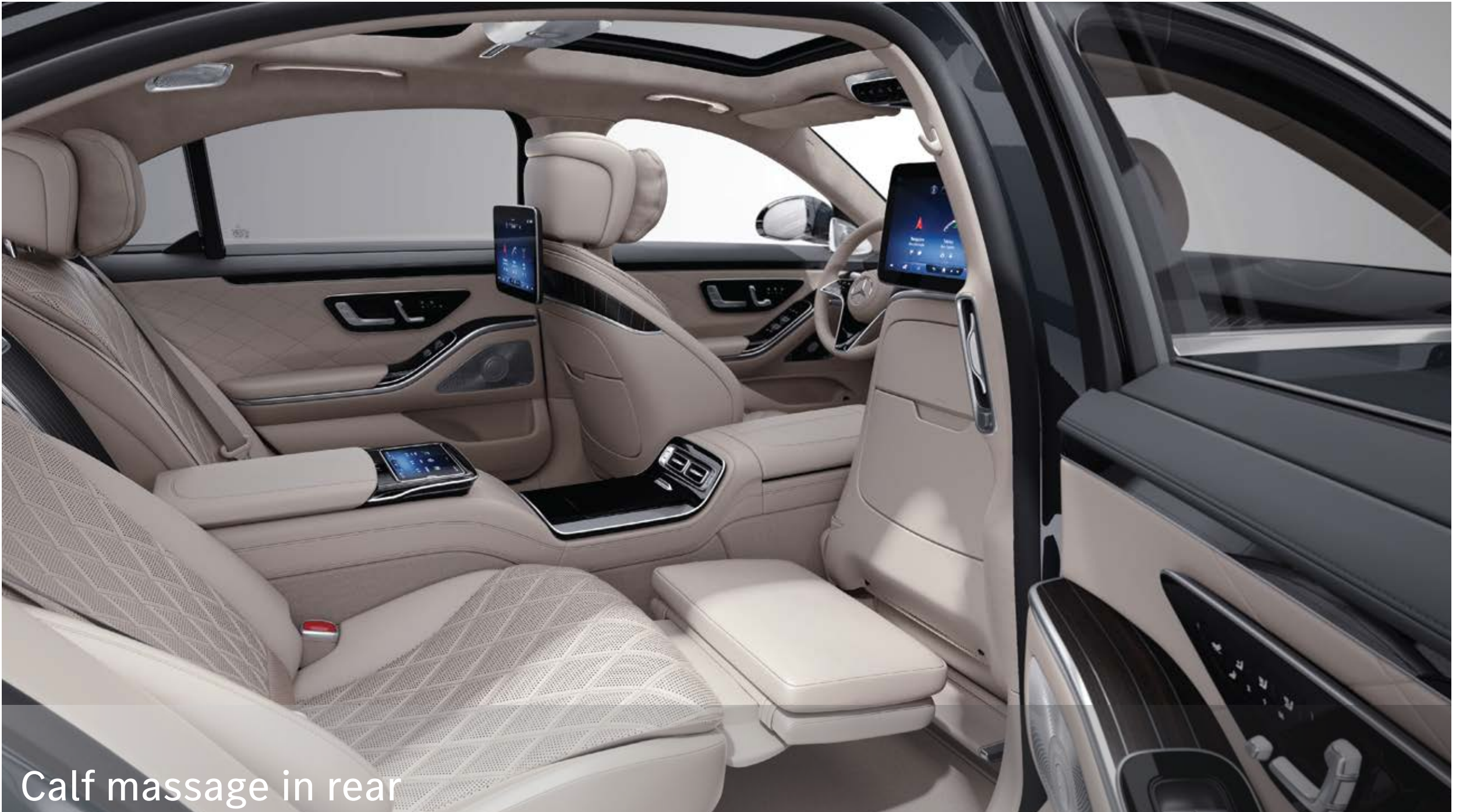
Calf massage in rear