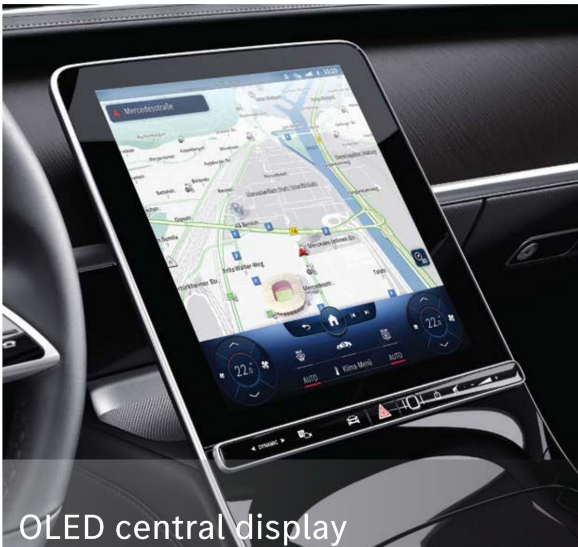
OLED central display