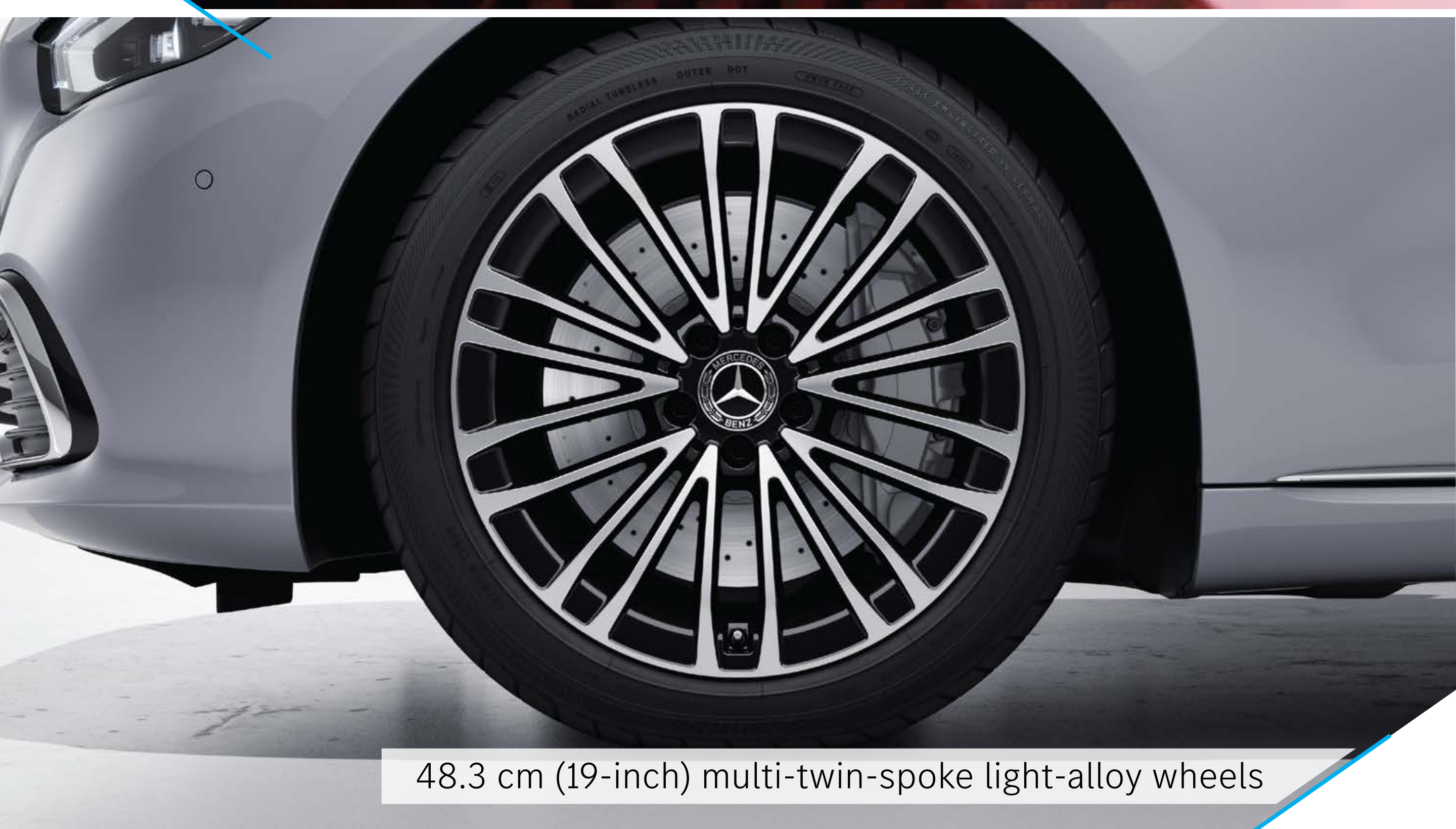
48.3 cm (19-inch) multi-twin-spoke light-alloy wheels