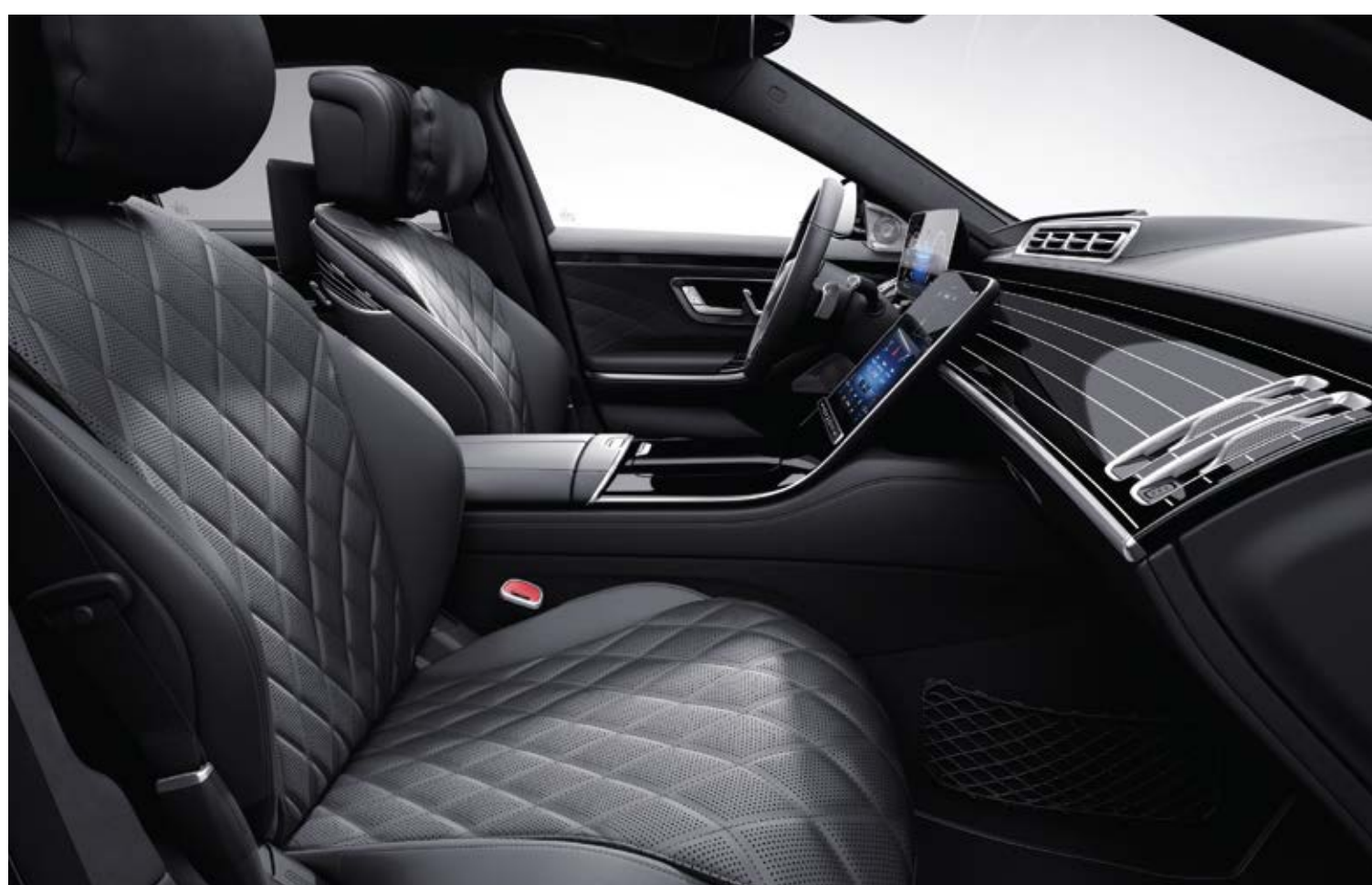
Nappa leather black