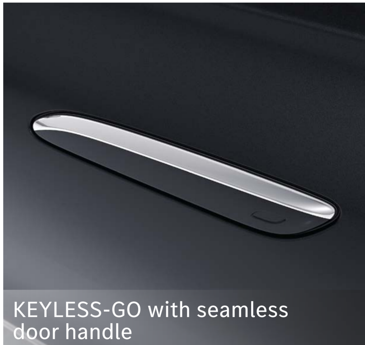
KEYLESS-GO with seamless door handle