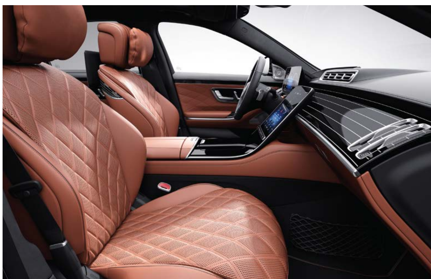
Nappa leather sienna brown