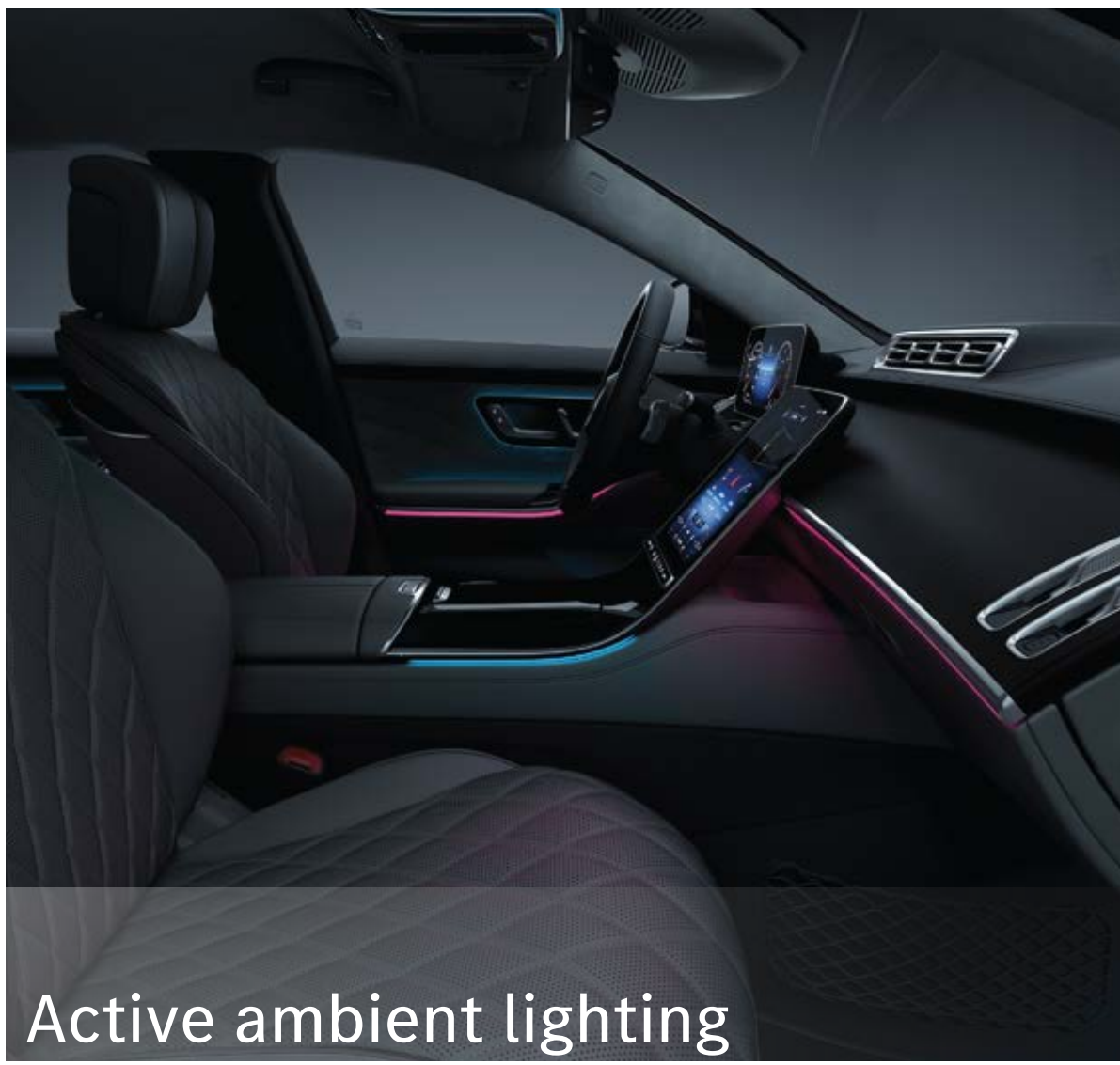
Active ambient lighting