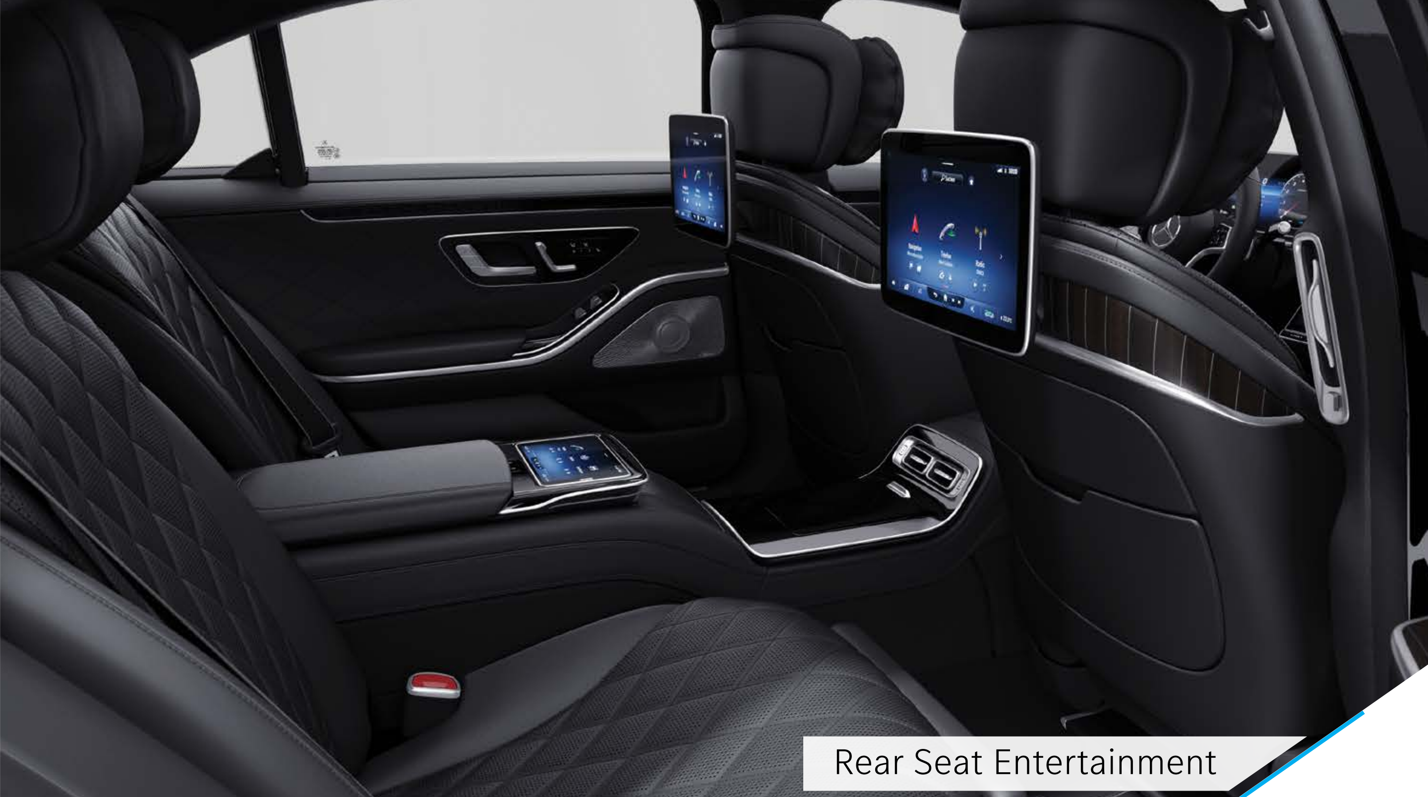
Rear Seat Entertainment