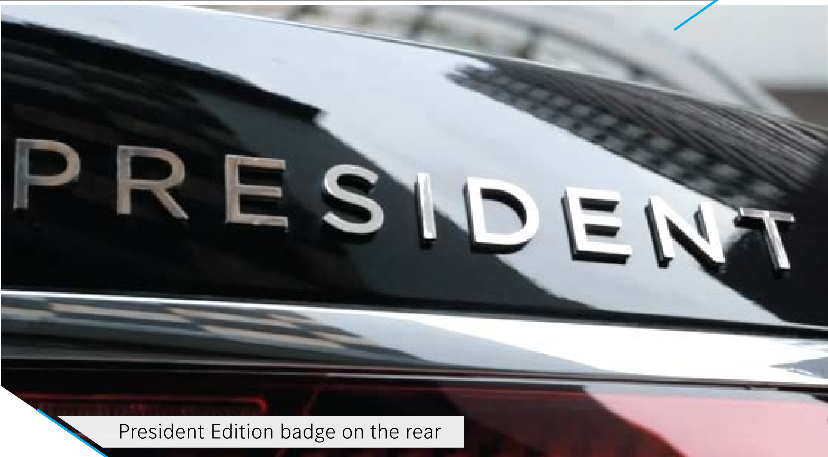
President Edition badge on the rear