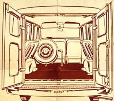
Interior view 2-wheel drive traveller. 4-wheel drive traveller has roof mounted spare tire as illustrated.