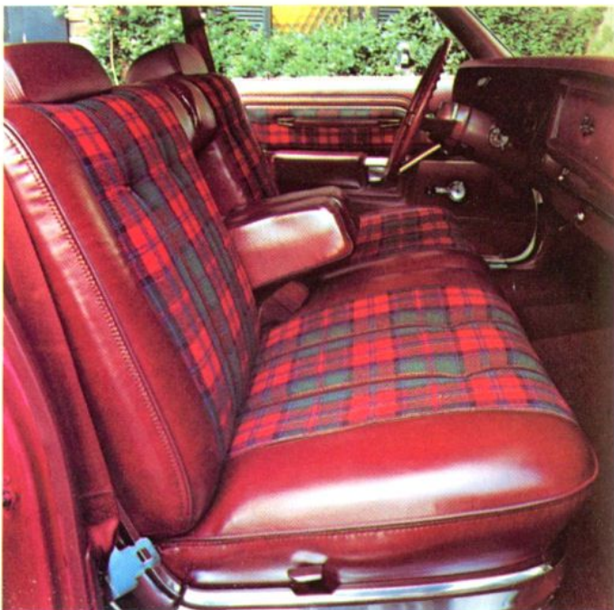
Newport Custom Highlander Optional Seat