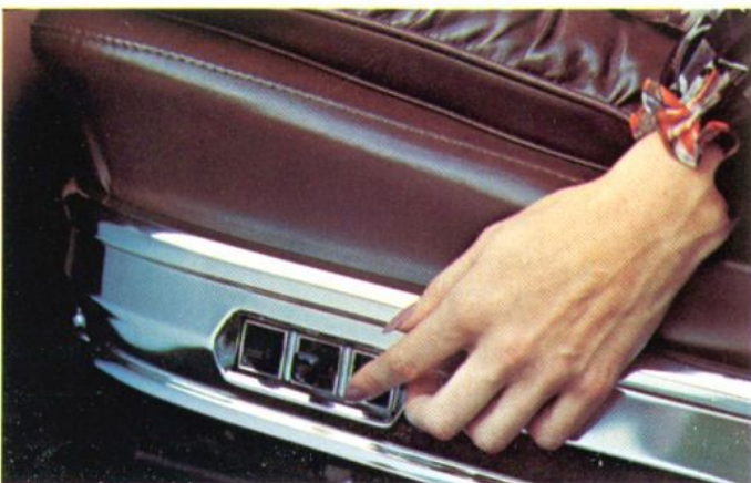
Power Seat Control