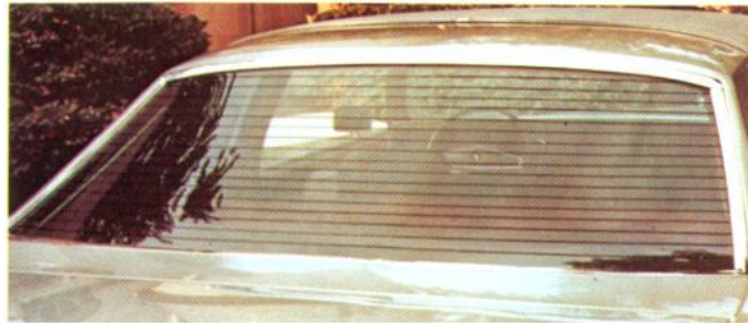
Rear Window Defroster

Rear window defroster, electronically heated —starts defrosting at the flip of a switch.