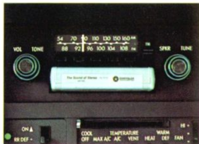
AM/FM Radio with Stereo Tape