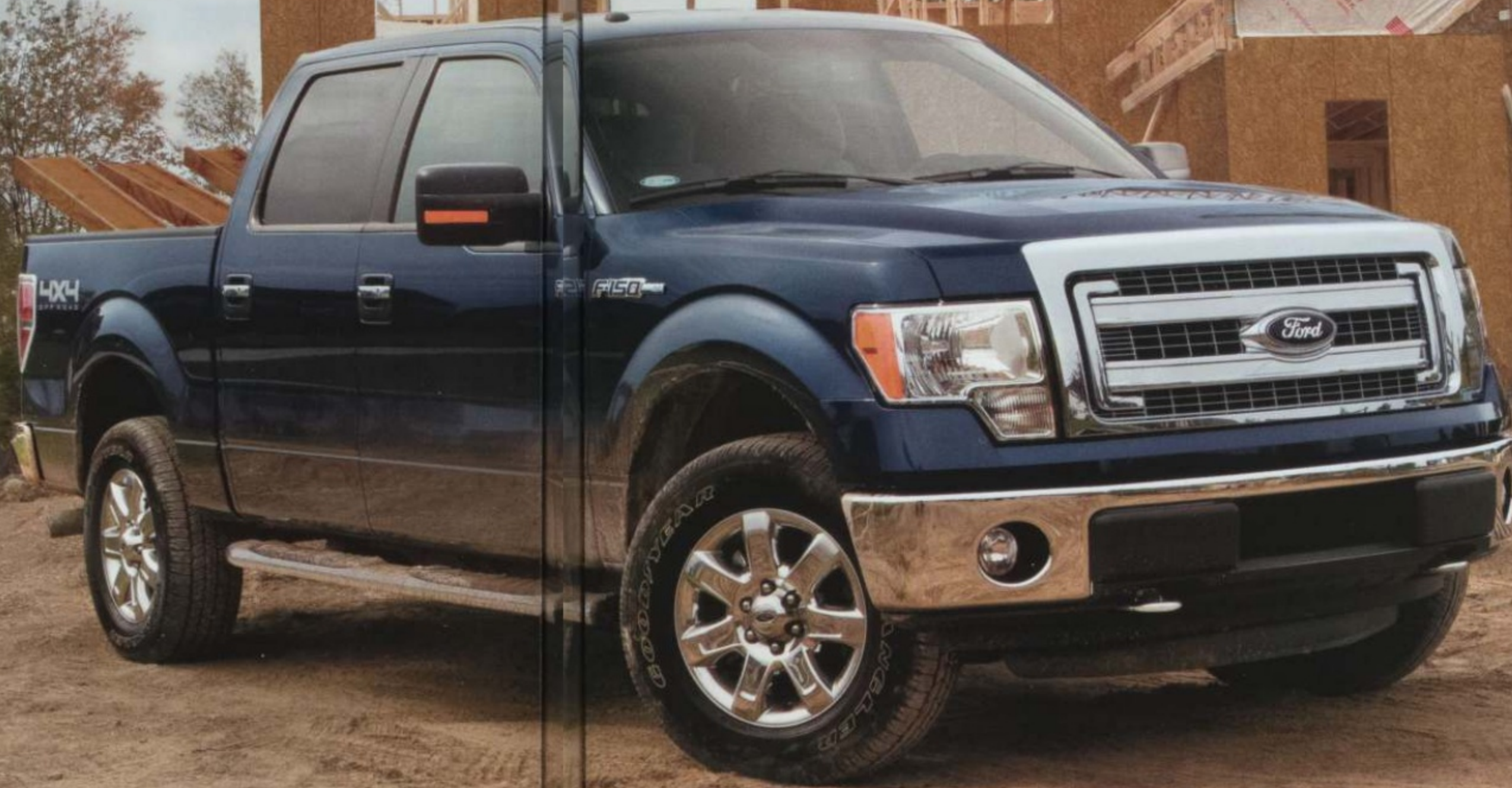
F-150 XLT SuperCrew 4x4. Blue Jeans Metallic. Available equipment.