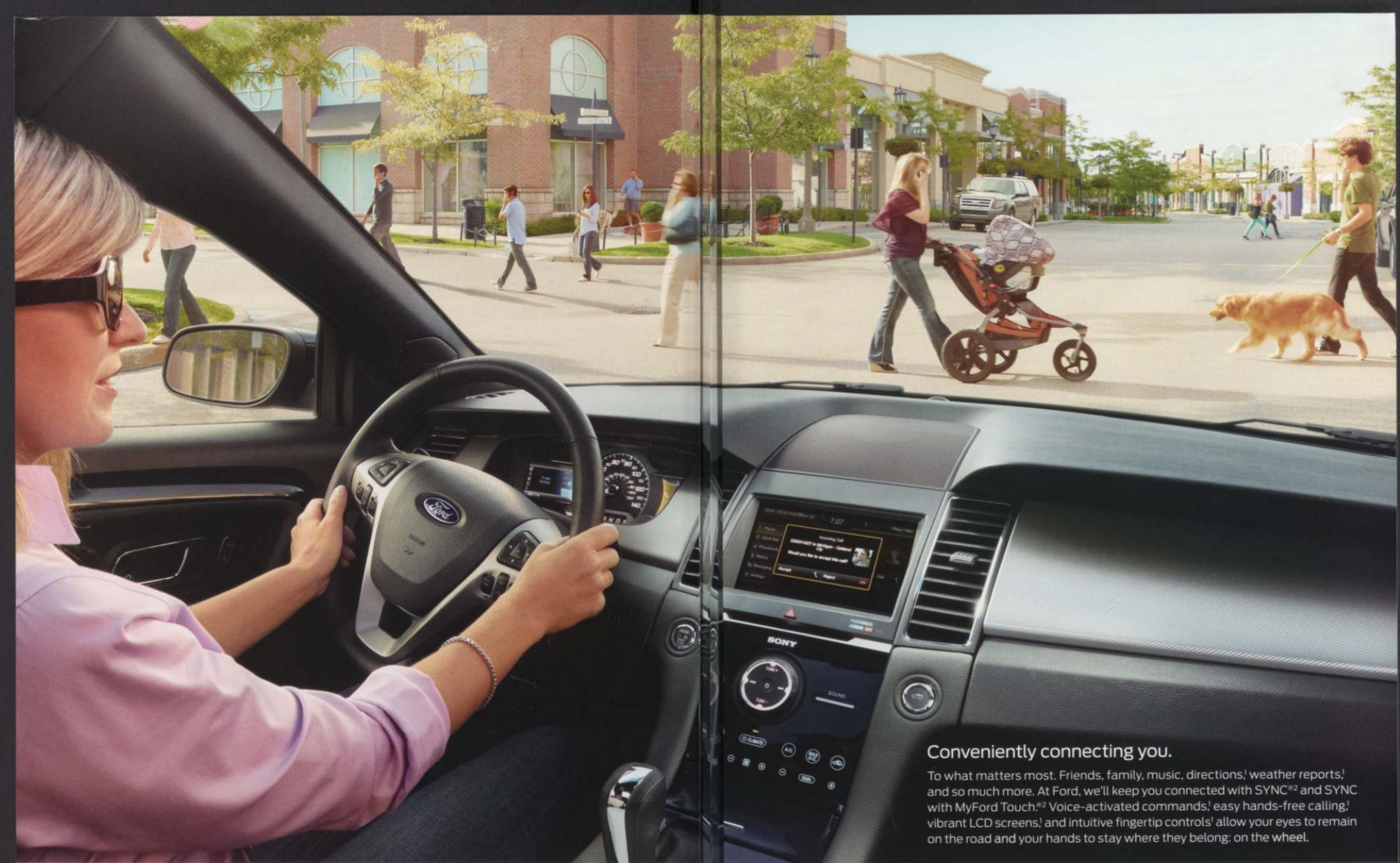
Taurus SHO. Charcoal Black leather.