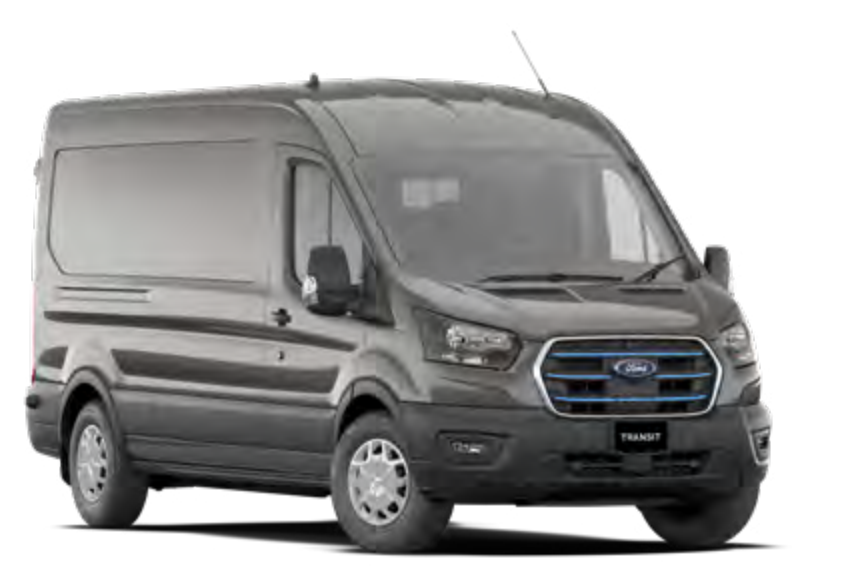
Frozen White Moondust Silver* Magnetic*