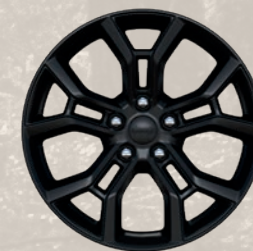
20-inch Black-painted aluminum wheel (Available with Anniversary Edition)