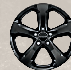
20-inch Gloss Black-painted aluminum wheel (Included with Altitude Package)