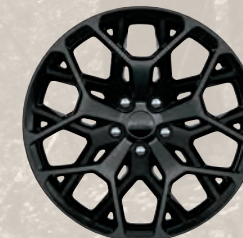
21-inch Black Noise-painted aluminum wheel (Included with High Altitude Package)