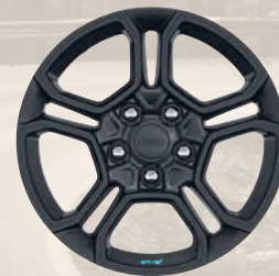
18-inch Granite Crystal fully painted aluminum wheel (Included with Anniversary Edition)