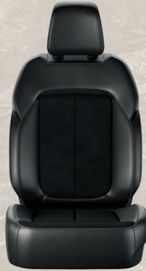
Capri Leatherette and Perforated Suede seat with Light Tungsten accent stitching — Global Black (Standard)