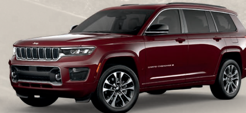
3-Row Overland in Velvet Red Pearl