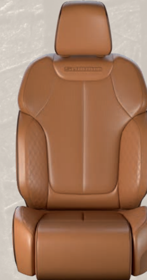
Vented Palermo Leather seat with Quilted Palermo Leather Bolsters and Cognac accent stitching, Global Black piping and embossed Summit logo — Tupelo/Black (Included with Summit Reserve Group)