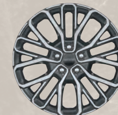
21-inch machined-face/Granite Crystal-painted aluminum wheel (Included with Summit Reserve Group on 3-row models)