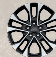
20-inch machined-face aluminum wheel with Black Noise-painted pockets (Standard)