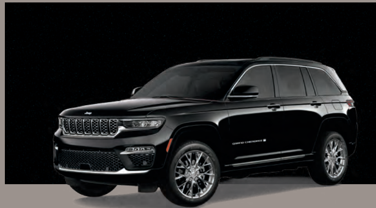
Diamond Black Crystal Pearl