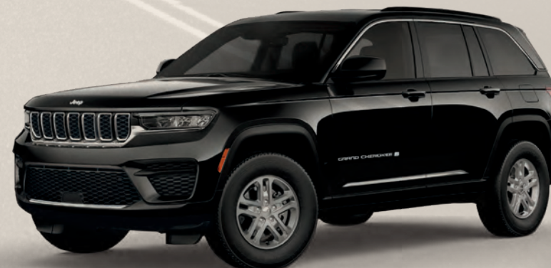
Laredo in Diamond Black Crystal Pearl