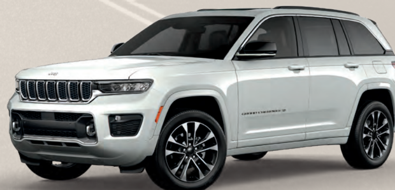
Overland® in Bright White