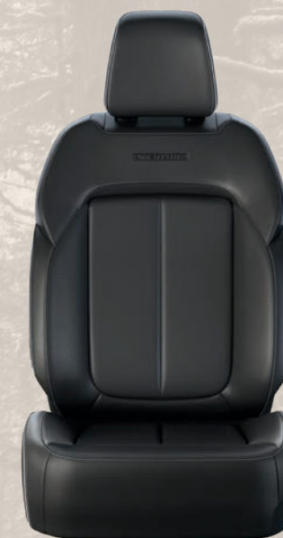
Ventilated Nappa Leather and Axis II perforated seat with Light Tungsten accent stitching and embossed Overland® logo — Global Black (Standard)