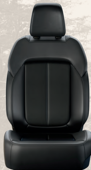
Capri Leatherette seat with Light Tungsten accent stitching — Global Black (Standard)