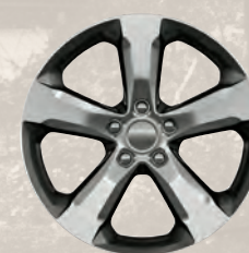
20-inch Technical Grey-painted machined aluminum wheel (Available)