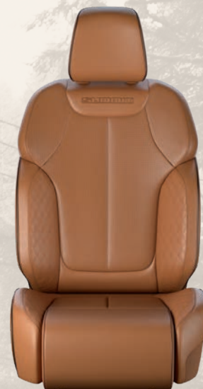
Vented Nappa Leather seat with Quilted Nappa Leather Bolsters and Cognac accent stitching, Global Black piping and embossed Summit logo — Tupelo/Black (Standard)