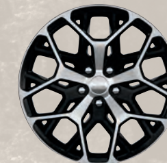
21-inch machined-face/Gloss Black-painted aluminum wheel (Included with Summit Reserve Group on 2-row models)