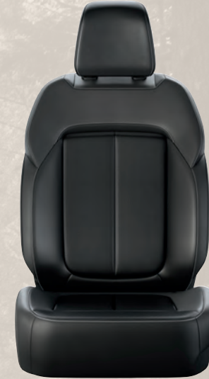
Ventilated Capri Leatherette and Axis II perforated seat with Light Tungsten accent stitching — Global Black (Included with Luxury Tech Group II and Anniversary Edition)