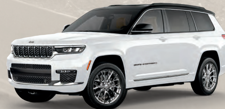
3-Row Summit in Bright White