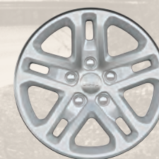
17-inch Fine Silver fully painted aluminum wheel (Standard on 2-row models)