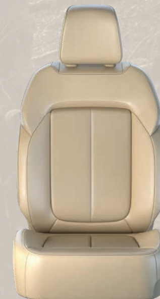
Ventilated Capri Leatherette and Axis II perforated seat with Light Tungsten accent stitching — Global Black/Wicker Beige (Included with Luxury Tech Group II)