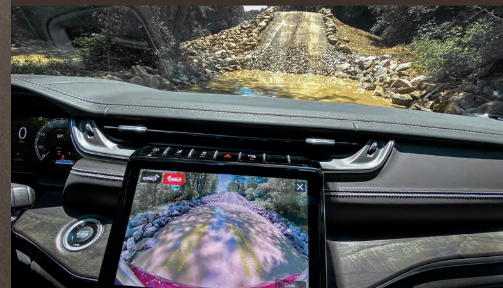
FRONT-FACING OFF-ROAD CAMERA 21