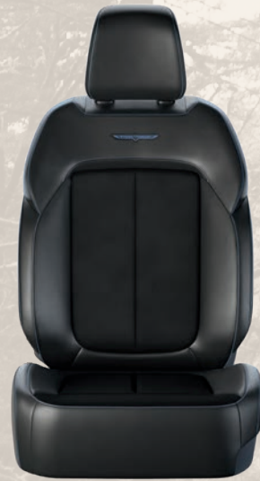
Capri Leatherette seat with Light Tungsten accent stitching — Global Black (Included with Altitude Package)