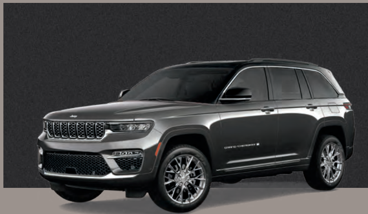
Baltic Grey Metallic