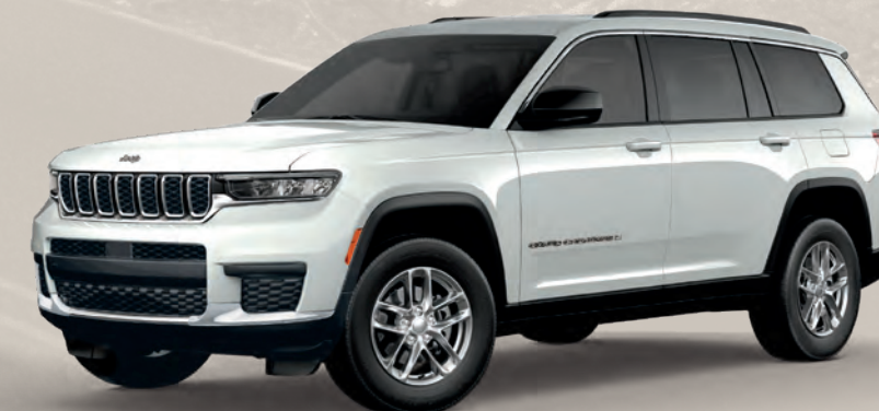
3-Row Laredo in Bright White