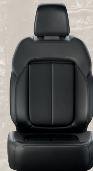
Ventilated Capri Leatherette and Axis II perforated seat with Light Tungsten accent stitching — Global Black (Included with Luxury Tech Group II)