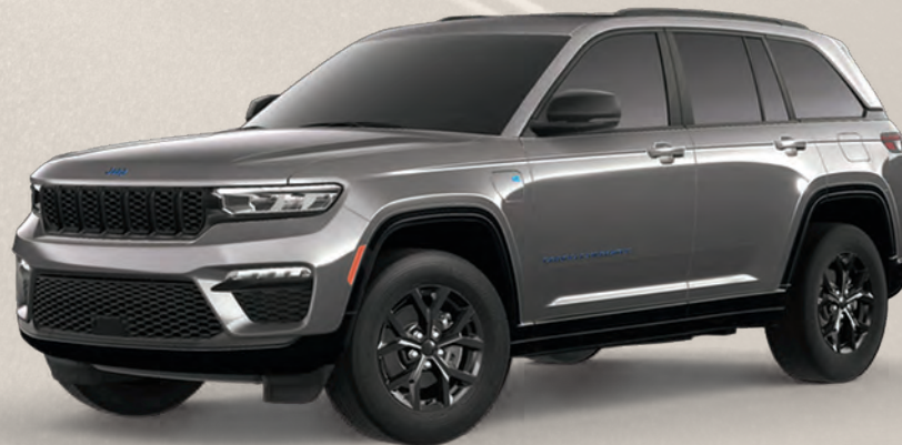
4xe Altitude in Baltic Grey Metallic