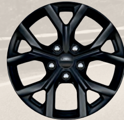
18-inch Gloss Black-painted aluminum wheel (Included with Altitude Package)