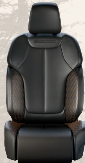
Vented Nappa Leather seat with Quilted Nappa Leather Bolsters and Cognac accent stitching, Steel Grey piping and embossed Summit logo — Global Black (Standard)