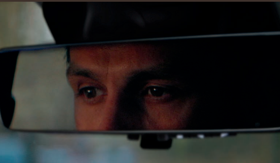
DROWSY-DRIVER DETECTION 21