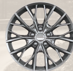
20-inch Silver Lithos fully painted aluminum wheel (Standard)