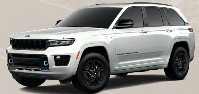
4xe Anniversary Edition in Bright White