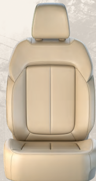
Capri Leatherette seat with Light Tungsten accent stitching — Global Black/Wicker Beige (Standard)