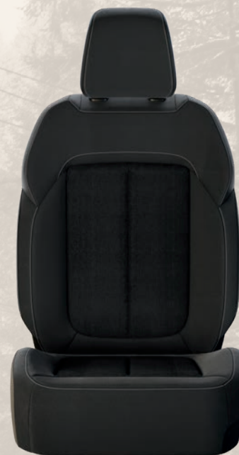
Origin and Essence Cloth seat with Light Tungsten accent stitching — Global Black (Standard)