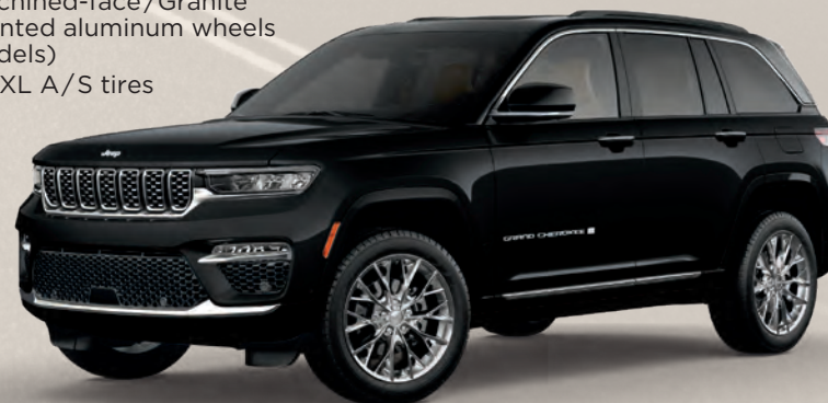
Summit in Diamond Black Crystal Pearl