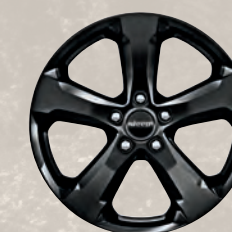
20-inch Gloss Black-painted aluminum wheel (Included with Black Appearance Package)