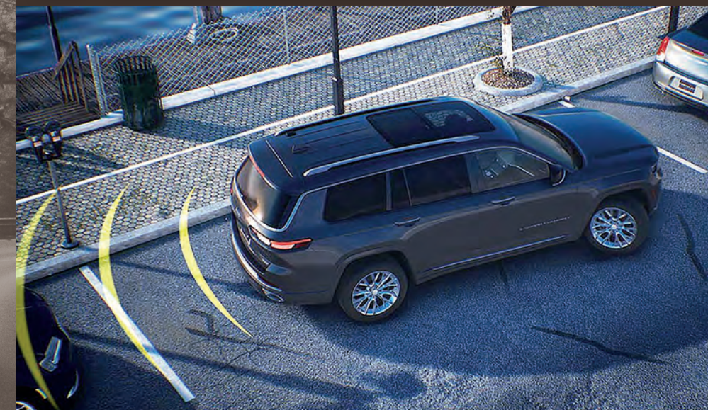
PARALLEL AND PERPENDICULAR PARK ASSIST 21