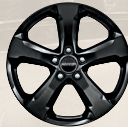
20-inch Gloss Black-painted aluminum wheel (Available with Altitude Package)