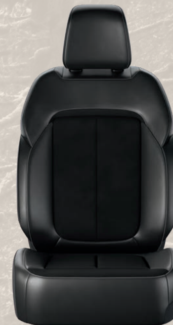
Capri Leatherette and Perforated Suede seat with Light Tungsten accent stitching — Global Black (Included with Altitude Package)