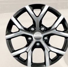
18-inch polished/painted aluminum wheel with High-Gloss Black pockets (Standard)