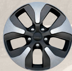
18-inch machined-face aluminum wheel with Black Noise-painted pockets (Standard)