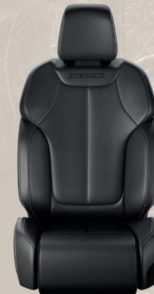
Ventilated Nappa Leather and Axis II perforated seat with Light Tungsten accent stitching and embossed Overland logo — Global Black (Included with Luxury Tech Group IV)