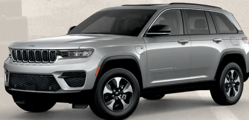
4xe in Silver Zynith