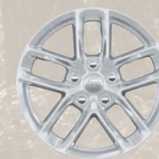
18-inch Fine Silver fully painted aluminum wheel (Standard on 3-row models and available on 2-row models)