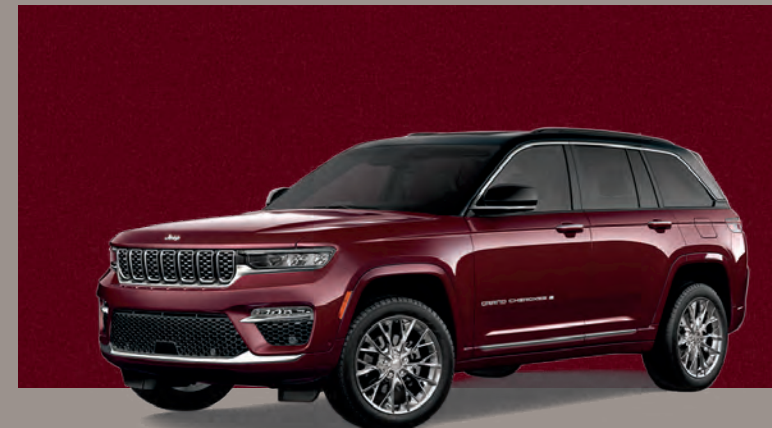
Velvet Red Pearl