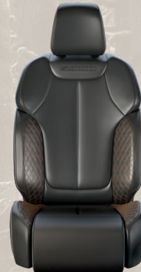
Vented Palermo Leather seat with Quilted Palermo Leather Bolsters and Cognac accent stitching, Steel Grey piping and embossed Summit logo — Global Black (Included with Summit Reserve Group)