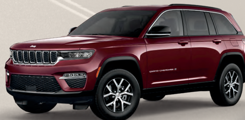
Limited in Velvet Red Pearl