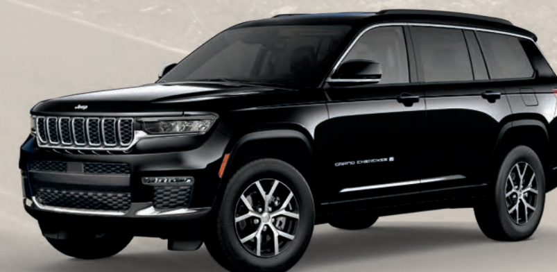
3-Row Limited in Diamond Black Crystal Pearl