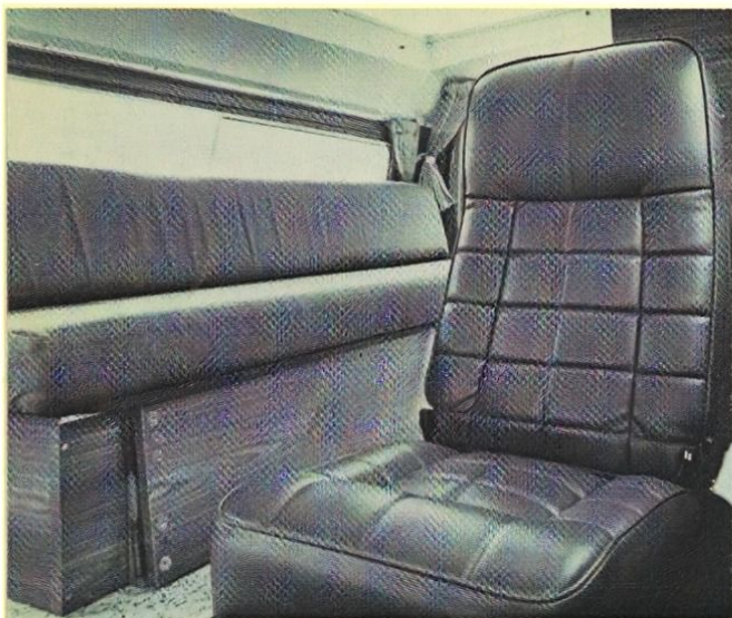
Exclusive third seat.