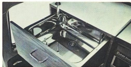
Stainless steel sink.