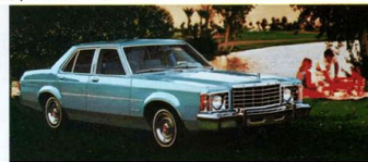
FORD GRANADA. Looks like cars costing 3 times more.

*5-passenger 4-Door model, 4-passenger 2-Door model.