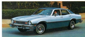
FORD MAVERICK. The dependable family compact.

Consider Maverick and Granada, for example, plus others in the EPA chart below.