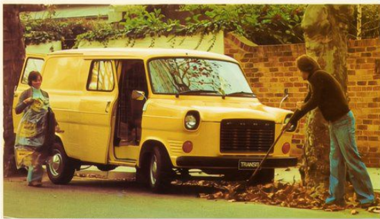
Transit 100 End Load