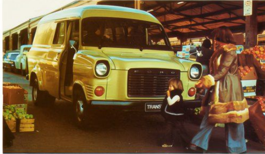
Transit 150 End Load