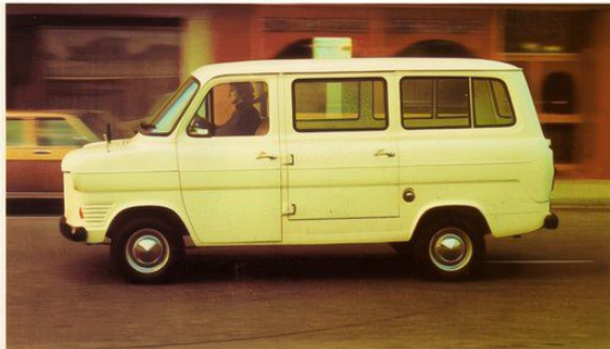
Transit 100 3-seater Kombi