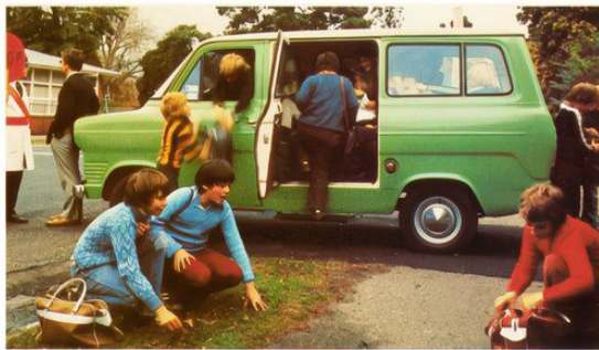
Transit 100 12-seater Bus