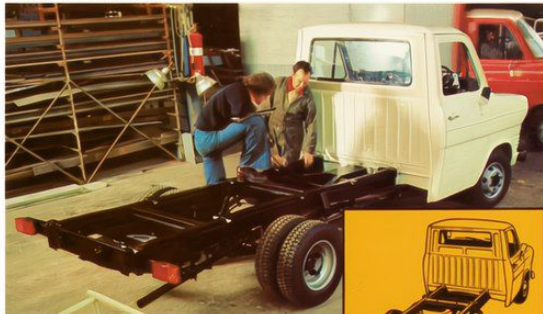
Transit 150 & 100 Chassis Cab