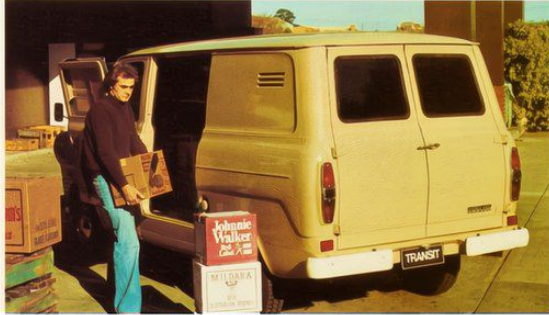
Transit 100 Side/End Load