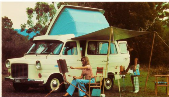
Transit Sightseer Awning not available from Ford Motor Company of Australia Limited