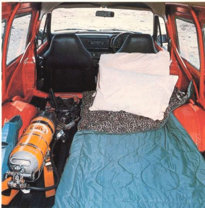
Illustrated: Escort XL Van with optional GS pack (available at extra cost).