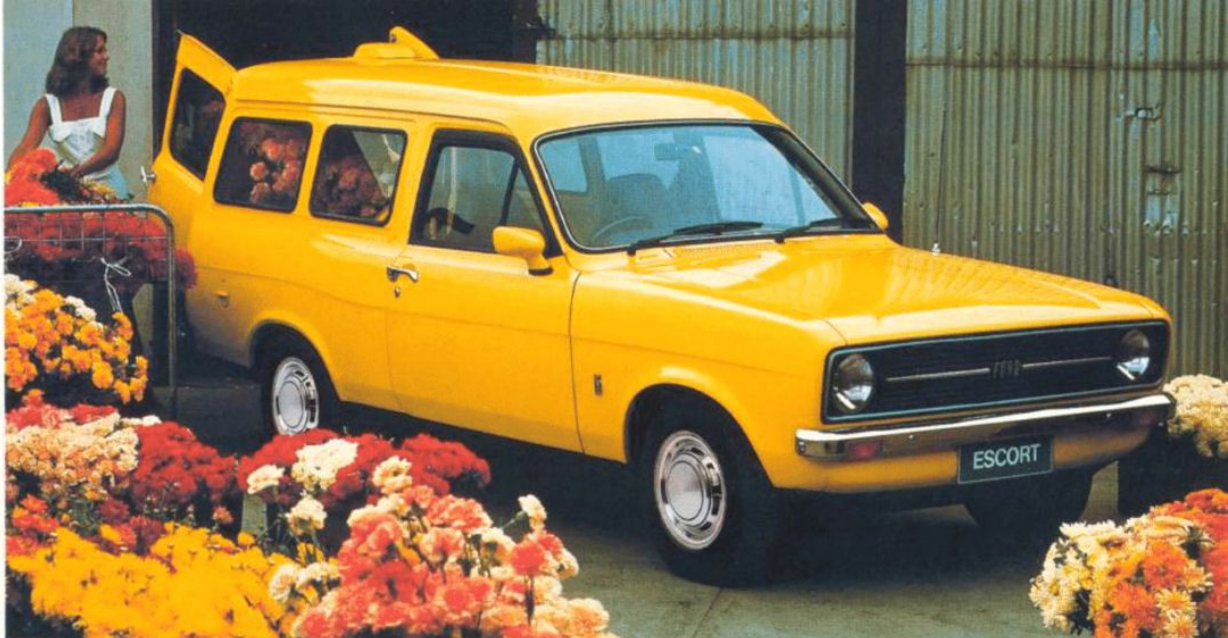
Illustrated: Escort XL Van.