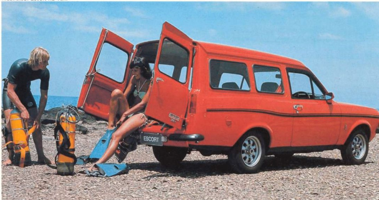
Illustrated: Escort XL Van with optional GS Pack (available at extra cost).