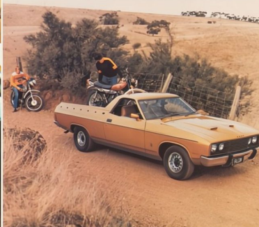
Falcon 500 Utility with optional GS Rally Pack and 4.1 litre engine (available at extra cost).