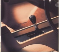
Optional 4 on the floor manual shift (500 only)