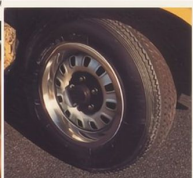
GS Rally Pack wheel

*All options are available at extra cost unless otherwise stated.