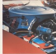
Optional 4.9 litre V8 engine