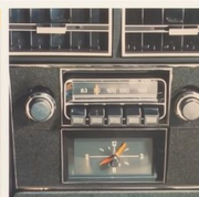
Optional push-button radio. Clock (GS only).