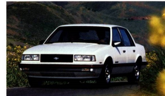
Celebrity Eurosport Sedan.

The popular Eurosport package transforms Celebrity into a sport sedan—at an affordable price. It includes a performance-tuned suspension, quick-ratio power steering, larger P195/75R-14 all-season radial tires, blackout exterior trim with red-accent striping, Rally Wheels with trim rings, padded sport steering wheel and special identification.