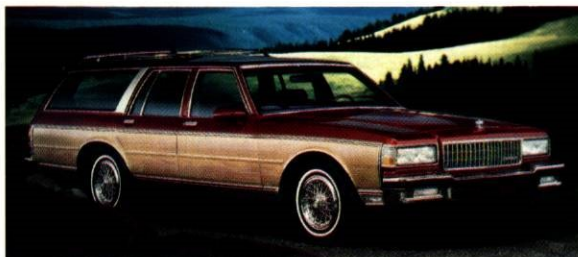
Caprice Classic Estate Wagon with optional roof carrier.