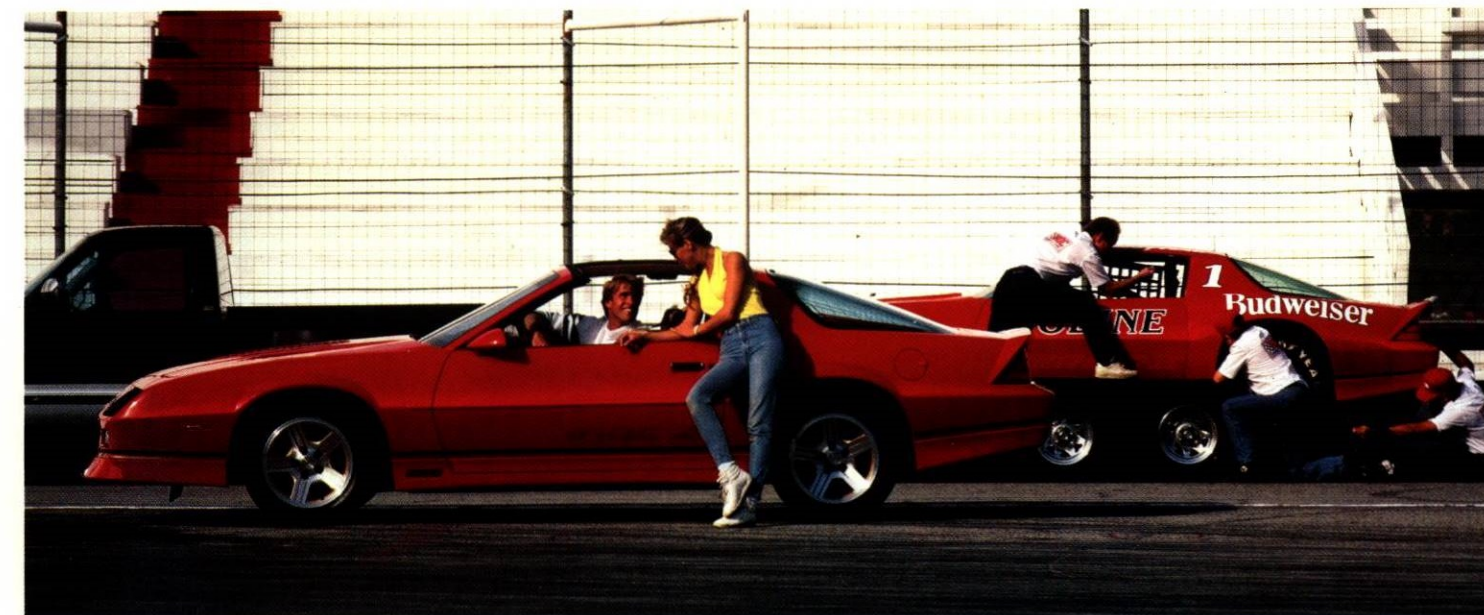
Camaro IROC-Z Coupe with optional 16" aluminum wheels and Eagle unidirectional tires.