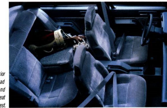
Corsica LTZ's luxury interior includes overhead console, center armrest, and 60/40 split-folding rear seat with center armrest.