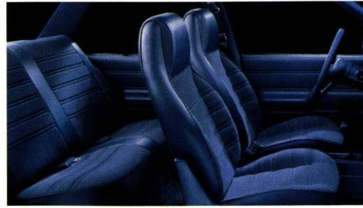
Cavalier Sedan interior.