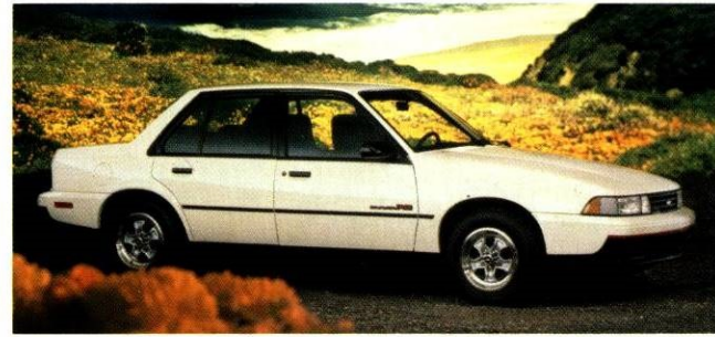
Cavalier RS Sedan.