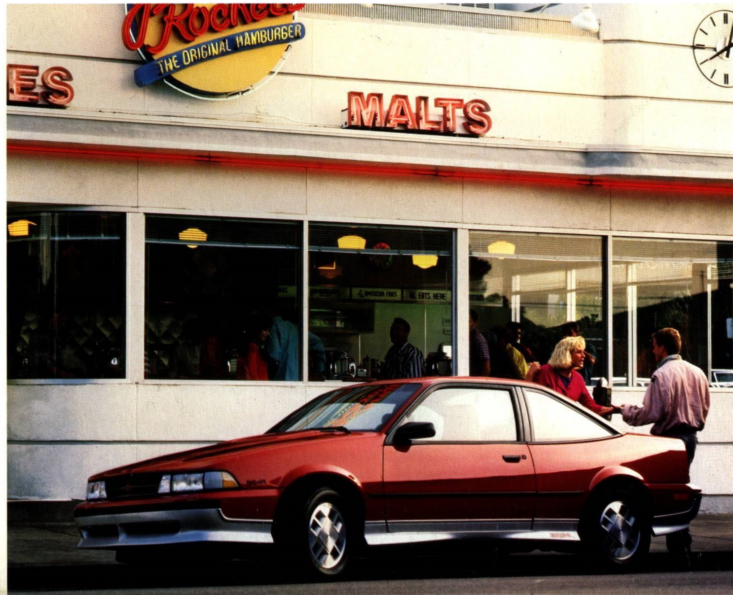
Cavalier Z24 Coupe.