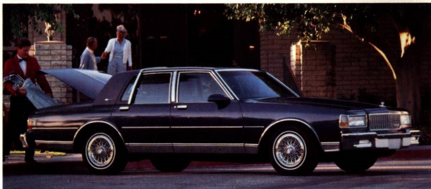
Caprice Classic Brougham LS features an elegant padded landau-style rear roof treatment.

NOTE: For additional details on any 1989 Chevrolet featured in this folder, see your Chevrolet dealer for a complete selection of brochures by vehicle line. They include * Cavalier * Beretta * Corsica * Camaro * Celebrity * Caprice * Corvette.