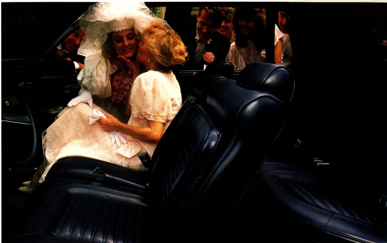
Caprice Classic Brougham LS interior with optional leather seating surfaces.

Chevrolet Caprice, one of America's most distinctive automobiles, retains its uncompromised size and style for 1989. Refinements to the popular full-size Chevrolet include standard V8 power and standard air conditioning on all models. Caprice continues to feature Full Coil suspension, full-frame construction and a proven rear-drive design. And when it's traveling time, you'll appreciate Caprice Sedan's huge 20.9-cu.-ft. trunk.