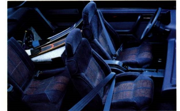
Beretta GT interior.