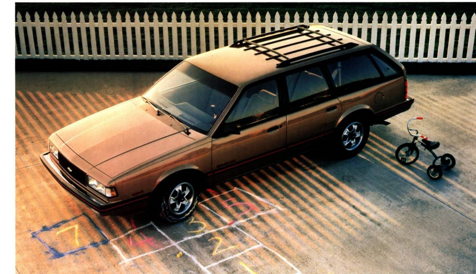
Celebrity Eurosport Wagon with optional roof carrier.