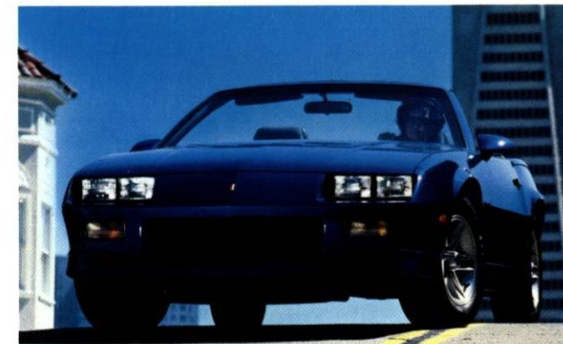
Camaro RS Convertible.

Camaro RS and Camaro IROC-Z are available as coupes or as convertibles in 1989.