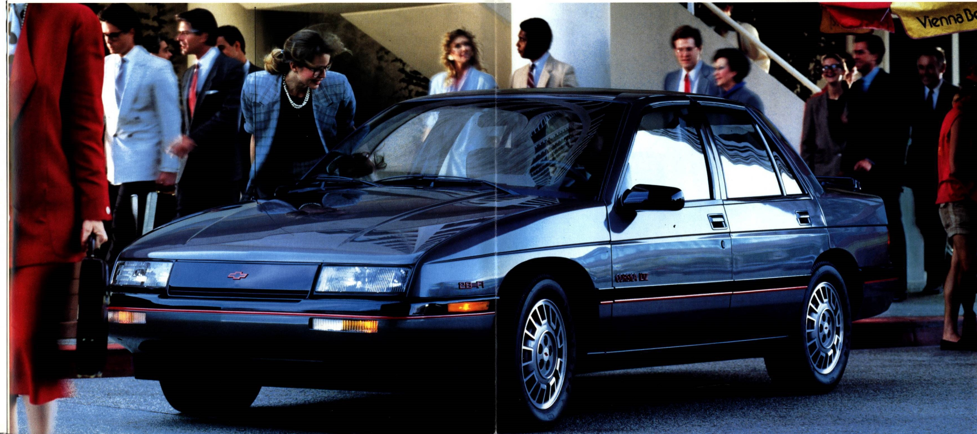
Corsica LTZ Sedan.