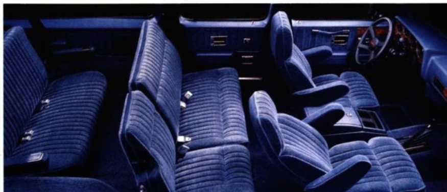
Suburban interior with optional Silverado trim and optional second and third rear seats.