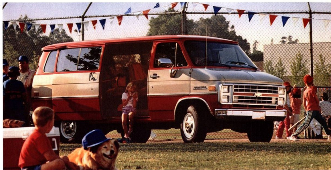
G30 Sportvan with sliding side door and optional Beauville trim.

In a word, it's Chevy's ultimate people-mover. Sportvan™ has comfortable seating options for up to 12 people, and twice the cargo space of a full-size station wagon.