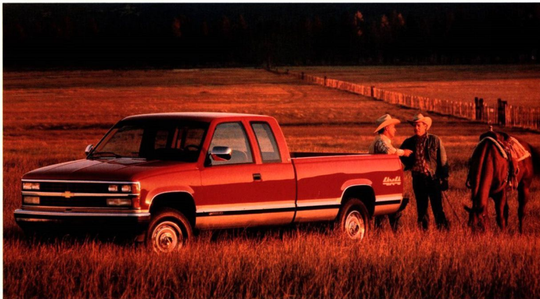
4x4 K2500 Series Extended Cab Pickup with optional Silverado trim.