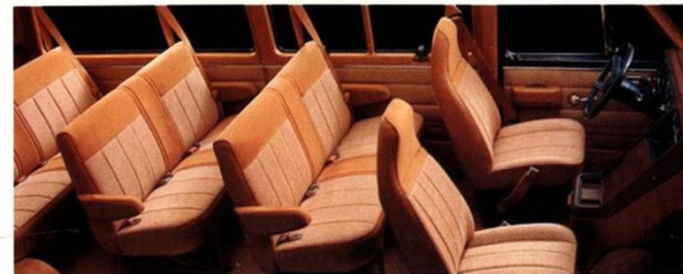
G30 Beauville interior with Custom Cloth and optional 12-passenger seating.

Other decisions awaiting you include your choice of standard (Sportvan) or top-level (Beauville®) trim (Beauville not available in 110-in. wheelbase). Most Sportvan buyers go for the Beauville. They apparently want not only cavernous passenger and cargo space but also the Sportvan ultimate in exterior and interior luxury.