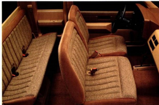
Six-passenger Extended Cab interior with optional rear bench seat and optional Silverado trim.

This is one superlative truck. For detailed information on its many engine choices, payload and towing capacities, comfort, convenience and performance options, see your Chevy truck dealer.