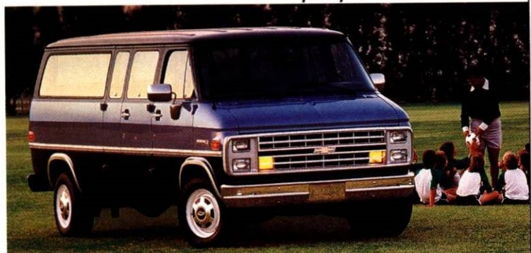
▲ G30 Extended-Body Beauville Sportvan with Deluxe Two-Tone in Royal Blue Metallic and Light Blue Metallic. ► Beauville cloth interior of G30 Extended-Body Sportvan in Blue with optional third- and fourth-row bench seats and 15-passenger capacity.

As of 1990, Chevy's premier people-mover can move 5, 8, 12 or 15 people. All aboard!