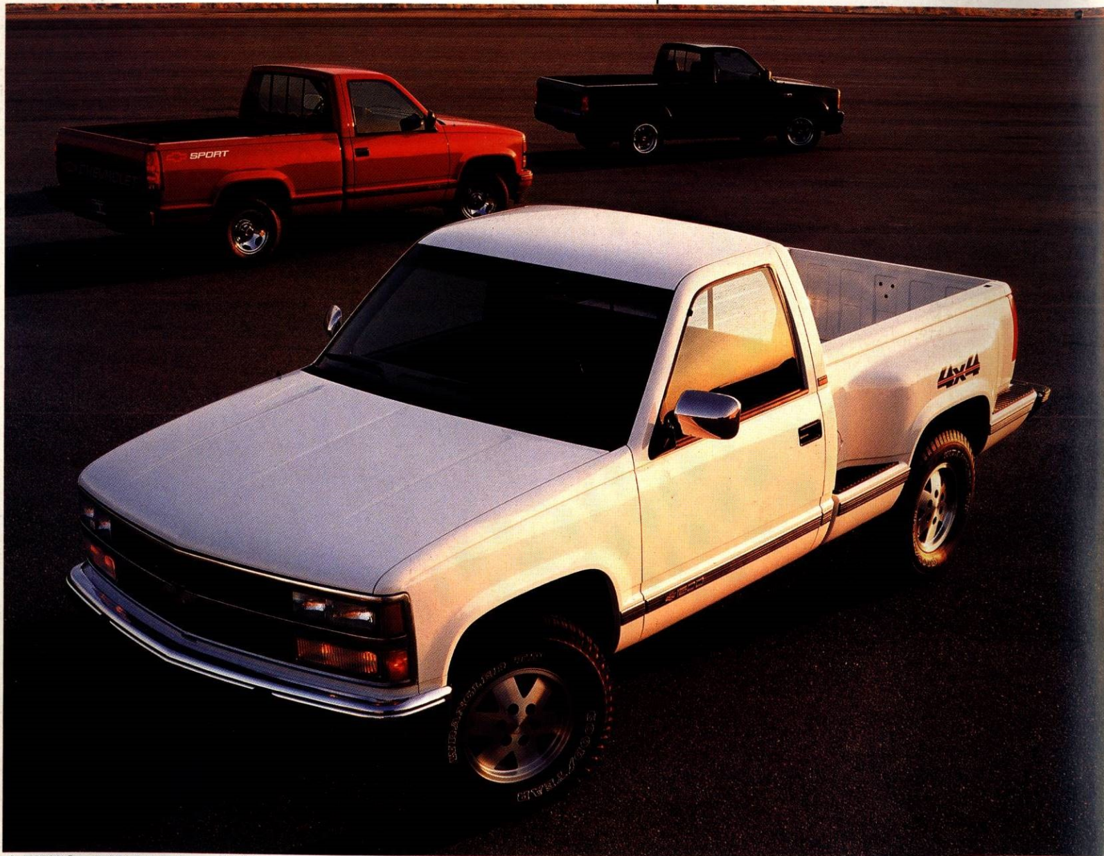
▲ K1500 Sportside 4x4 in Summit White.

Chevy's Short-Box 2WD or 4x4 C/K Pickup is also available with the optional Sport Appearance Package. "Sport truck" items include chrome-plated wheels (2WD models) or cast-aluminum wheels (4x4 models).