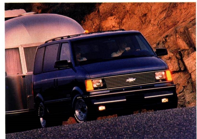
▲ All-Wheel-Drive Astro LT with Special Two-Tone in Smoke Blue Metallic and Catalina Blue Metallic. Tires supplied by various manufacturers.

The Astro® lineup for '90 includes an all-new All-Wheel-Drive (AWD) Astro model (available Nov. '89), shown lower left. It has a split-torque system that sends 65% of the torque to the front wheels and 35% to the rear wheels, thereby improving traction. AWD Astros also have a standard four-wheel anti-lock brake system (ABS).