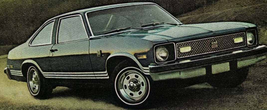
Chevy Nova RALLY