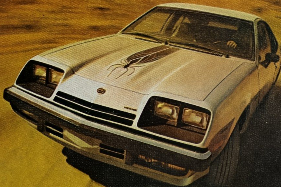
Chevy Monza SPYDER