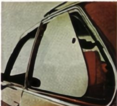
Swing-out rear side windows.