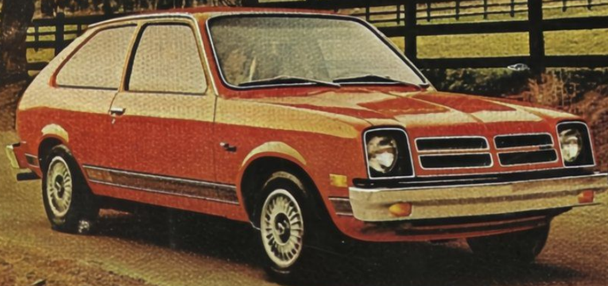
Chevy Chevette RALLY