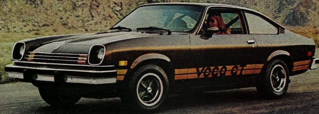
Chevy VEGA GT