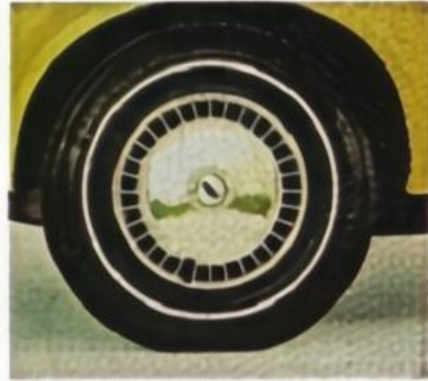
White stripe or white-lettered tires.