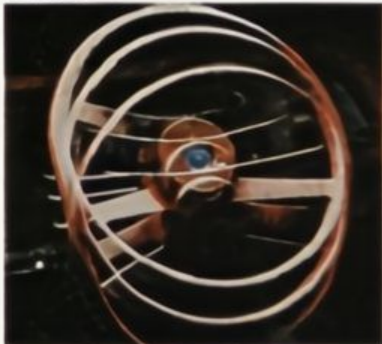
Comfortilt steering wheel.