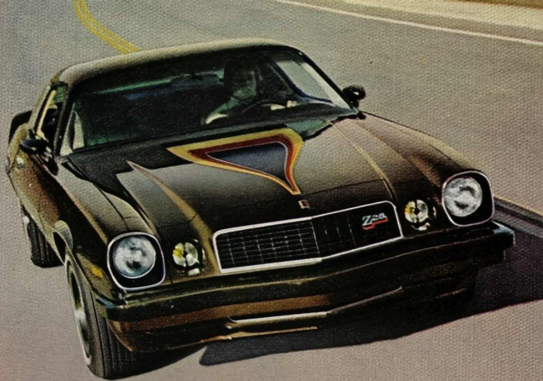
Chevy Camaro Z28