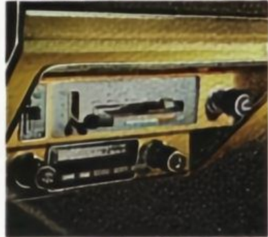
Four-Season air conditioning.