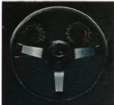
Sport steering wheel.