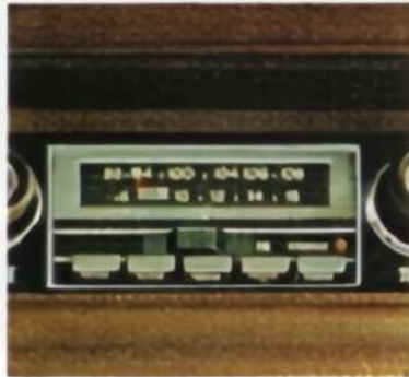
AM/FM stereo radio.