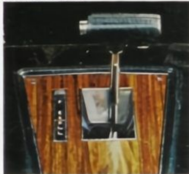
Turbo Hydra-matic transmission.