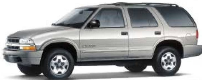
LIGHT PEWTER METALLIC