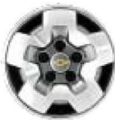
4x4 FIVE-SPOKE ALUMINUM WHEEL

Includes bright machined-face and argent-painted accents.