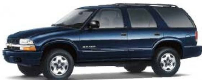
INDIGO BLUE METALLIC*