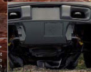
Blazer ZR2 2-Door 4x4 in Victory Red. Shown with available GM Accessories.

A skid plate for the front differential area and transfer case helps protect against debris when traveling on rough terrain.