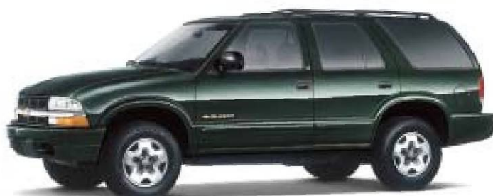
FOREST GREEN METALLIC