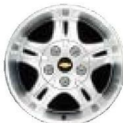
2WD XTREME DEEP-DISH FIVE-SPOKE ALUMINUM WHEEL

Includes bright machined-face and medium gray accents.