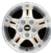
GOLD ACCENT 2WD XTREME DEEP-DISH FIVE-SPOKE ALUMINUM WHEEL

Standard with the Xtreme Package. Includes bright machined-face and argent-painted accents.