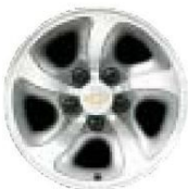
2WD FIVE-SPOKE ALUMINUM WHEEL

Includes bright machined-face and argent-painted accents.