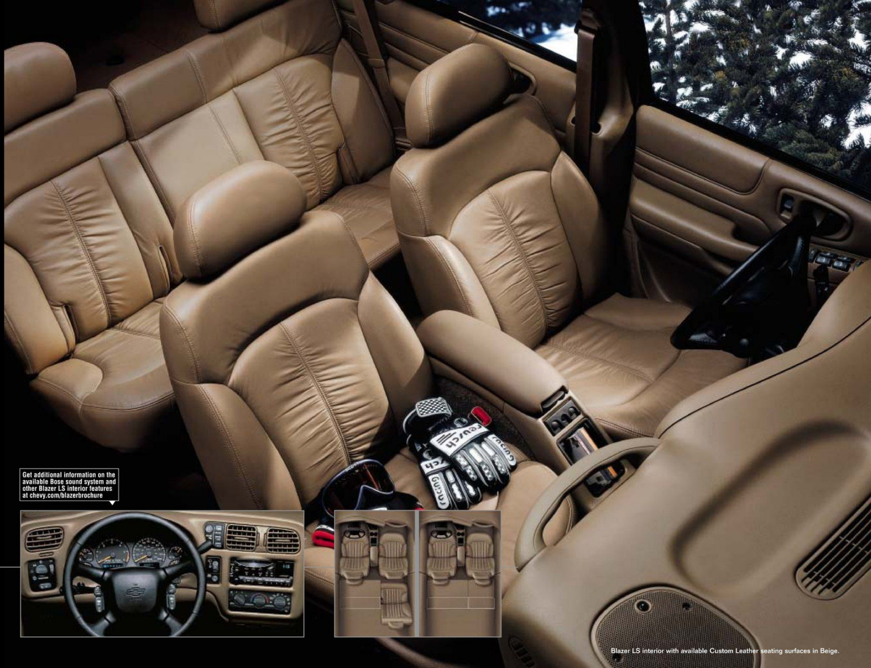
Blazer LS interior with available Custom Leather seating surfaces in Beige.