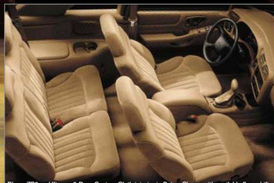
Blazer ZR2 and Xtreme 2-Door Custom Cloth interior in beige. Shown with available floor shifter.