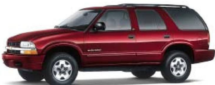
DARK CHERRY RED METALLIC*