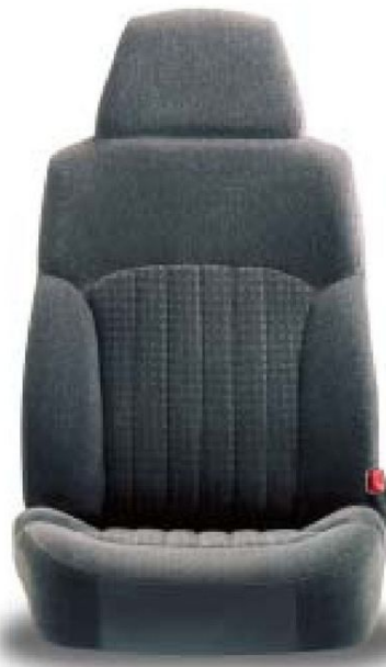
CUSTOM CLOTH TRIM

Standard with the Xtreme Package. Includes bright machined-face and gold-painted accents.