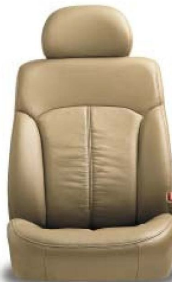
CUSTOM LEATHER SEATING SURFACES

Available with LS (4-Door 1SH only). Shown in Beige.