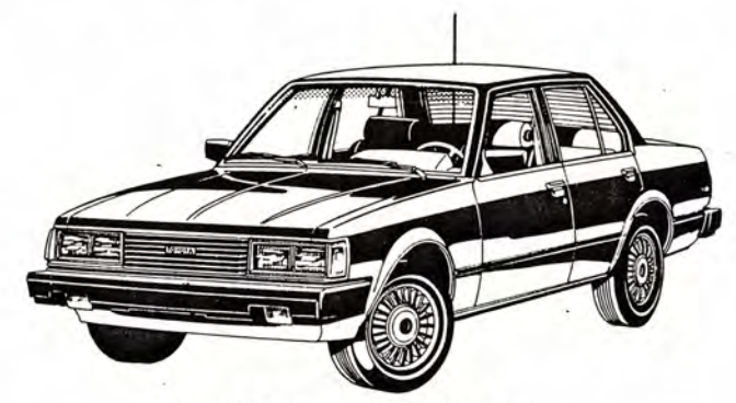
Corona 4-Door Luxury Edition Sedan

Corona combines contemporary styling with a full array of comfort and convenience features. Corona's overall value and quality exemplify Toyota's traditional image in the U.S. market.