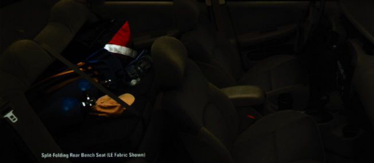
Split-Folding Rear Bench Seat (LE Fabric Shown)