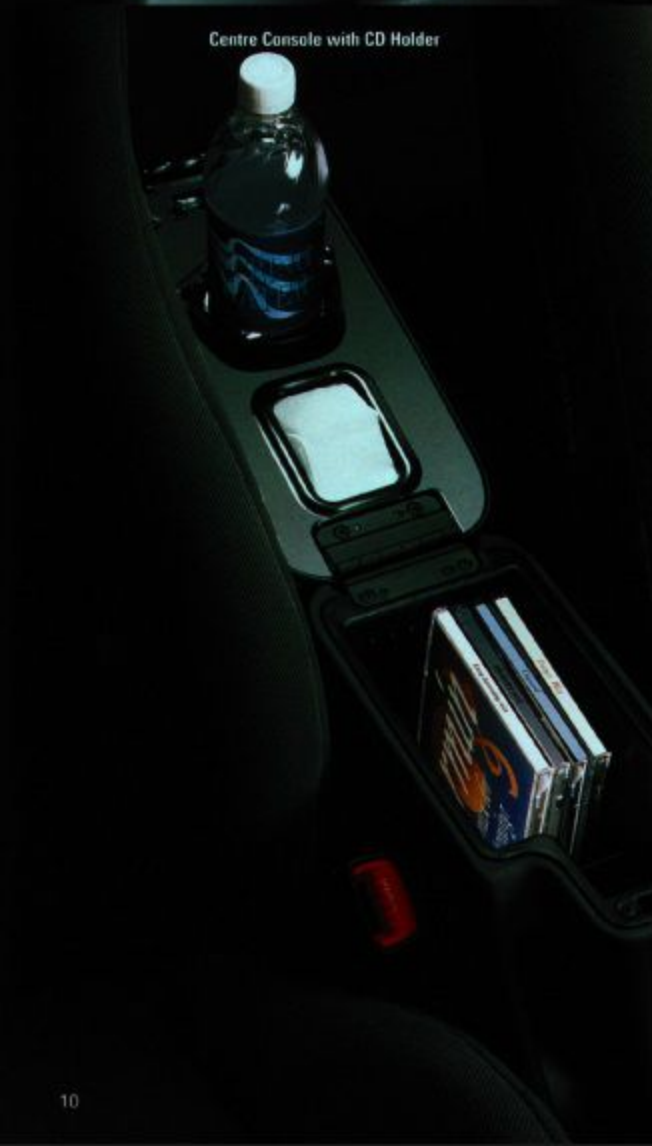
Centre Console with CD Holder