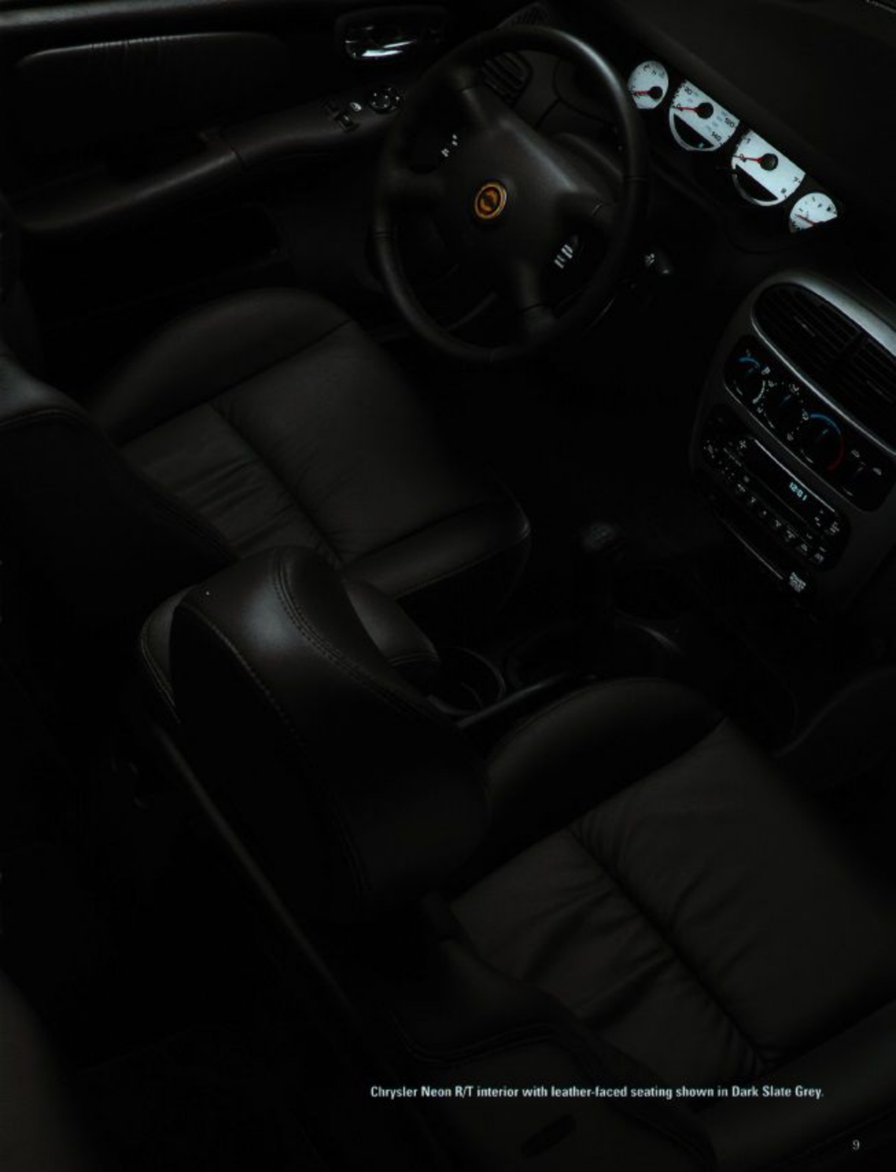
Chrysler Neon R/T interior with leather-faced seating shown in Dark Slate Grey.