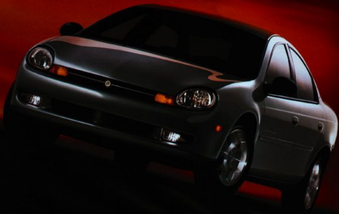
Chrysler Neon LX shown in Bright Silver Metallic.