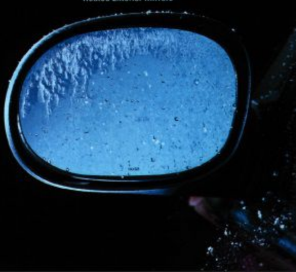
Heated Exterior Mirrors

Chrysler Neon delivers a very satisfying driving experience with features you would expect to find in a much more expensive sedan. For example, the centre console features space for tapes and CDs as well as special mouldings for holding anything from tissues and beverages to a litter bag. You'll also appreciate the large map pockets that can hold more than just maps, and the spacious glove box with