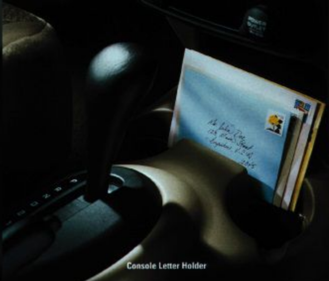
Console Letter Holder