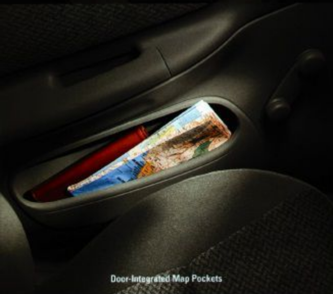
Door-Integrated Map Pockets

designed-in features like pen and tire gauge holders. For those of you who want to get away from it all, the fully carpeted trunk (with a thoughtful trunk lamp) offers 371 litres (13.1 cubic feet) of luggage capacity. The trunk even has an Inside Emergency Trunk Lid Release handle. Need more space? Just flip down the 60/40 split-folding rear seatbacks to transport anything from skis to lumber. Of course, Chrysler Neon is also packed with the features that turn a casual drive into a moving experience.