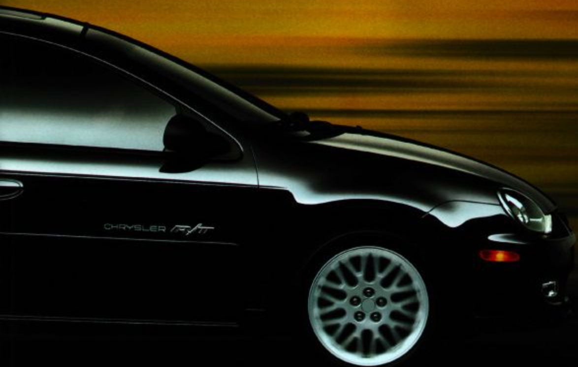
Chrysler Neon R/T shown in Black.