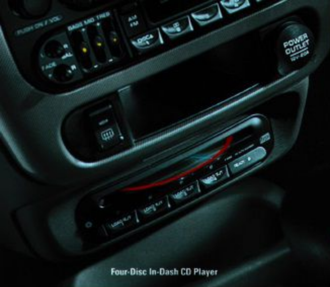
Four-Disc In-Dash CD Player