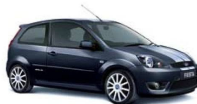
Panther Black with Silver overhead stripes 5 .