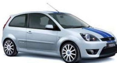
Moondust Silver with Blue overhead stripes 5 .