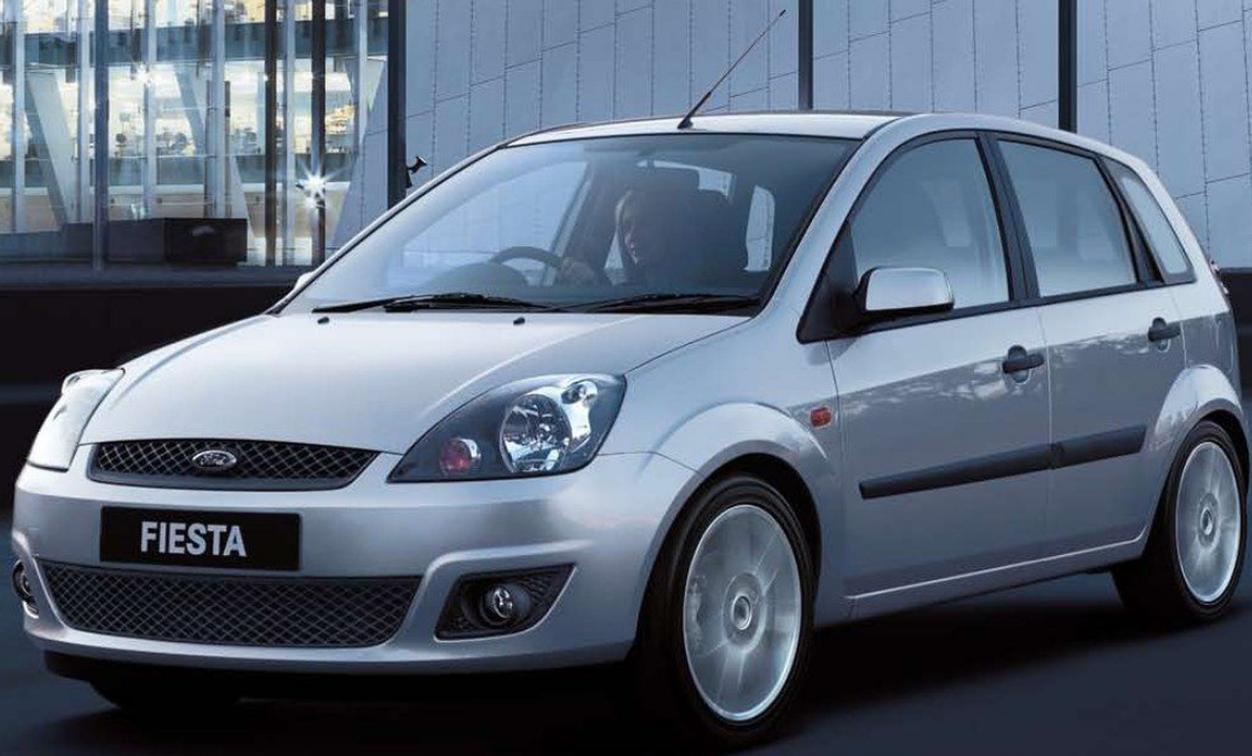
Fiesta Zetec 5 door shown in Moondust Silver.