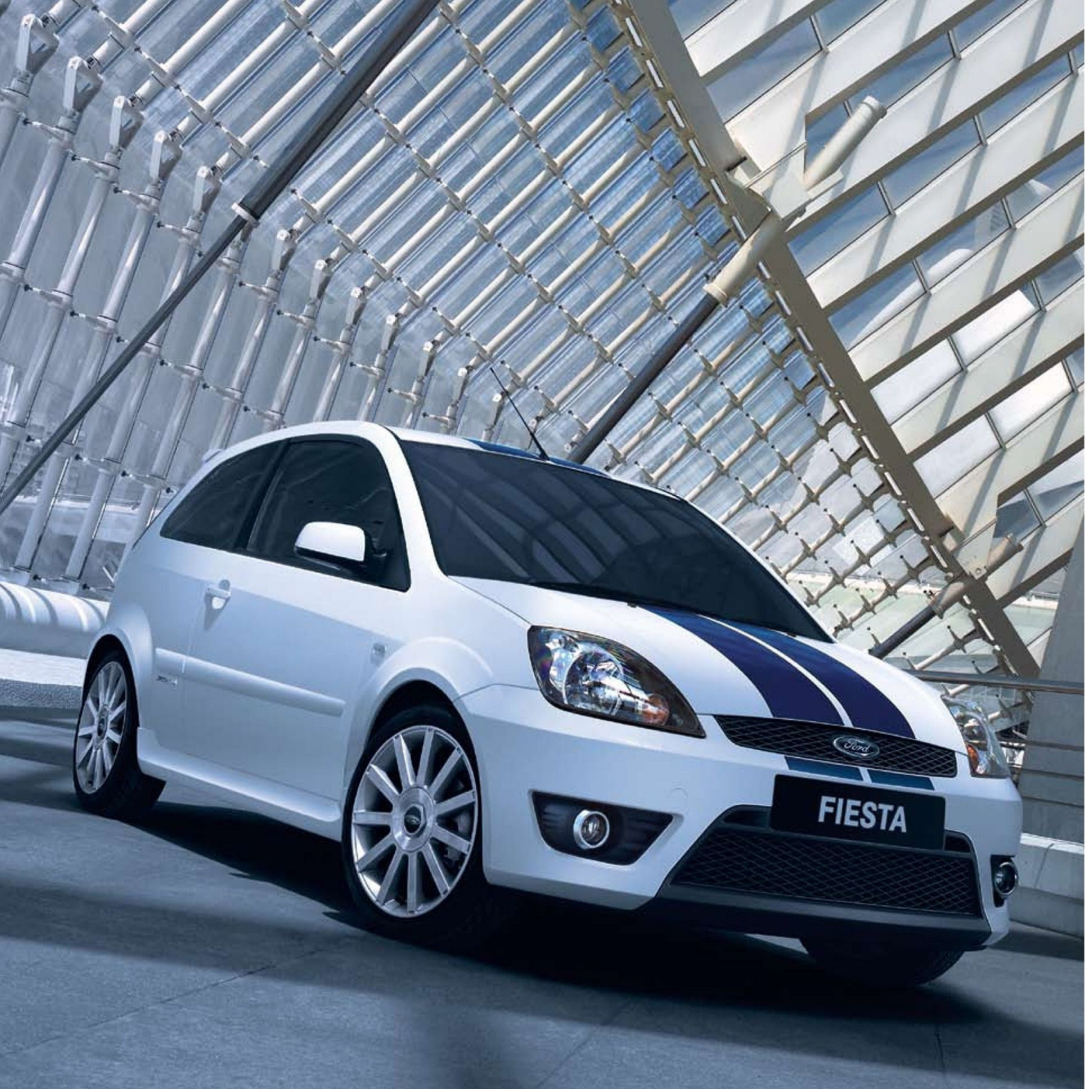
Fiesta XR4 shown in Frozen White with optional overhead stripes.