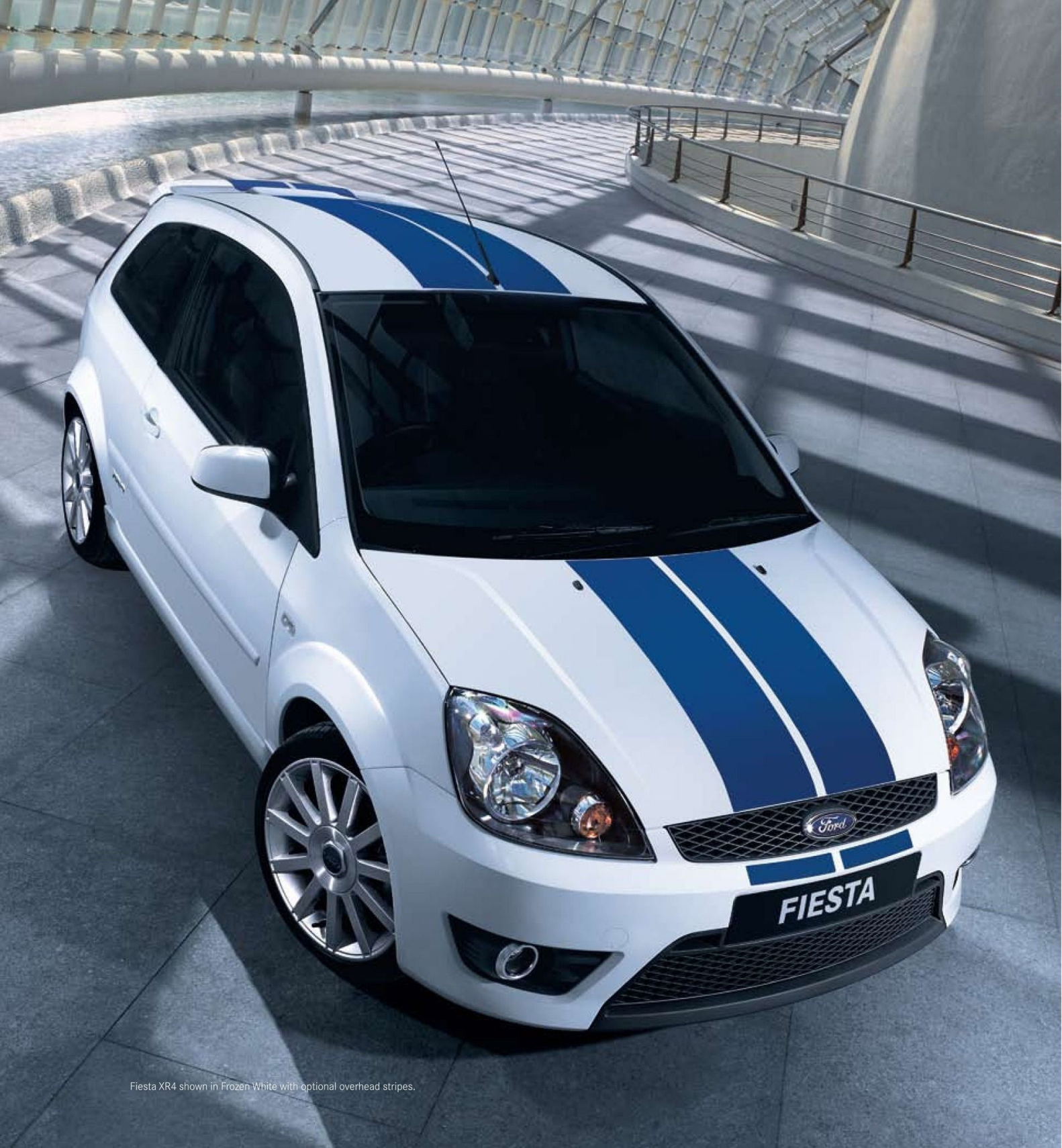
Fiesta XR4 shown in Frozen White with optional overhead stripes.