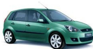
Verdigris 1,2 .