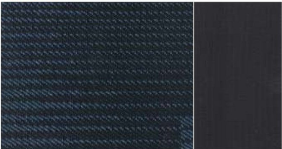
Moonlight Sapphire with Ebony bolster.