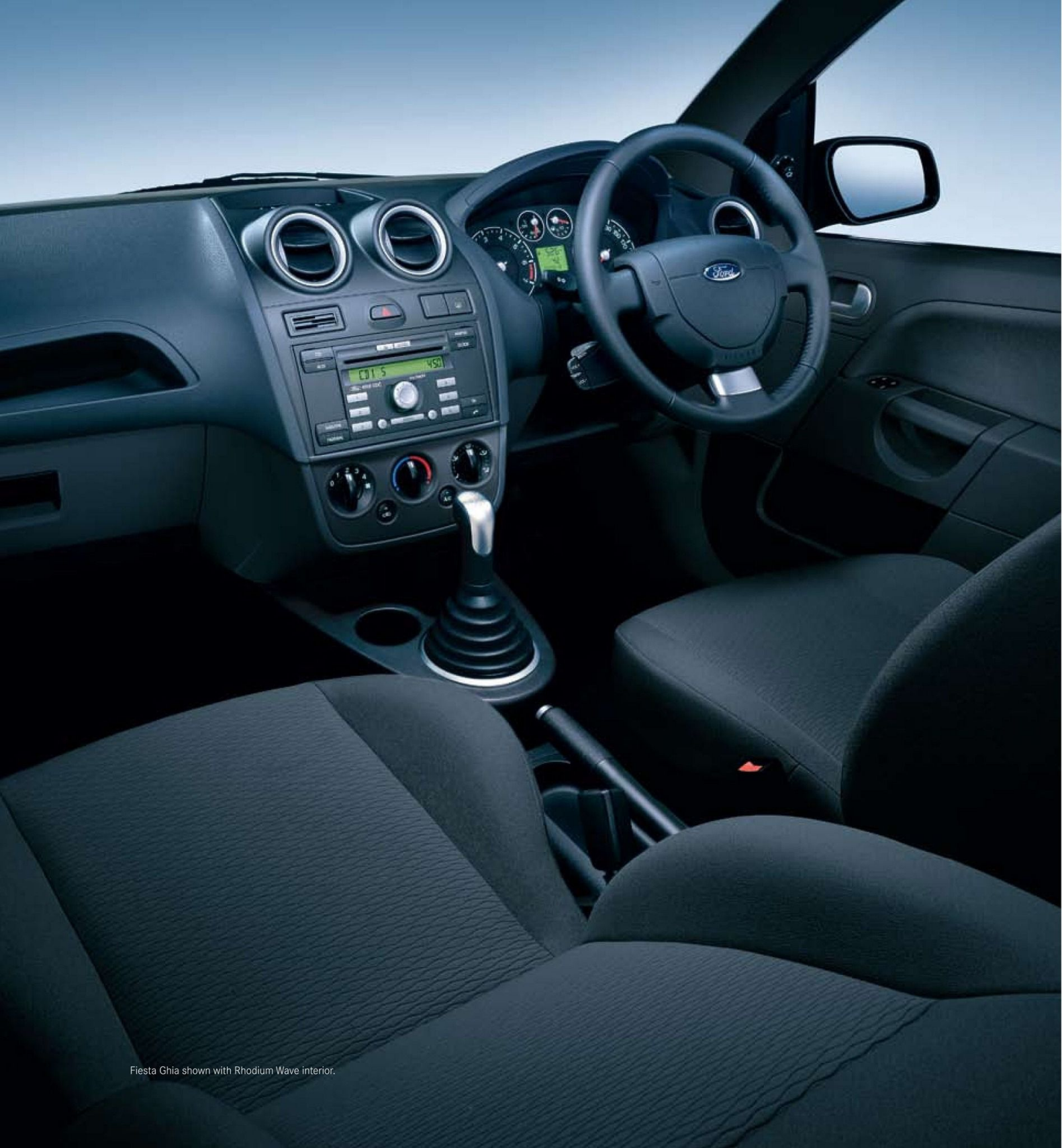
Fiesta Ghia shown with Rhodium Wave interior.