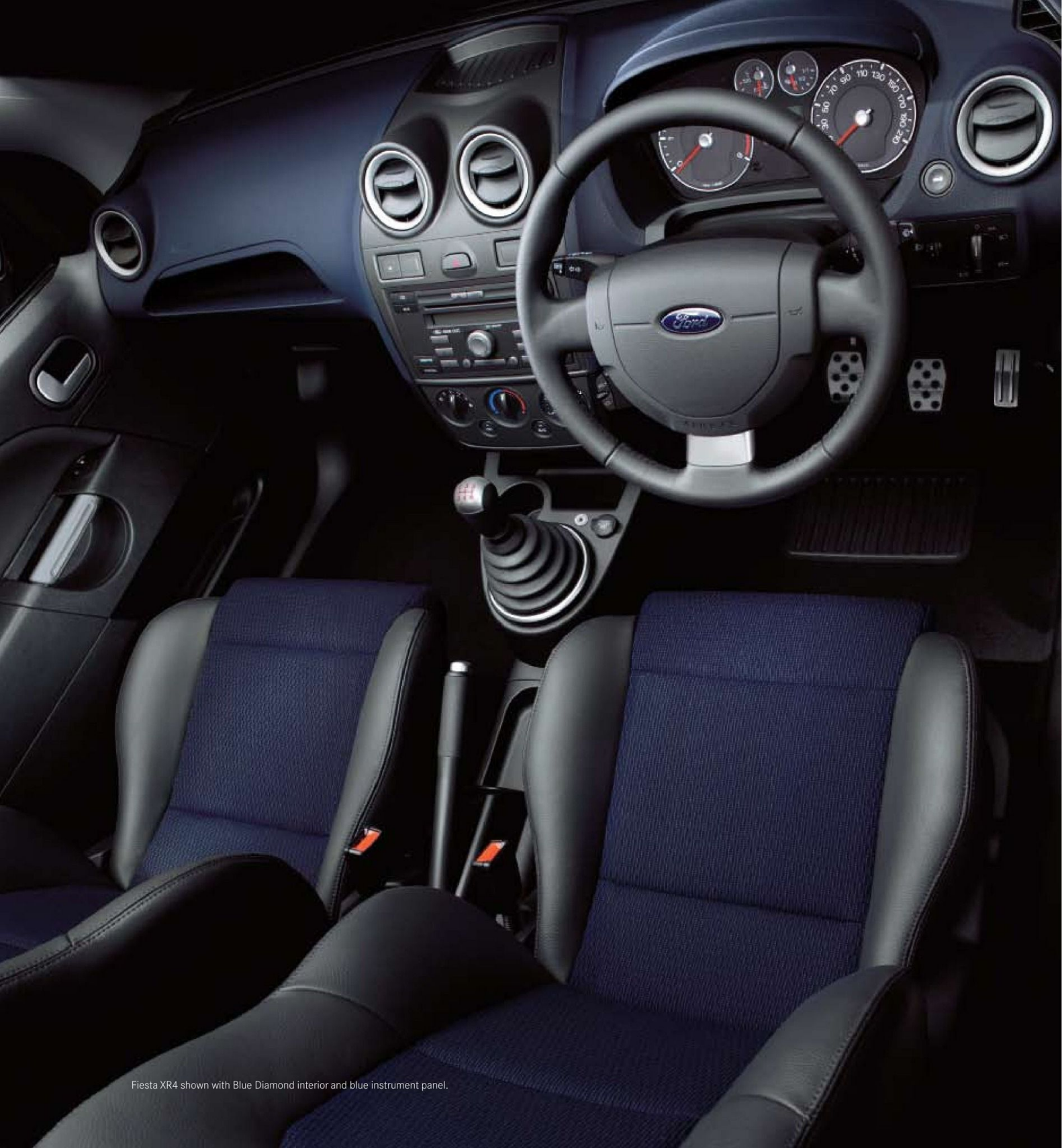
Fiesta XR4 shown with Blue Diamond interior and blue instrument panel.