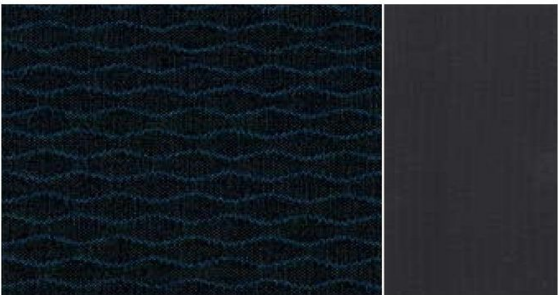
Rhodium Wave with Ebony bolster.