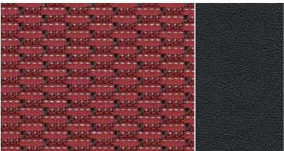
Hot Copper with Ebony leather bolster.