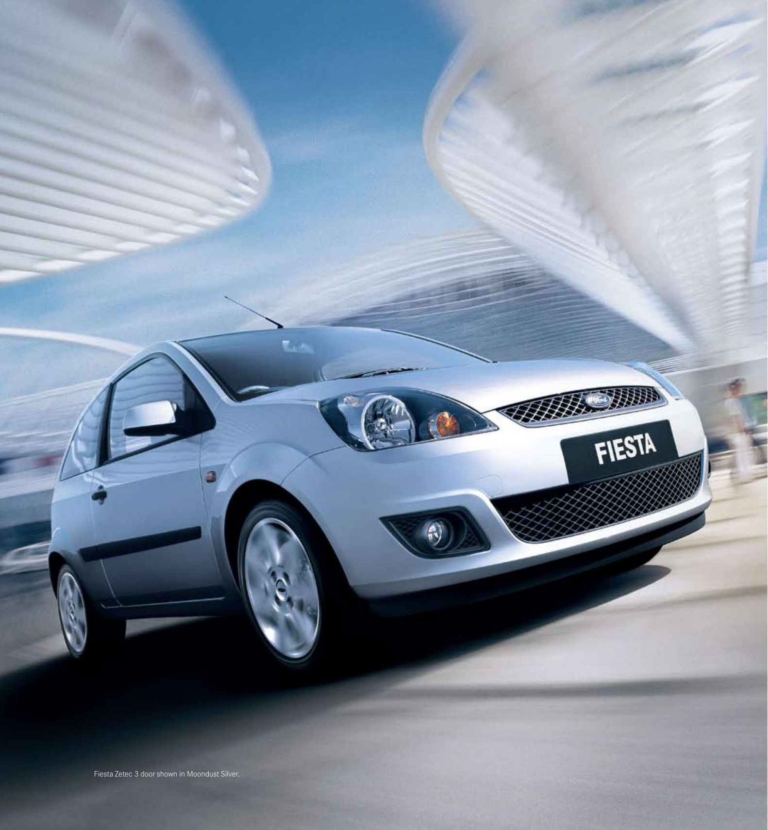
Fiesta Zetec 3 door shown in Moondust Silver.