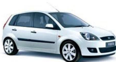
Frozen White 1 .