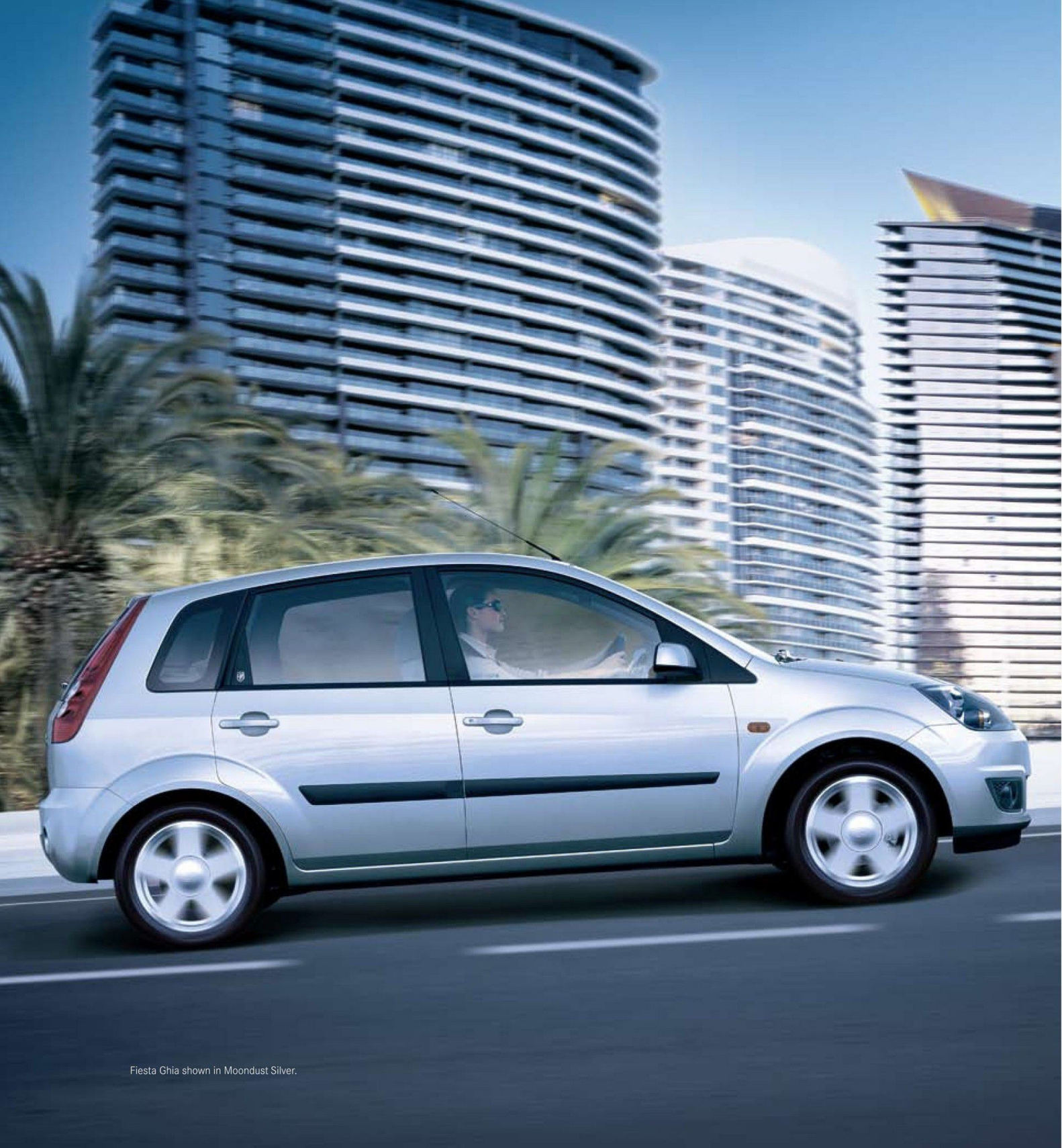
Fiesta Ghia shown in Moondust Silver.