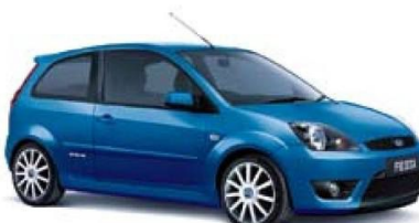
Performance Blue 4 .