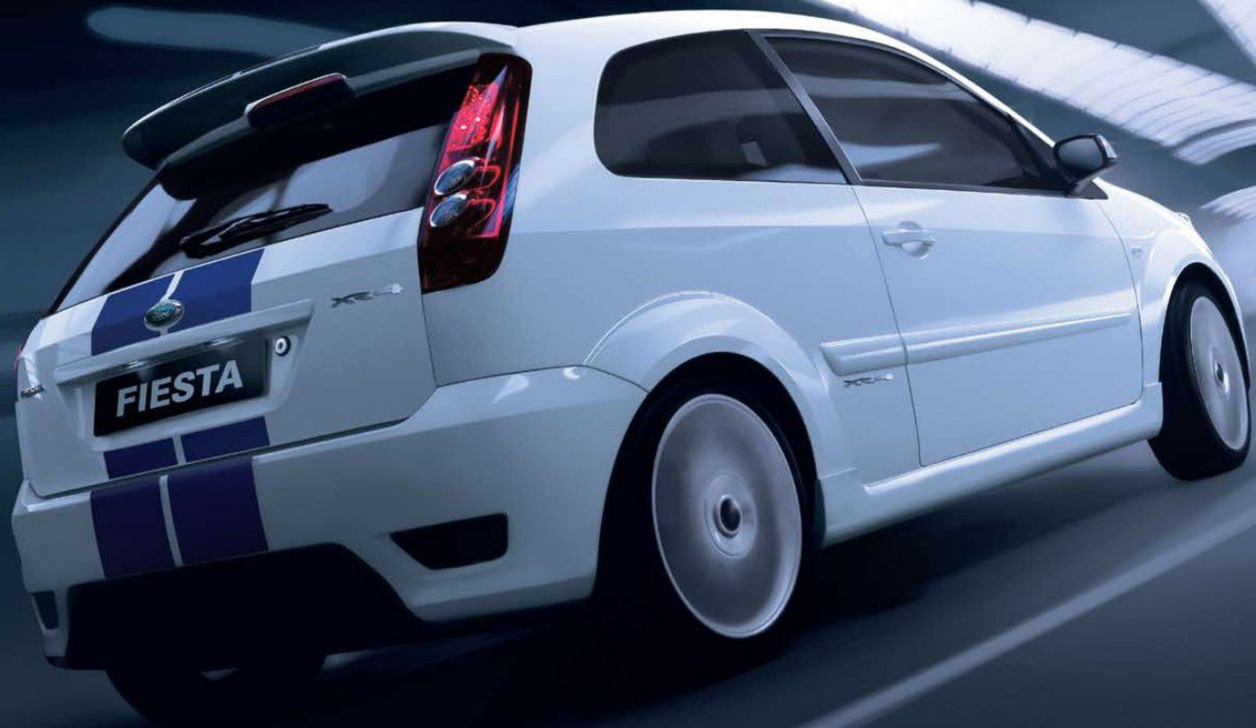
Fiesta XR4 shown in Frozen White with optional overhead stripes.