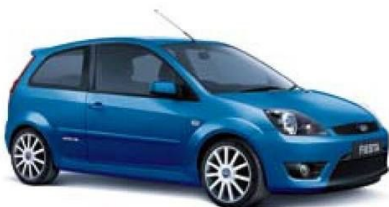
Performance Blue with White overhead stripes 5 .