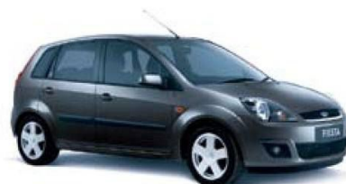
Sea Grey 3 .