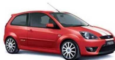
Colorado Red with White overhead stripes 5 .