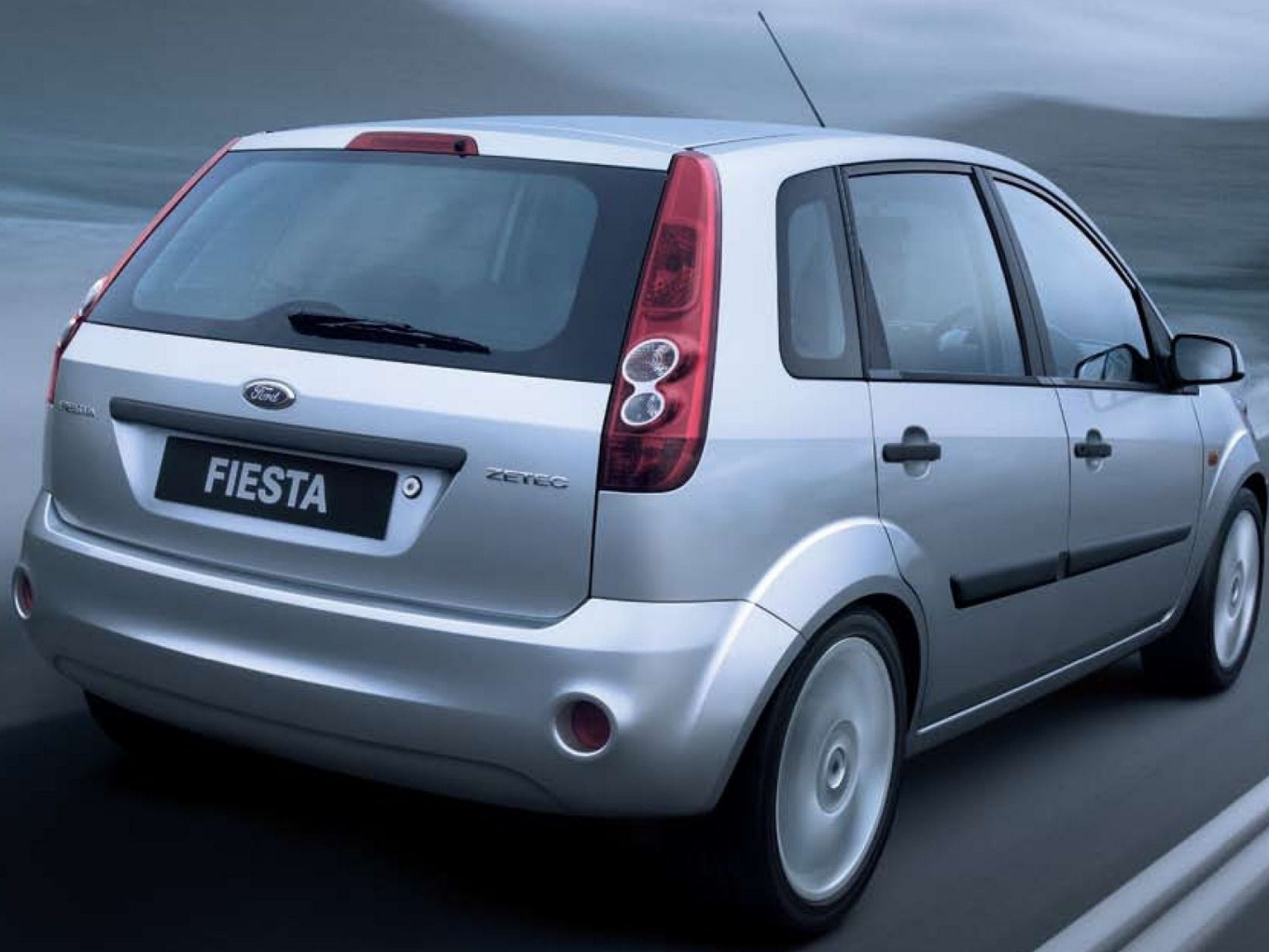
Fiesta Zetec 5 door shown in Moondust Silver.