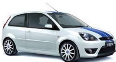
Frozen White with Blue overhead stripes 5 .