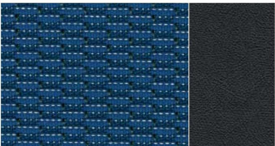
Blue Diamond with Ebony leather bolster.