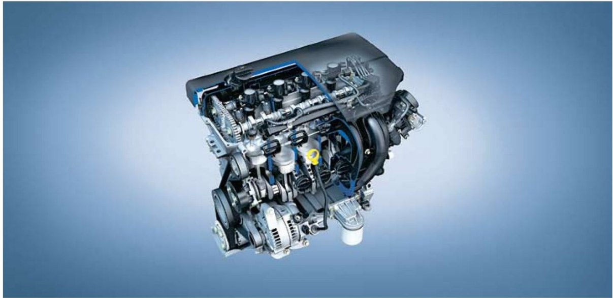
Ford Fiesta XR4's 2.0L Duratec 16V engine with 110kW of power and 190Nm of torque, so even city driving can be loads of fun.