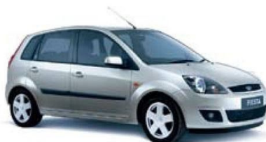
Moondust Silver 3 .