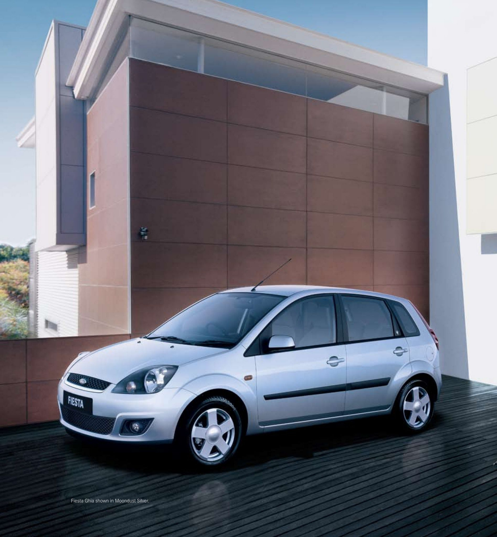
Fiesta Ghia shown in Moondust Silver.