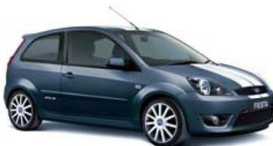
Sea Grey with White overhead stripes 5 .