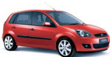
Colorado Red 1 .