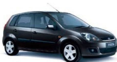
Panther Black 3 .