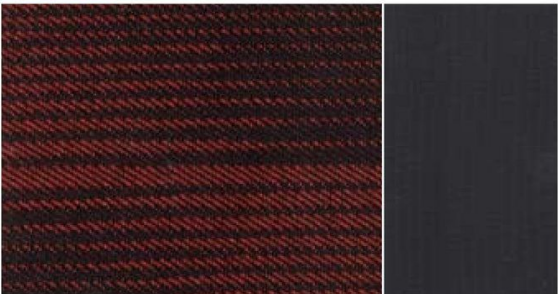
Moonlight Ruby with Ebony bolster.