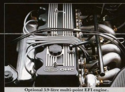
Optional 3.9-litre multi-point EFI engine.

It produces an impressive 120kW maximum power at 4250rpm and 311Nm maximum torque at 3250rpm. The advanced fuel injection, coupled with the Ford EEC4 engine management system, precisely controls fuel metering to accomplish an efficient fuel burn. This converts to exciting performance and notable fuel economy.