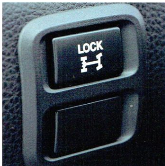
> Remote Differential Locking System Switch to 'shift on the fly'.

* Not available with Column Shift Automatic option.