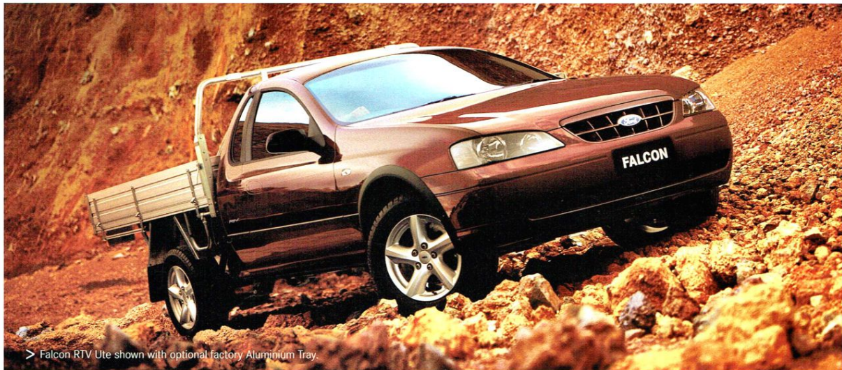
> Falcon RTV Ute shown with optional factory Aluminium Tray.