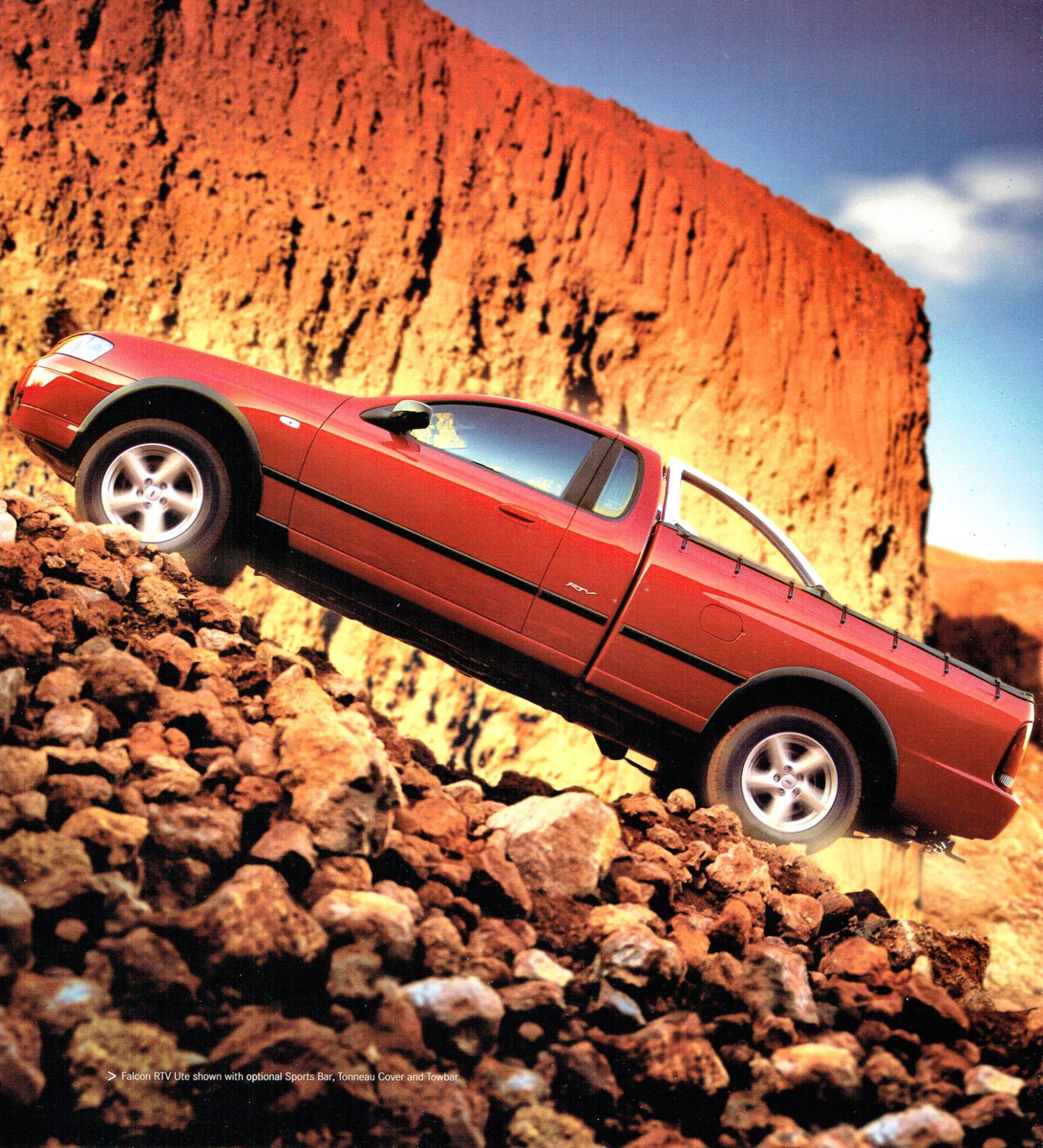
> Falcon RTV Ute shown with optional Sports Bar, Tonneau Cover and Towbar.