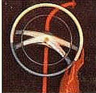
Dodge Full-Disc Coaxial Power Steering*. Reduces steering effort 80%. Steadier, safer.