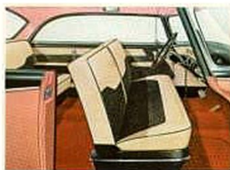
Royal Lancer V-8 interiors feature Jacquard fabrics in Black, green or blue, with white trim.