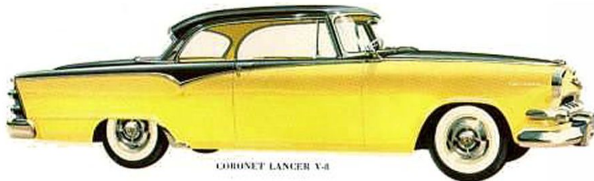
CORONET LANCER V-8

The Coronet Lancer V-8, too, ( below ), has all the exciting Lancer sparkle and style, plus the fine Coronet tradition of economy and dependable performance with a great new 175-h.p. Red Ram V-8 engine. Fashioned with the full, swept-back "New Horizon" windshield, the Coronet Lancer belongs in any company, anywhere.