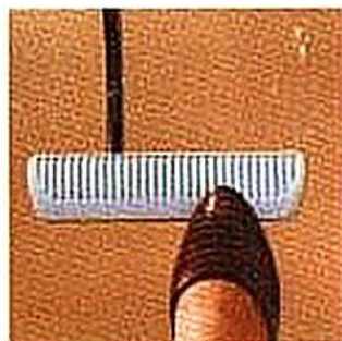
Dodge Safety Disc Brakes* with extra-wide brake pads. Reduce braking time one second by 35%.