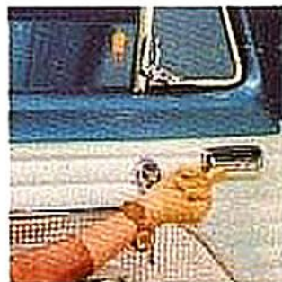
Dodge Automatic Window Lift* and Dodge 4-Way Power Seat*. Smooth, more power assistance at the flip of a fingertip.