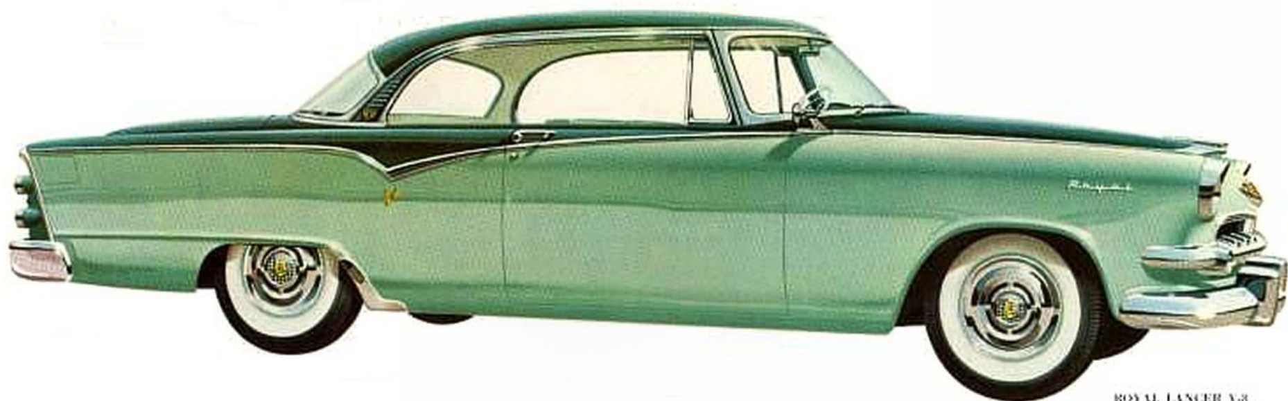
ROYAL LANCER V-8