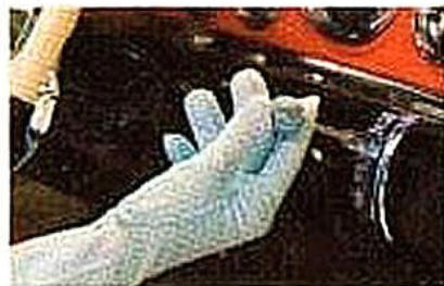
New Fine Control for '55 Dodge Full-Disc Automatic Power-Fit Drive*. The hand that guides this lever rules the road.