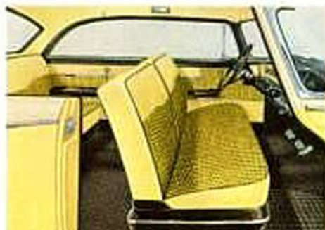
Special Coronet Lancer V-8 deluxe interior has yellow or Black Jacquard seats; white Coolgrain trim.