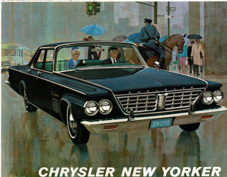
(4-Door Sedan in Formal Black with Turquoise interior.)