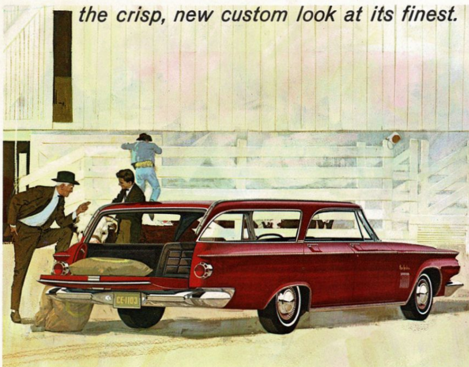
(9-Passenger Town and Country Wagon in Claret with Black interior.)

the crisp, new custom look at its finest.