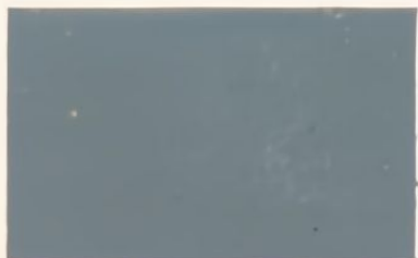
SILVER GREY (METALLIC)