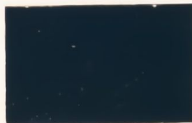
CASPIAN BLUE (METALLIC) ★