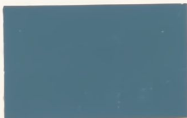
SILVER BLUE (METALLIC)