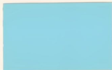
POWDER BLUE ★