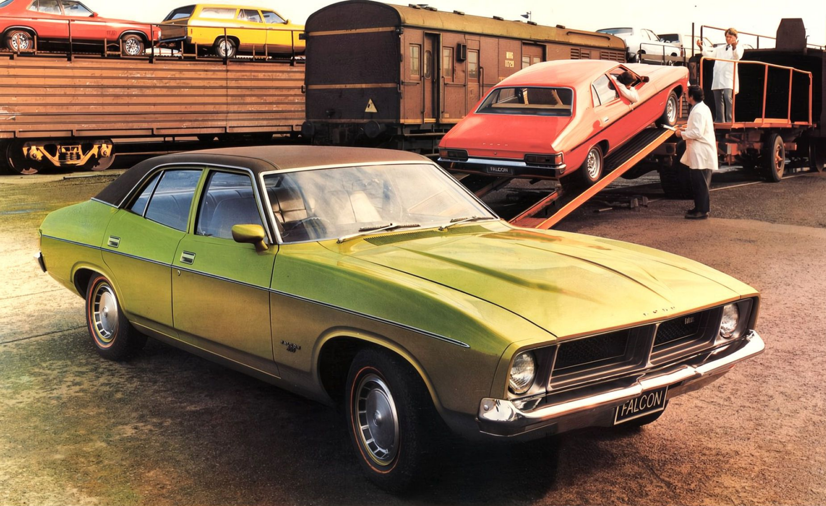
Illustrated above: Falcon 500 in foreground with optional vinyl roof and full wheel covers (available at extra cost). Falcon 500 in background with optional GS pack (available at extra cost).