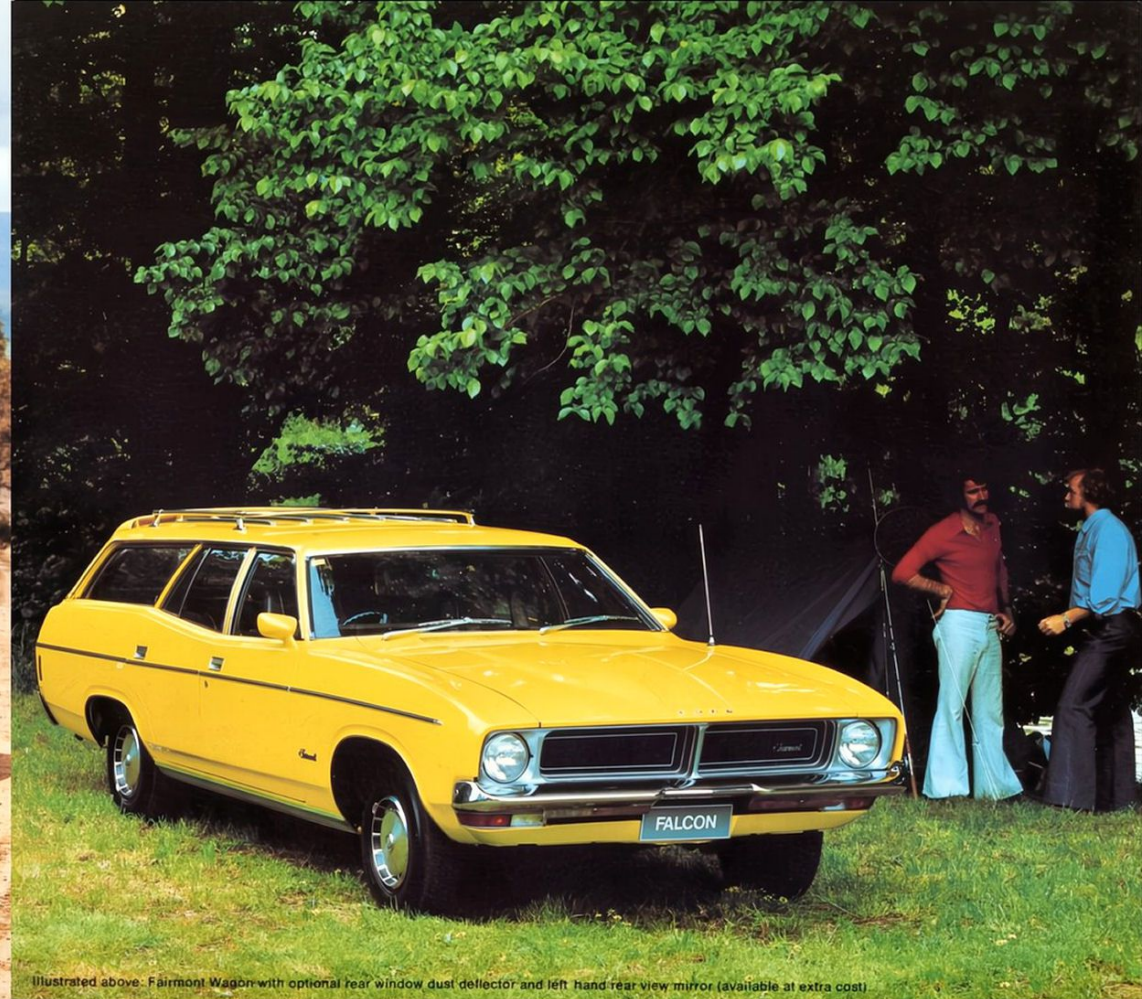
Illustrated above: Fairmont Wagon with optional rear window dust deflector and left hand rear view mirror (available at extra cost)