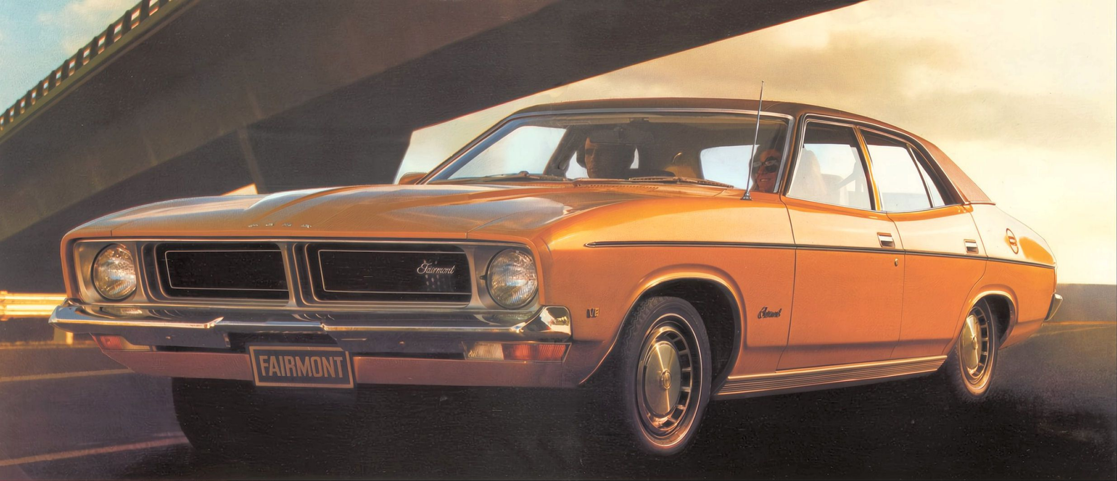
Illustrated front cover: Falcon 500 with optional GS pack and radio (available at extra cost).