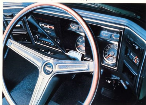
Above: GS pack instrumentation with optional automatic transmission and radio/tape player (available at extra cost).