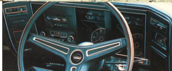
Illustrated above: Falcon GT interior with optional push button radio (available at extra cost).