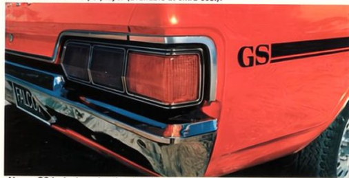
Above: GS insignia and optional radial ply tyres (available at extra cost). Below: Falcon 500 interior with optional GS pack, cloth upholstery, T-bar floor shift and console (available at extra cost).