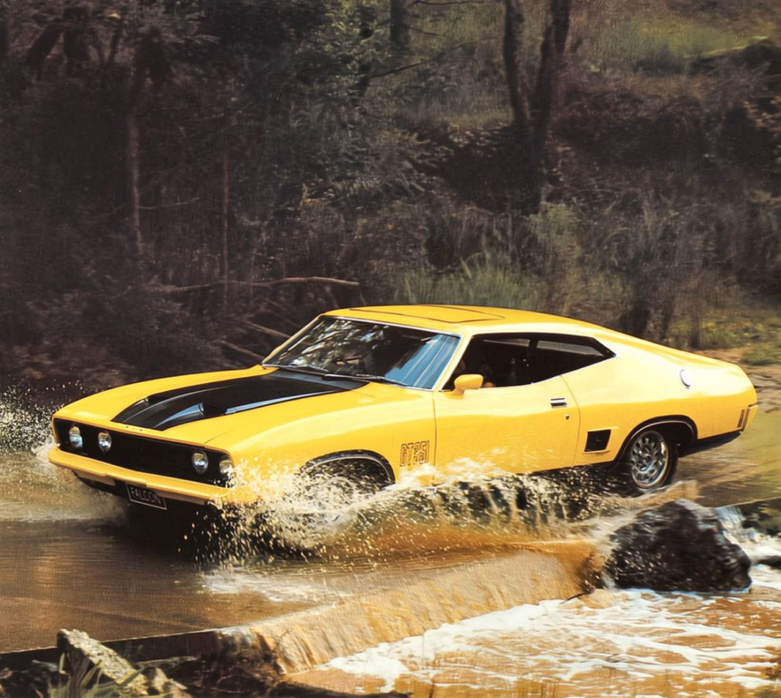
Illustrated above: Falcon GT Hardtop with optional sliding sunroof (available at extra cost).