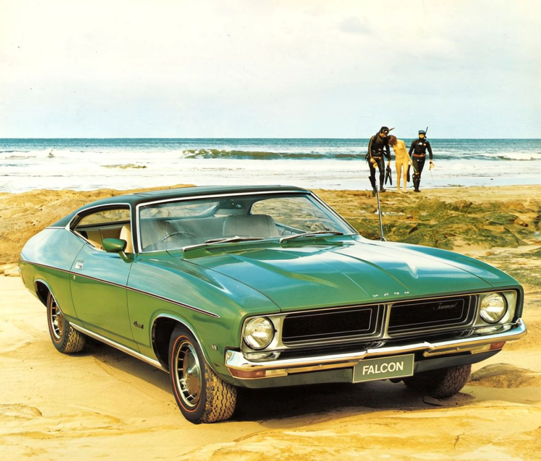
Illustrated above: Fairmont Hardtop with optional 4.9 litre V8, vinyl roof, sliding sunroof and red wall radial ply tyres (available at extra cost).