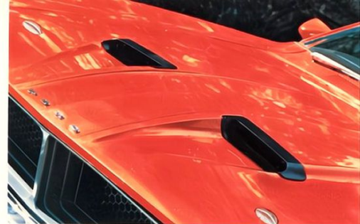
Above: "NASA" bonnet scoops standard with GS pack.

Illustrated lower left: Falcon 500 Wagon with optional GS pack and red wall radial tyres (available at extra cost).