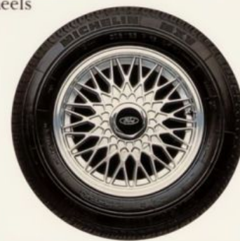
Alloy wheels and Michelin tyres.

superbly stylish alloy wheels and Michelin 205/65 tyres. Naturally, the extensive list of features that make Fairlane the superb car it is, can be found as standard on Sportsman.