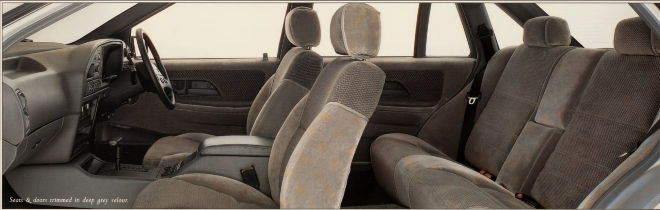
Seats & doors trimmed in deep grey velour.