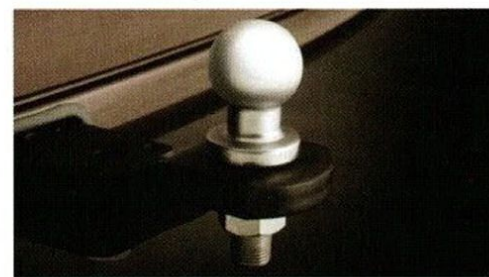
Towing packages: A specially designed range of towing packages are available to suit your specific towing needs. See your Holden Dealer for full details.