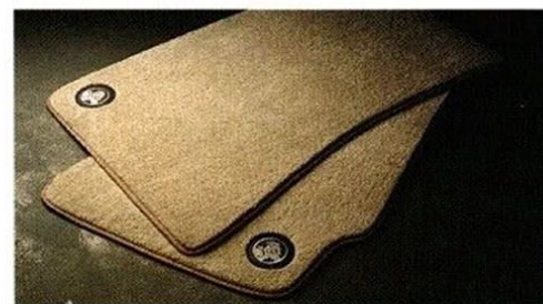
Carpet mats: Help keep your Commodore in its original condition with these fully tailored, high quality long pile carpet floor mats, now with a new anti-slip backing.