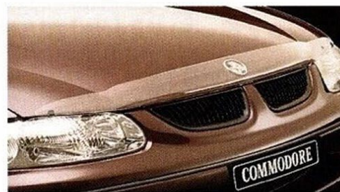
Bonnet Protector: Don't let stone chips and scratches detract from the superb paint finish. This durable acrylic custom design can be easily removed for cleaning.