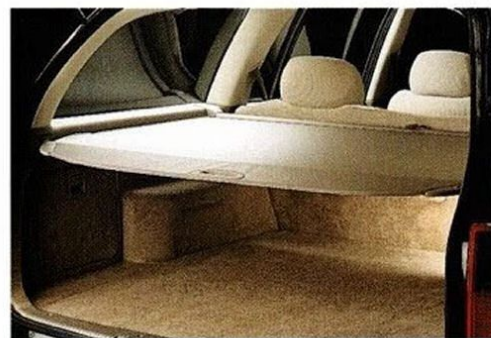
Cargo blind: Stylish, integrated design draws out to provide protection from the sun and provides added security for the back of wagons.