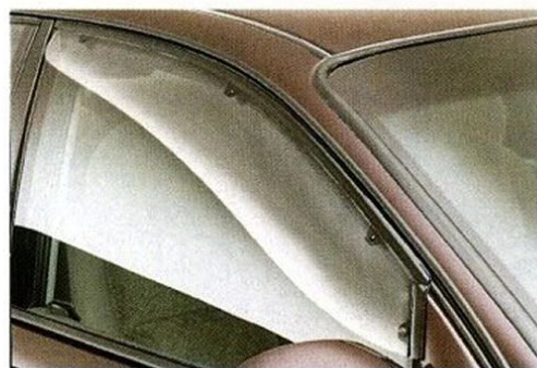
Weathershield: Let the fresh air in and keep the wind and rain out with this full sized weathershield. Stylish, slimline version also available.

(Other Warranty conditions apply when accessories are fitted after new car purchase).