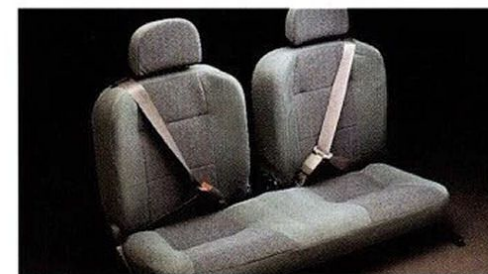
Third seat package: Turn your wagon into a seven seater family mover with this third seat package. Designed to accommodate children, up to the size of an average 12 year old. Available in matching trim for all wagons.