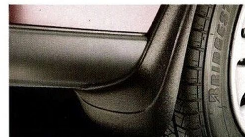
Moulded mud flaps: Integrated in Commodore's fascia design, these fully moulded mudflaps are both practical and stylish. (Not designed for S and SS models).