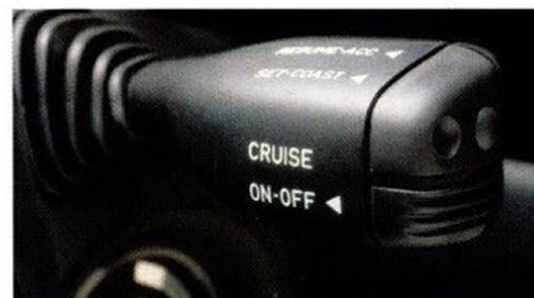
Cruise control: By maintaining a set speed, cruise control helps long country kilometres glide by effortlessly and improves fuel economy.