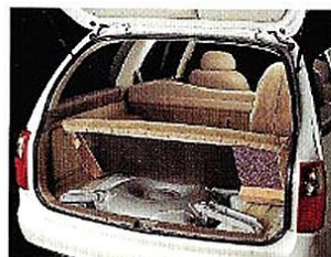
Just like the sedan, the Commodore wagon retains the full 75 litre petrol tank capacity as well as 60 litres of LPG, providing an extra long driving range when you need it.

So talk to your dealer now, and take off with Holden LPG.