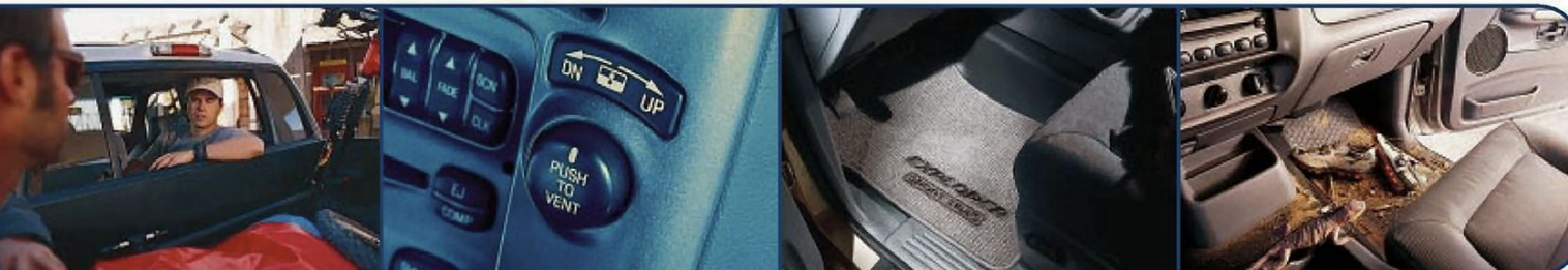
power rear window

Explorer Sport Trac's unique design includes a power rear window that provides you with refreshing flow-through ventilation and access to cargo in the rear. Tap the dash mounted control knob and the window opens just a bit. Twist it, and the window opens all the way.