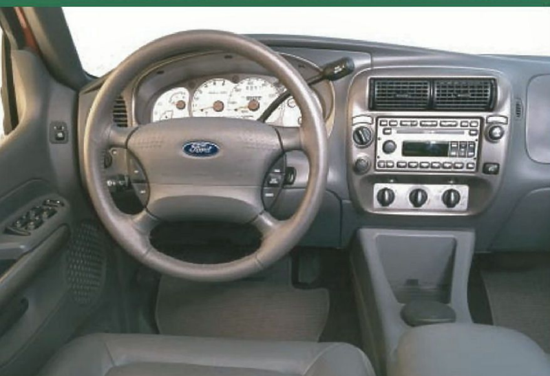
White-faced gauges are stylish and easy to read. The tachometer is standard equipment. (Metric instrumentation is standard in Canada.)

Reliable Performance Reliable Performance Reliable Performance