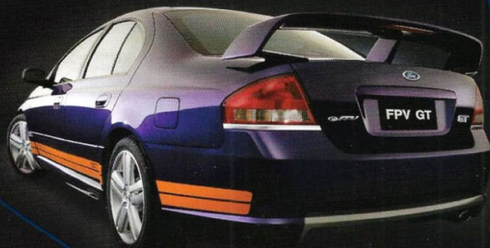
GT shown in Phantom with optional FPV stripe package.

For all the latest information from Ford Performance Vehicles, visit www.fpv.com.au or call 133 FPV (133 378).