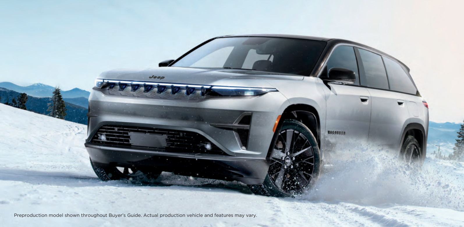
Preproduction model shown throughout Buyer's Guide. Actual production vehicle and features may vary.