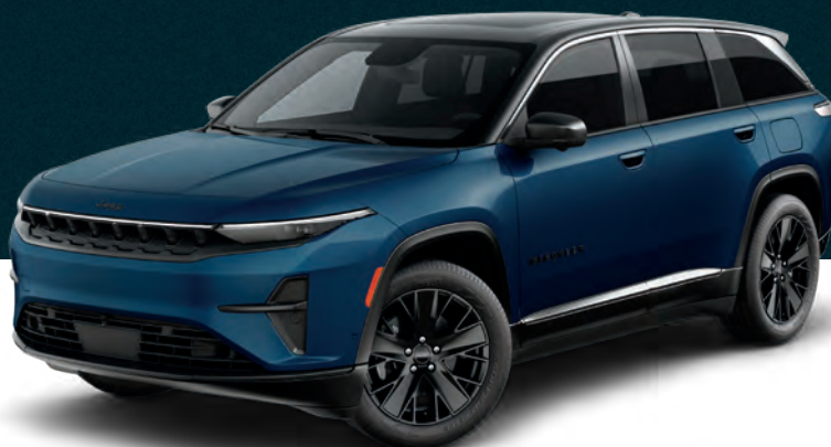
Fathom Blue Pearl