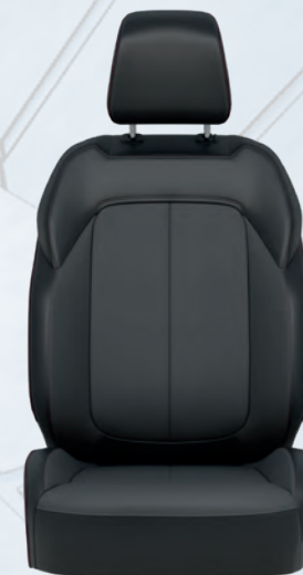
Sicily Leatherette with Axis II Perforations, Blue Agave/Wine Dual Accent Stitching and Rouge Piping — Global Black (Standard)

For more details on Free2move Charge, please see page 7.