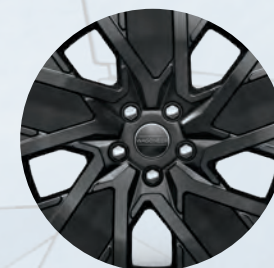
20-inch Painted Aluminum (Standard)