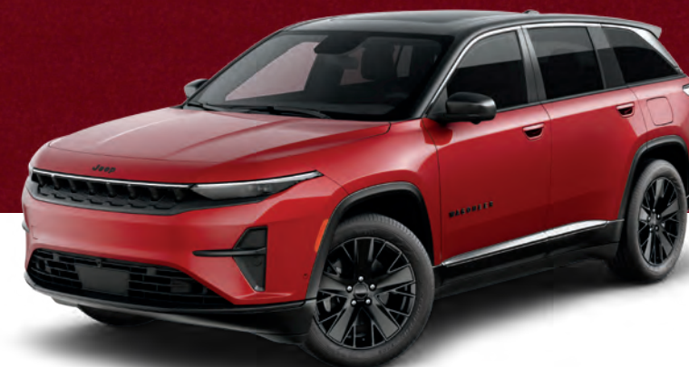
Red Hot Pearl