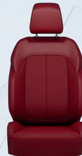
Sicily Leatherette with Axis II Perforations, Blue Agave/Light Slate Grey Dual Accent Stitching and Frost Piping — Black/Radar Red (Available)