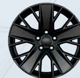
20-inch Gloss Black-Painted Aluminum (Available)