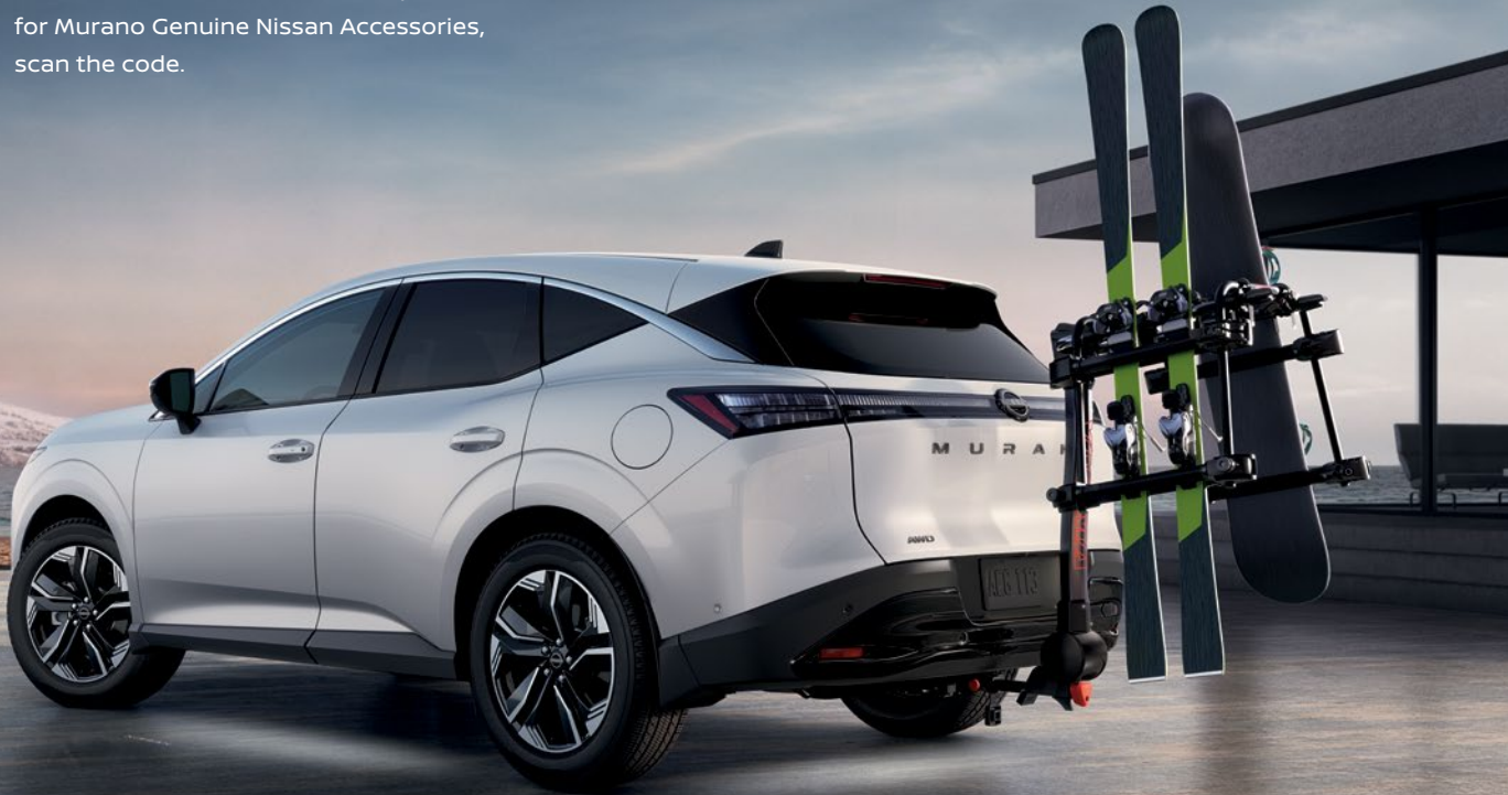
Nissan Murano® SV AWD shown in Pearl White TriCoat with 20" Dark Charcoal Aluminum-Alloy Wheels, Splash Guards (4-piece set), Exterior Ground Lighting w/ Logo and Rear Illumination, Tow Hitch Receiver Kit, Class I, 34, 45 Affiliated: Yakima® RidgeBack 4 — Hitch Mount Bike Rack, 33, 35 Affiliated: Yakima® HitchSki — Hitch Mount Ski Adaptor. 33, 35

For more information and to shop online for Murano Genuine Nissan Accessories, scan the code.