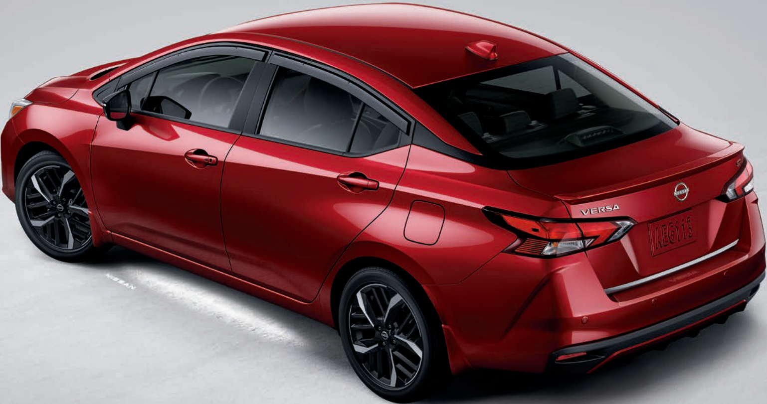
Nissan Versa® SR shown in Scarlet Ember Tintcoat 1 with Chrome Trunk Finisher, Exterior Ground Lighting w/ Logo, Side-Window Deflectors, Rear Spoiler (standard on SR), Clear Rear Bumper Protector, and Splash Guards (4-piece set).

For more information and to shop online for Versa® Genuine Nissan Accessories, scan the code.