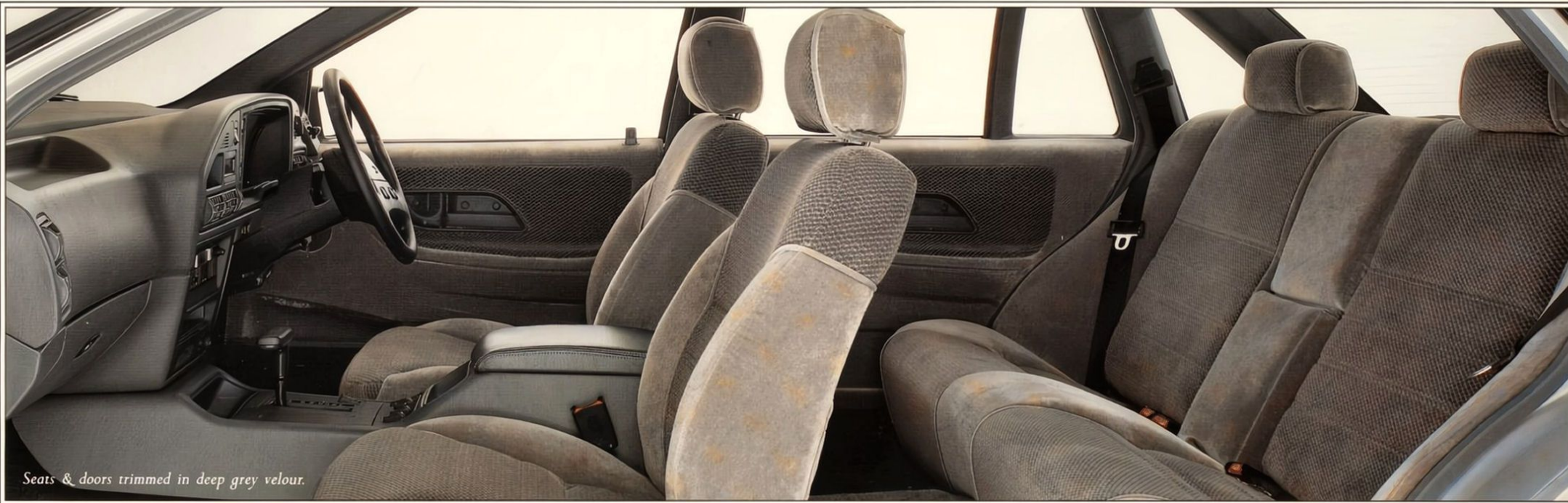
Seats & doors trimmed in deep grey velour.