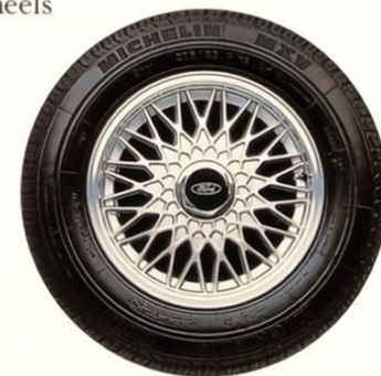
Alloy wheels and Michelin tyres.

To be one of those few, see your Ford Dealer, now.