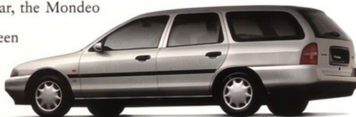
LX Station Wagon.

The Mondeo is an imported car. But it's also a Ford. And that gives it a unique advantage as a European family car in Australia.