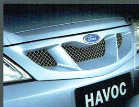
Front grille -

> Give your Falcon an aggressive edge with the fully integrated Havoc Body Kit. This limited edition pack makes any AUII Falcon unique on the street. The package includes styled side skirts, full front bumper replacement including fog lamps and a unique front grille featuring polished stainless steel mesh. On top of that there's a full rear bumper replacement with polished stainless steel mesh inserts, rear Havoc badge, rear window sticker and an optional full wing spoiler, while the side and rear skirts feature a two-tone finish. Complete the effect with the optional sports suspension upgrade. So go on, create havoc with your Falcon.