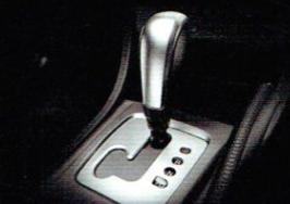
> Sequential Sports Shift