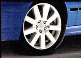
> 17" alloy wheels