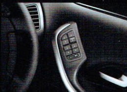
> Rear power windows