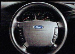
> Leather wrapped steering wheel