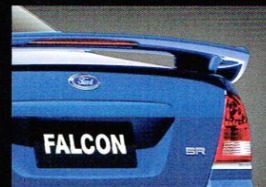
> SR badging and spoiler

*Based on recommended retail price of additional features. Offer excludes Government, National Fleet and Rental purchasers. Limited offer at participating Ford Dealers. *Driver and front passenger only.