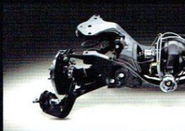
> Sports suspension