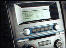
> Six stack CD player