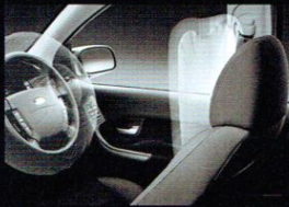
> Side airbags*

> With such an impressive package of sports and safety features valued at over $7,000*, plus the fact that air-conditioning is already standard, nothing excites like the special edition Falcon SR. The instant you spot the high arched spoiler and SR badging you know this Falcon is special. Topping the list of performance features is the 4-speed automatic transmission with Sequential Sports Shift for complete manual control over gear selection. In automatic mode, the Adaptive Shift intuitively adopts a shift pattern to suit your individual driving style. Add to that, 17" alloy wheels, leather wrapped steering wheel and Sports Control Blade Independent Rear Suspension, one of the most advanced suspension systems on any Australian built car. Driver and passenger safety also feature prominently with the inclusion of side airbags* and a reverse sensing system. Unique SR sports trim, rear power windows and a six stack CD player complete the package. Choose the optional E-Gas engine and you will cut your fuel costs. Whether you're looking for a vehicle that delivers exhilarating performance or a car with a long list of safety features, nothing comes close to the special edition Falcon SR. Nothing drives like a Falcon.