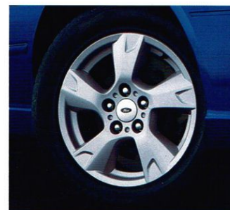
> Optional 1-tonne suspension with 5 spoke 16" alloy wheels (1-tonne rated)*.

*Set of four. *XR6 Cab Chassis on front cover shown with aftermarket tray and sports bar. See your Ford Dealer for the range of aftermarket tray options. Prestige paint (as shown) incurs an additional charge (RRP $355). †Traction Control not available when optional E-Gas engine is specified. This brochure is designed to provide you with a general introduction to the Ford Products (including available optional equipment) referred to, and should be read in conjunction with the latest specification sheet. Because of changes in conditions and circumstances Ford* reserves the right, subject to all applicable laws, at any time, at its discretion, and without notice, to discontinue or change the features, designs, materials, colours and other specifications and the prices of their products, and to either permanently or temporarily withdraw any such products from the market without incurring any liability to any prospective purchaser or purchasers. The latest specification sheet should be referred to for information on the availability, ordering and use of optional equipment. Always consult an authorised Ford Dealer for the latest information with respect to features, specifications, prices, optional equipment and availability before deciding to place an order. *FORD MOTOR COMPANY OF AUSTRALIA LIMITED. (A.B.N. 30 004 116 223) Registered Office: 1735 Sydney Road, Campbellfield, Victoria 3061, Australia. Printed April 2006. FMC 3072