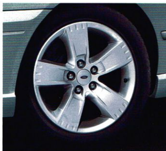
> Standard sports suspension with 5 spoke 17" alloy wheels*.