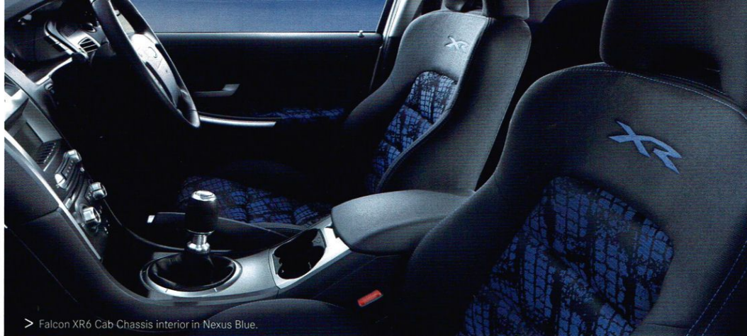
> Falcon XR6 Cab Chassis interior in Nexus Blue.