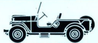
Open body CJ-6