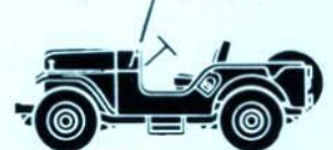
Open body CJ-5