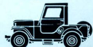
Metal half cab