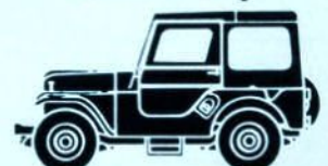
Metal full cab