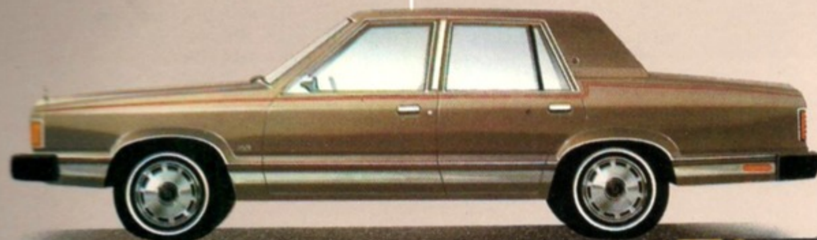
Cougar GS four-door in Light Pewter Metallic.

Cougar GS is a car of remarkable qualities. While it is the lowest priced Cougar, it still incorporates the sleek, trim, aerodynamic styling that is distinctively Cougar; it offers you a smooth, comfortable Cougar ride, and it maintains a high level of luxury.