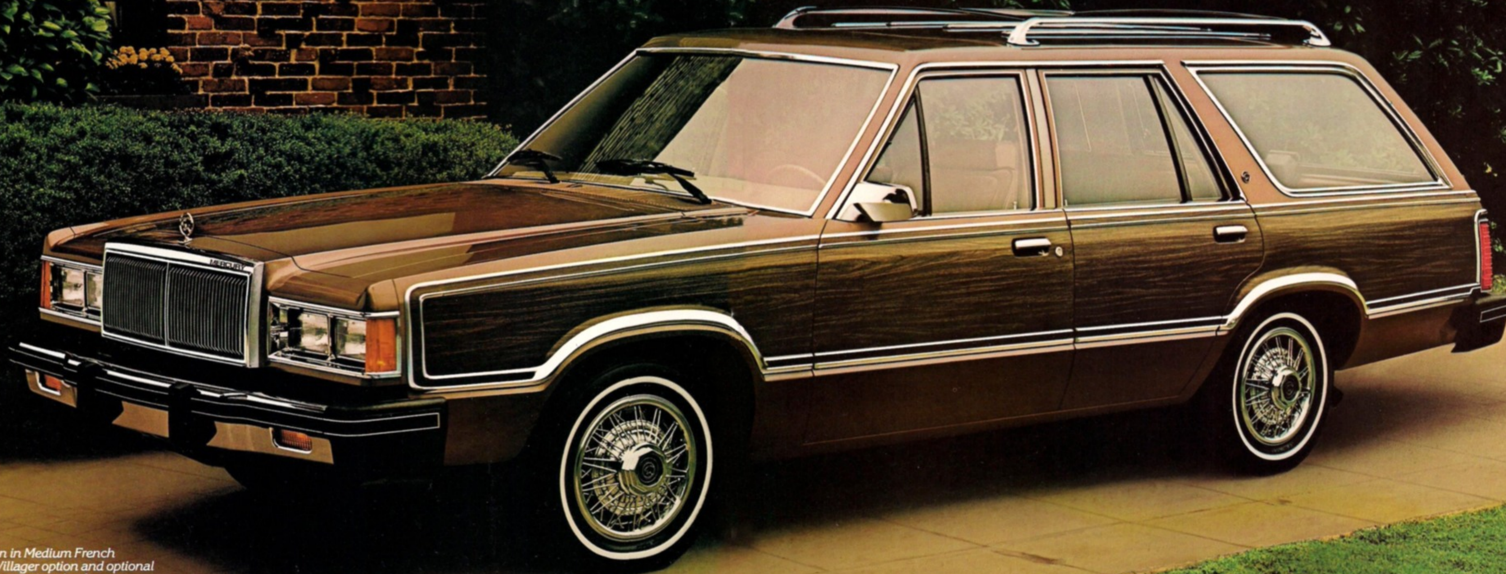
Cougar Wagon in Medium French Vanilla, with Villager option and optional luggage rack and wire wheel covers.