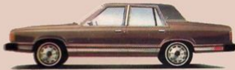
COUGAR GS 4-DOOR