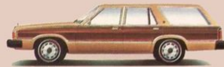
COUGAR STATION WAGON WITH VILLAGER OPTION