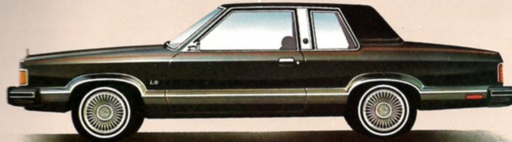
Cougar LS two-door in Black.

High luxury in a mid-size car? Step inside a Cougar LS and you'll see. You relax in the sheer cradling comfort of deeply contoured Twin Comfort Lounge seats. Both are reclining and individually adjustable, so that the driver and front-seat passenger can position their seats to their exact comfort needs. Both seats are luxuriously trimmed in luxury cloth or optional leather seating surfaces—so soft to the touch. Both have deeply padded fold-down armrests and—a nice feature—a handy tray in the center console for