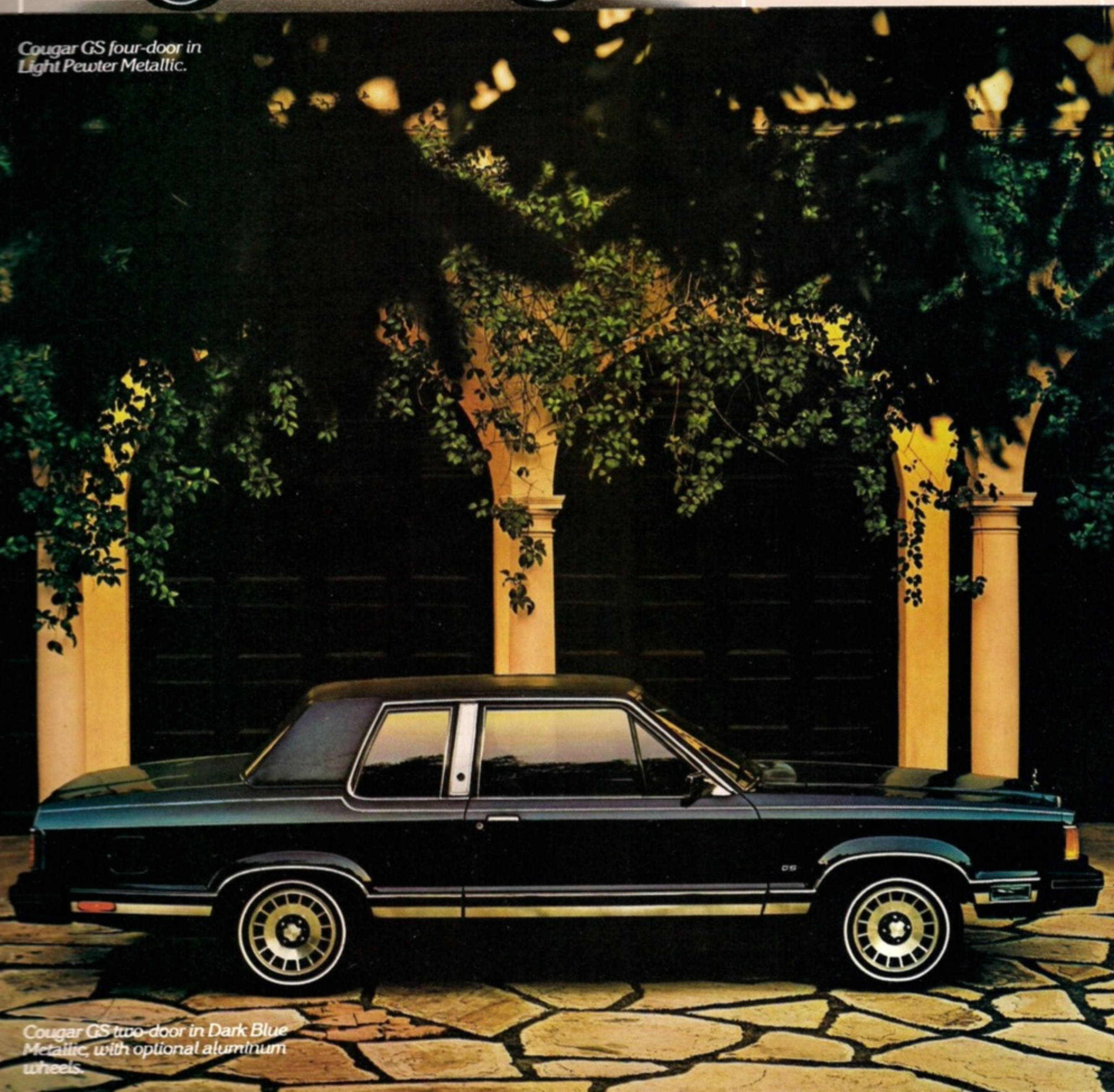
Cougar GS two-door in Dark Blue Metallic, with optional aluminum wheels.