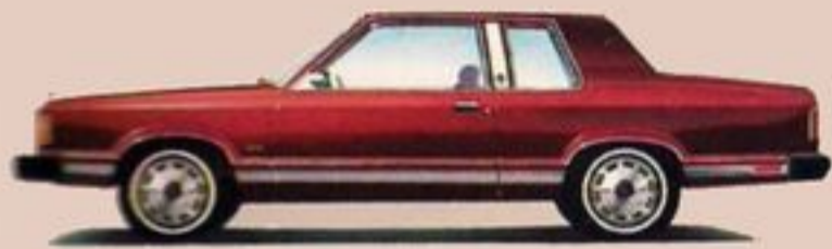
COUGAR GS 2-DOOR