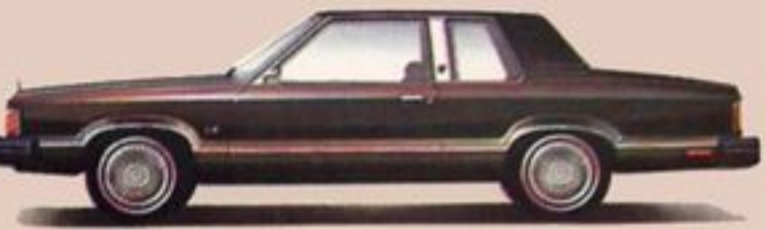
COUGAR LS 2-DOOR