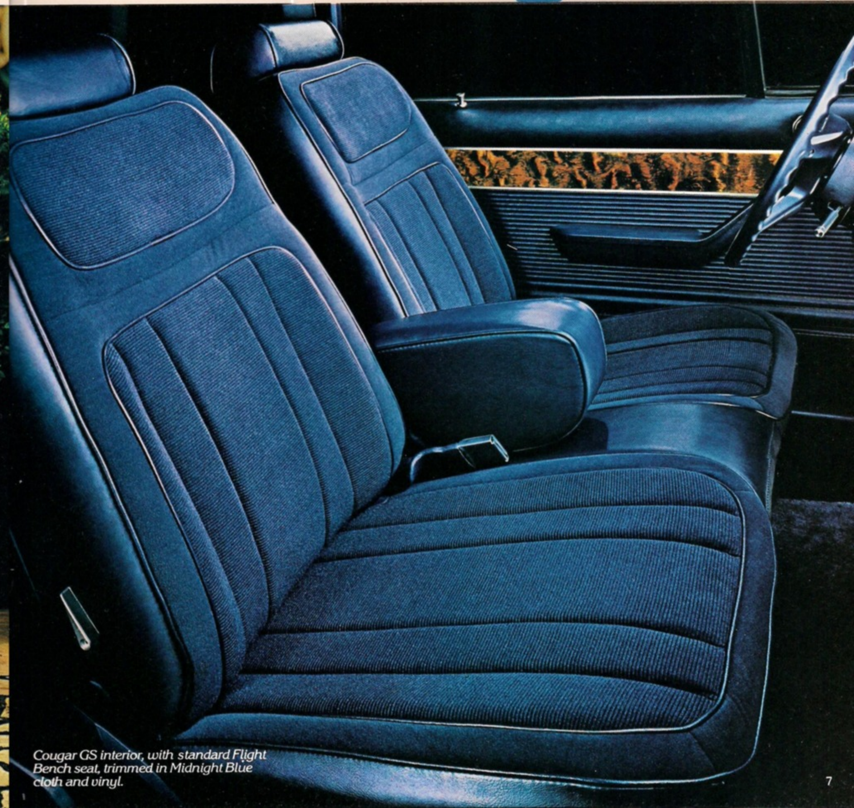
Cougar GS interior, with standard Flight Bench seat, trimmed in Midnight Blue cloth and vinyl.