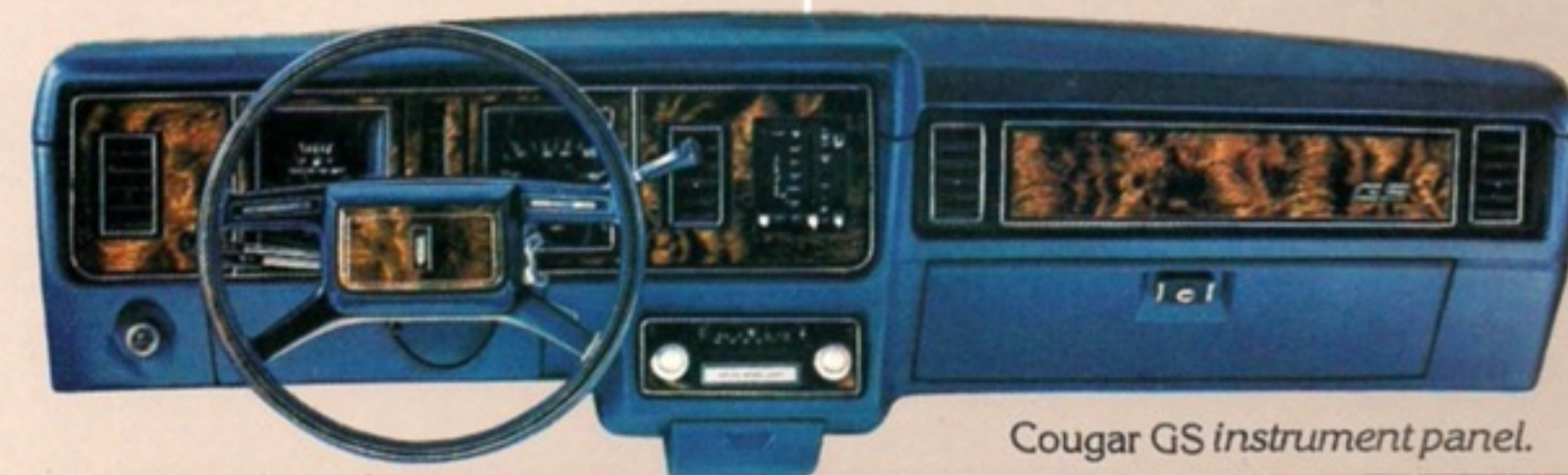
Cougar GS instrument panel.

In Cougar GS, you have a car that's as pleasing to drive as it is to own.