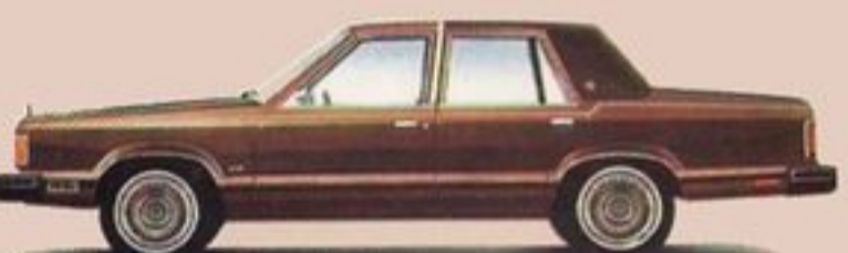
COUGAR LS 4-DOOR