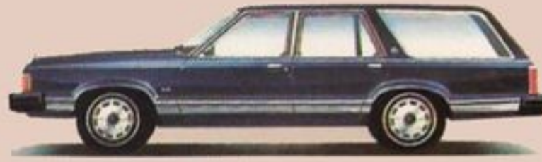
COUGAR GS STATION WAGON