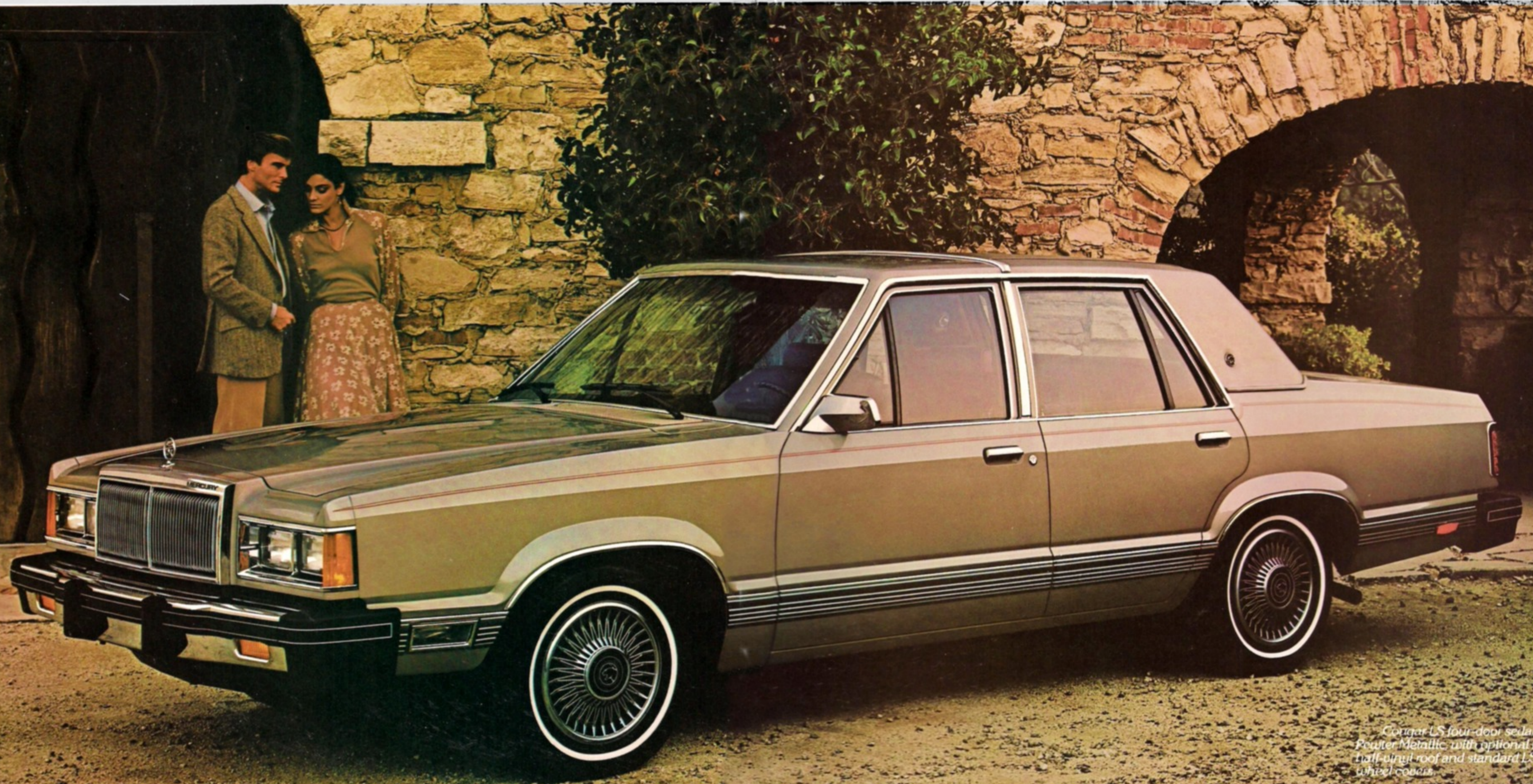
Cougar LS four-door sedan in Light Pewter Metallic, with optional rear half vinyl roof and standard LS luxury wheel covers.

Equipment note: Some of the equipment shown may be available only at extra cost, and only on specific models. Please see pages 10 through 13 for specific information regarding standard and optional equipment.