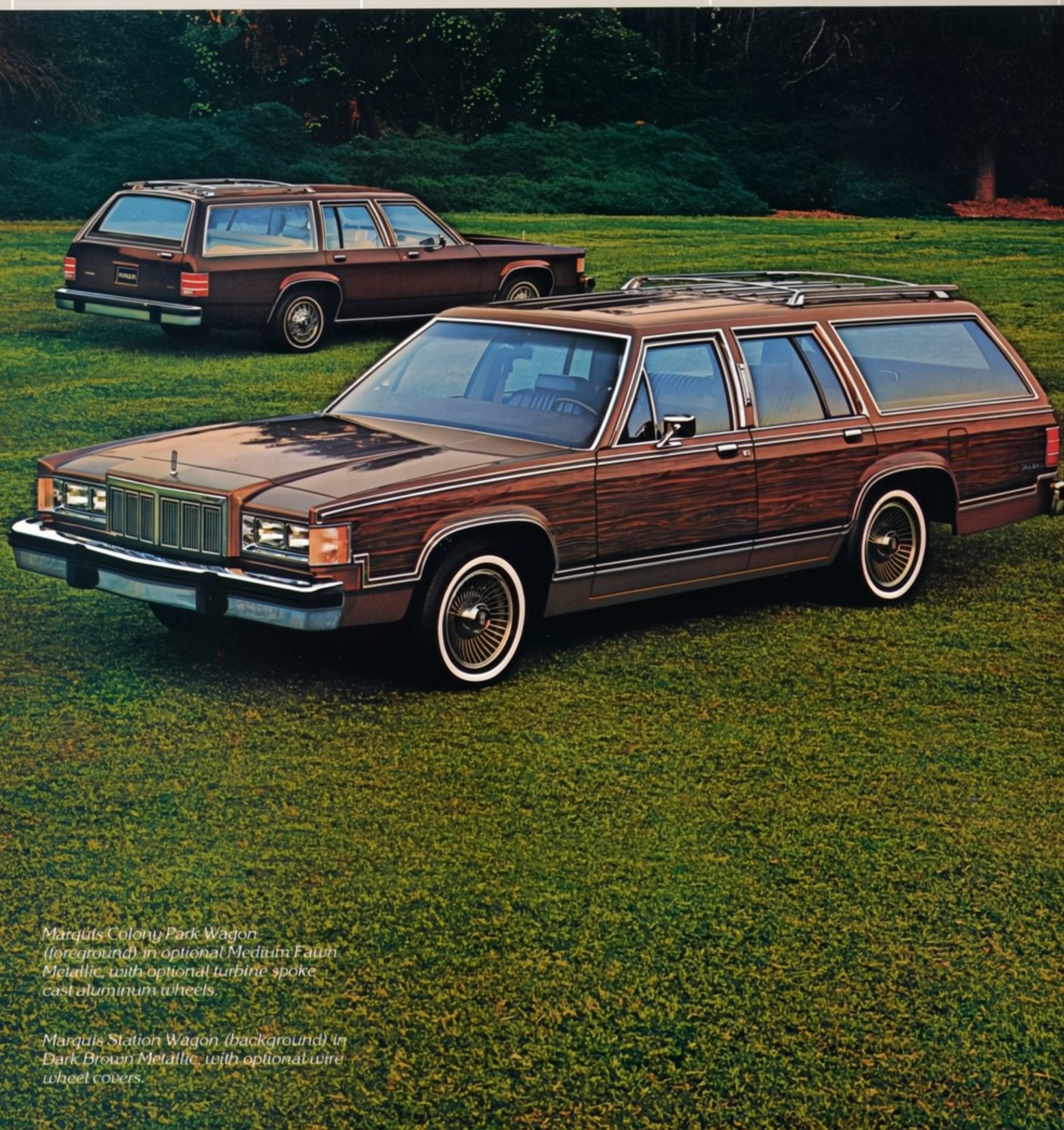
Marquis Colony Park Wagon (foreground) in optional Medium Faun Metallic, with optional turbine spoke cast aluminum wheels.

*Based on EPA Volume Index, excluding other Ford Motor Company products.