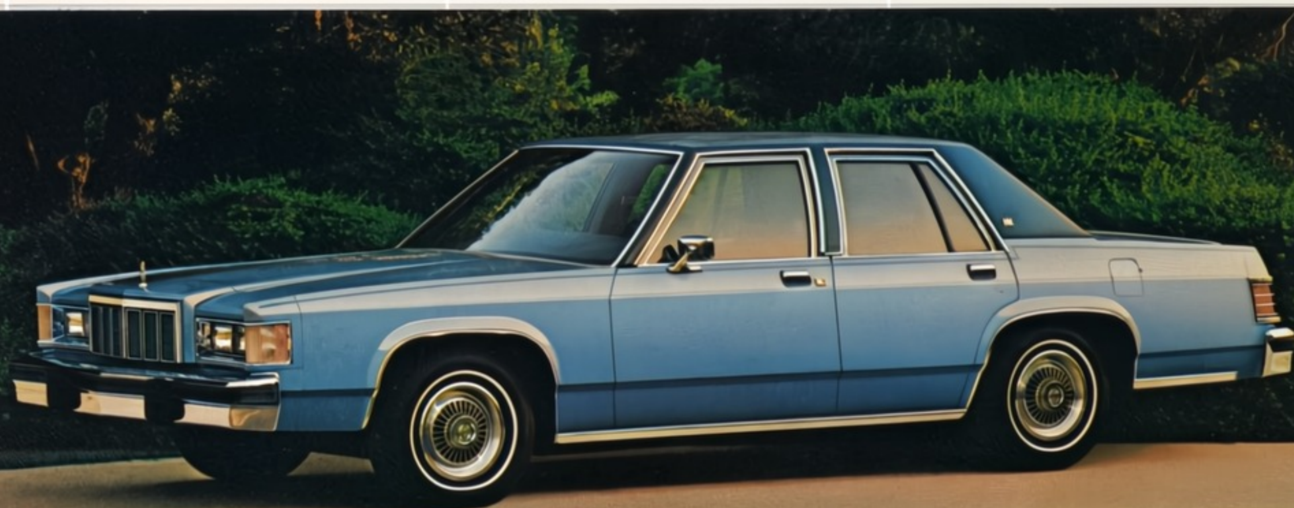
Mercury Marquis four-door sedan in optional Medium Blue Metallic, with optional Midnight Blue full-vinyl roof and optional luxury wheel covers.

*EPA estimates were not available at the time this catalog was published. Mercury Marquis, however, should post in the new EPA Gas Mileage Guide, excellent mileage figures. See your Lincoln-Mercury Dealer for the latest information.