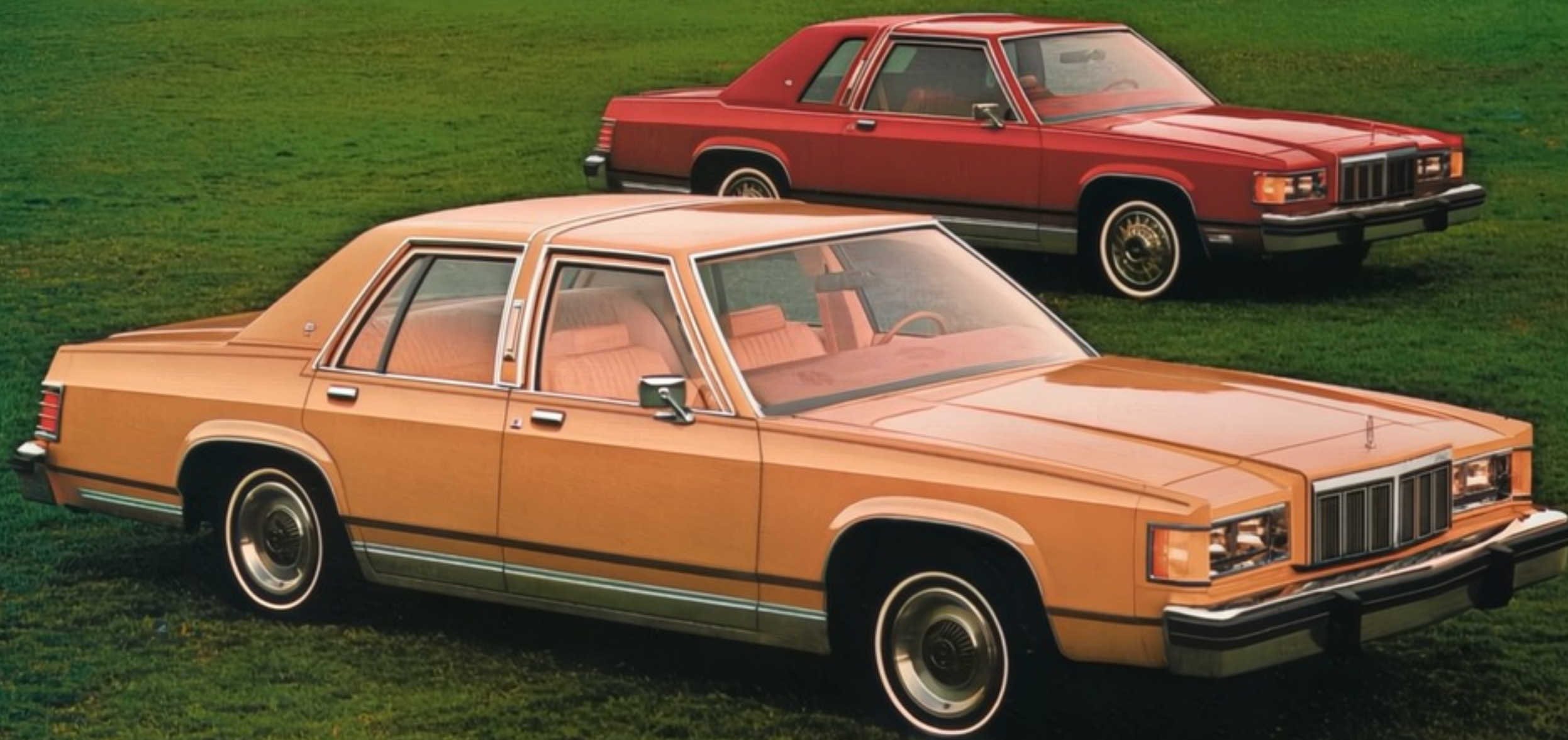
Mercury Marquis Brougham four-door sedan (foreground) in French Vanilla Metallic, with vinyl coach roof and standard wheel covers.

Marquis Brougham—inviting you to experience uncompromised room, ride, and comfort.