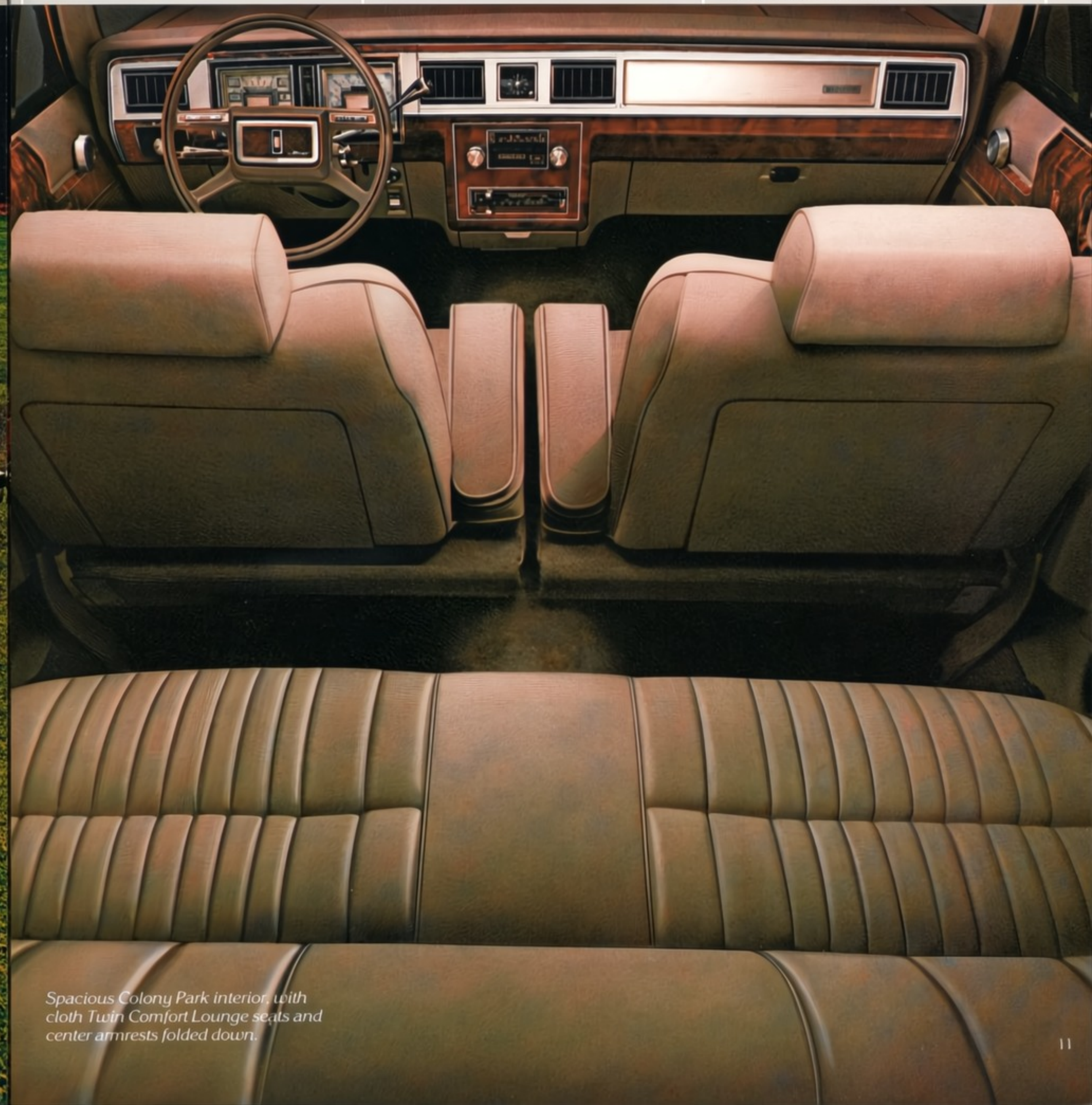
Spacious Colony Park interior, with cloth Twin Comfort Lounge seats and center armrests folded down.