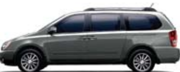
Titanium Silver (M) (GC/GL)