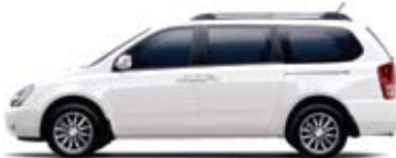
Clear White (GC/GL)