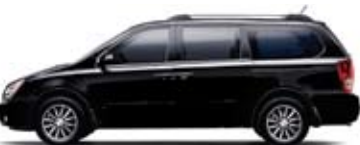
Midnight Black (GC/GL)