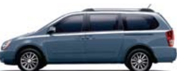
Crystal Blue (M) (GC/GL)

TC = Tan cloth, GC = Grey cloth, TL = Tan leather, GL = Grey leather, M = Metallic paint. The interior and exterior colours in this brochure are as close to the actual vehicle production colours as the printing process allows.