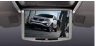
10" DVD entertainment system