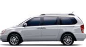
Clear Silver (M) (GC/GL)