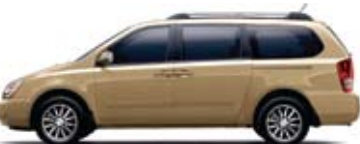
Cashmere Beige (M) (TC/TL)