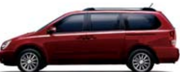
Crimson Red (M) (GC/GL/TC/TL)