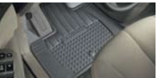
All-weather floor mats