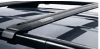
Roof rack crossbars