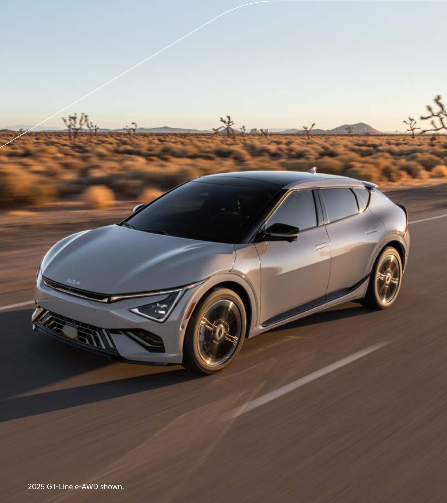
2025 GT-Line e-AWD shown.

EPA-est. Available Range 35* (Light Long Range RWD, Wind RWD, GT-Line RWD)