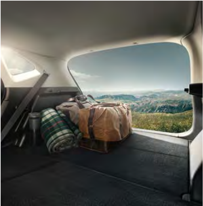
Smart Power Liftgate 21* (EX; SX)