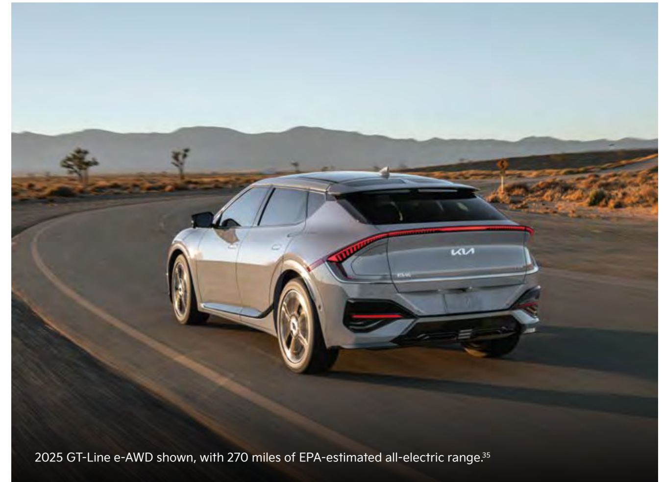
2025 GT-Line e-AWD shown, with 270 miles of EPA-estimated all-electric range. 35

Reimagined for 2025, the all-electric EV6 features an updated exterior that is dynamic and sporty, with dramatic new wheel designs to elevate the look. Inside, you'll find the driver-oriented cockpit boasts a 24.6-inch total combined 36 Panoramic Display 7 that integrates the instrument cluster and center screen for an immersive visual experience. The new, larger, standard 63.0 kWh battery is paired with a rear motor producing 167 horsepower and 258 lb.-ft. of torque. And the available 84.0 kWh battery delivers an EPA-estimated 319 miles of range 35 in Light Long Range, Wind, and GT-Line trims with RWD. Keep it powered with the EV6 ultra-fast 800V DC charging system, and use Kia Charge Pass 37 through Kia Connect 8 to gain access to charging stations across the nation, manage your charging sessions and plan your routes.