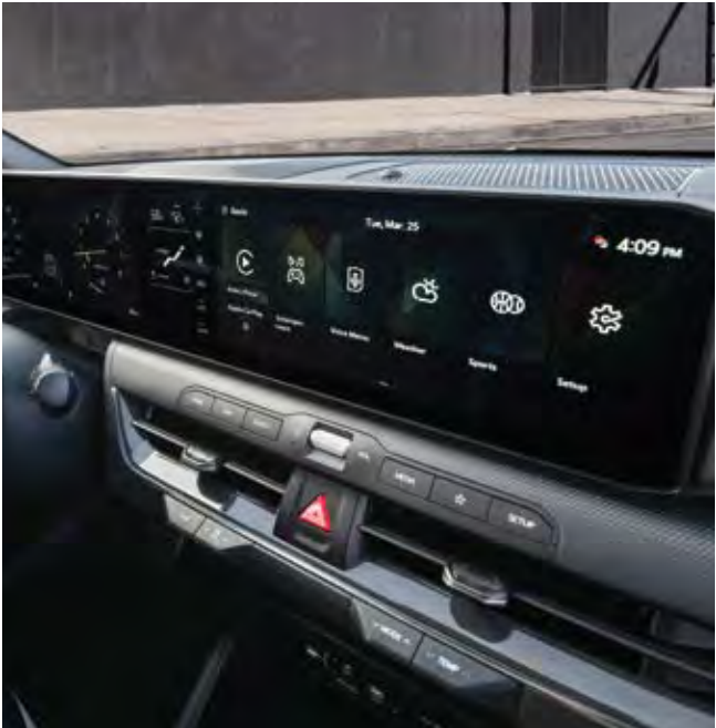
29.6-inch Total Combined 19 Panoramic Display 7* (GT-Line ® , GT-Line Turbo)