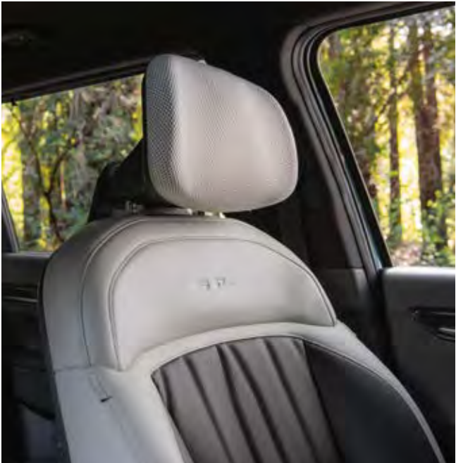
Nearly 30-inch Total Combined 19 Panoramic Display 7