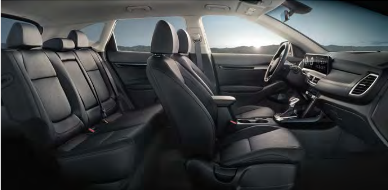
Bose 47 8-speaker Premium Audio System* (SX)