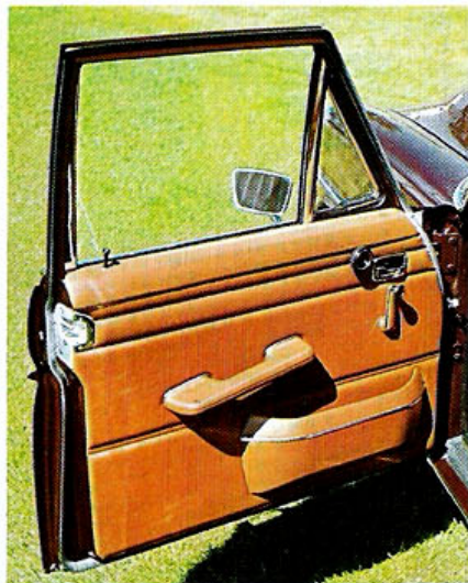
Door handle is recessed for passenger protection. Pocket keeps maps at your fingertips.