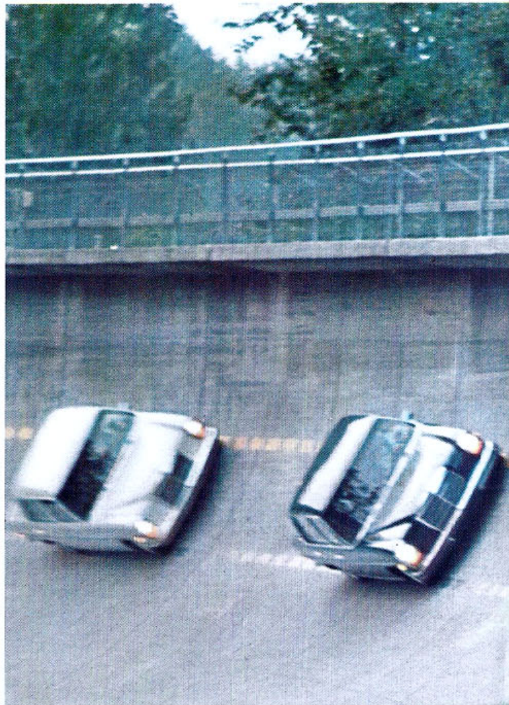
The high wall turn of the Daimler-Benz test track. Where 250s are tested for cornering, braking and high-speed handling.