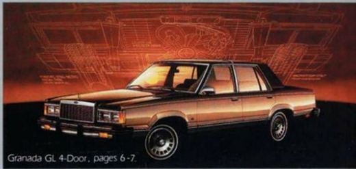
Granada GL 4-Door, pages 6-7.