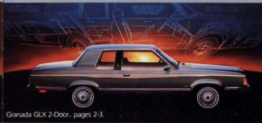
Granada GLX 2-Door, pages 2-3.