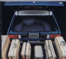
Above Far left: Precise Rack and Pinion Steering. Center: Power Assisted Front Disc Brakes. Left: New Redesigned Trunk.