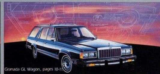
Granada GL Wagon, pages 10-11.

In 1981, Granada underwent dramatic changes that saw it shed hundreds of pounds of weight and emerge as the most fuel-efficient, aerodynamic Granada ever.