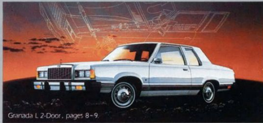
Granada L 2-Door, pages 8-9.