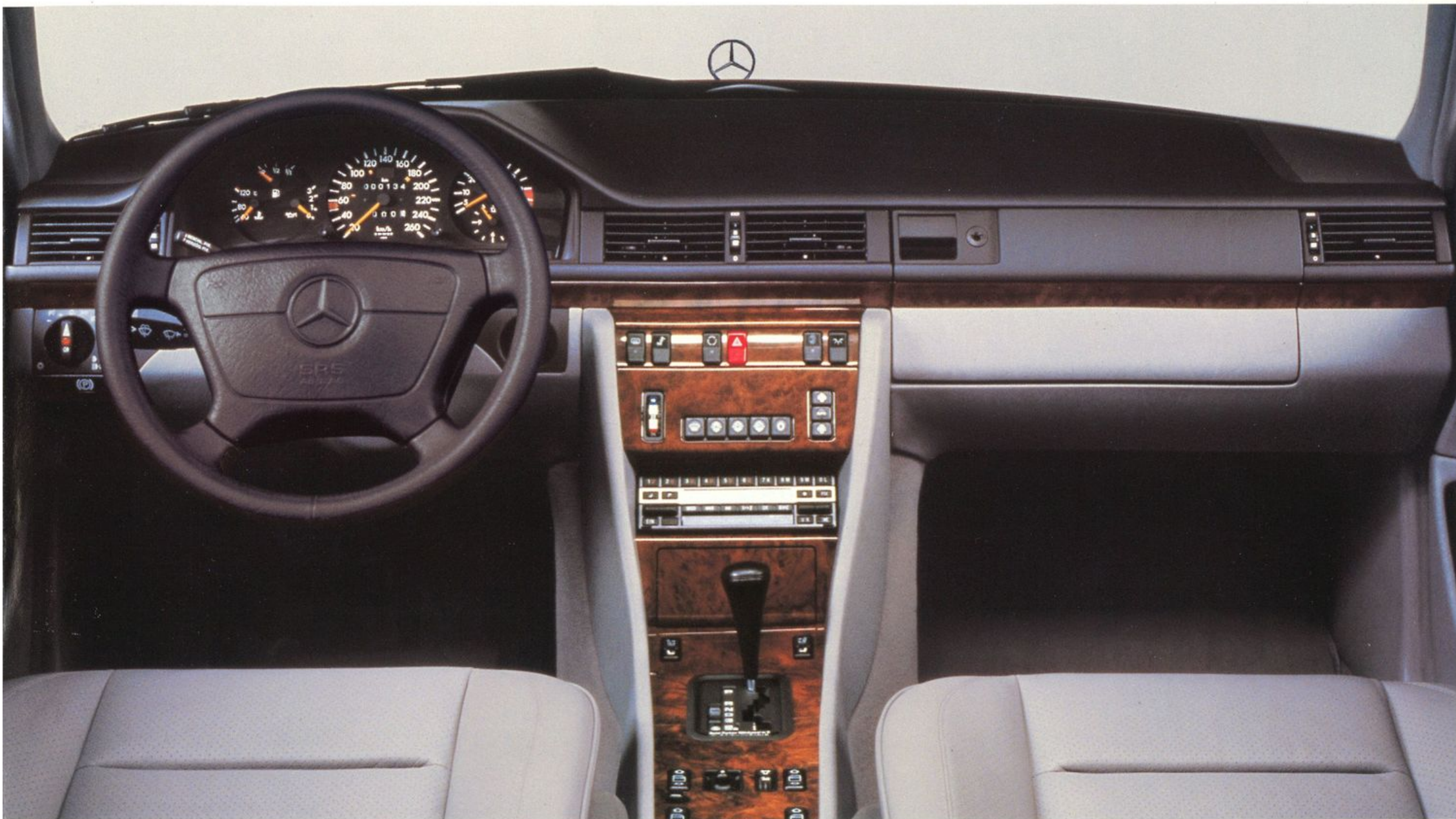
The 500E's driving environment includes a new, smaller steering wheel, special walnut trim, and redesigned leather-upholstered seats with substantial lateral and thigh bolsters.