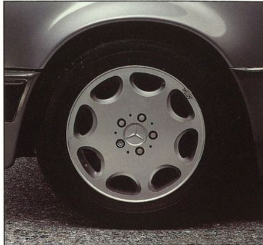
The 500E rides on new eight-hole 16-inch light-alloy wheels.

The 500E is an inspired match of powerful 5.0-liter engine and seasoned chassis. It is also a great deal more. The new, larger engine required that the front structure be substantially reengineered to preserve its offset-impact design. Intensive development of the front and rear suspensions produced enhanced handling and comfort. Even the underbody has been rearranged, to accommodate a larger catalytic converter beneath.