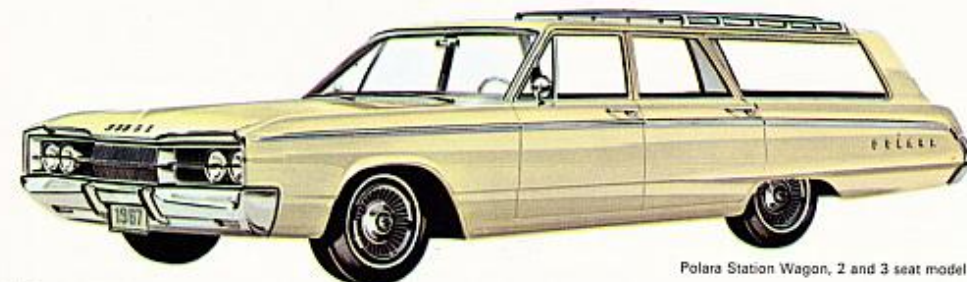
Polara Station Wagon, 2 and 3 seat models