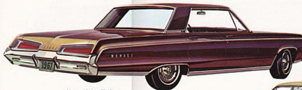
Monaco 4-door Hardtop