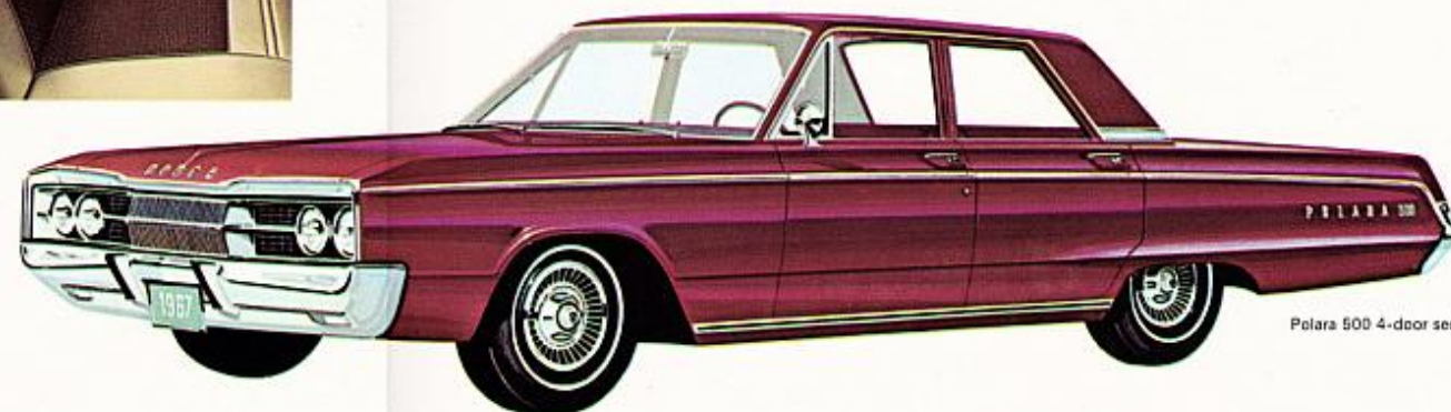
Polara 500 4-door sedan