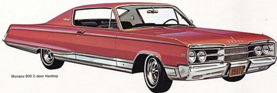
Monaco 500 2-door Hardtop