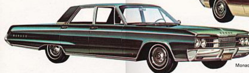
Monaco 4-door Sedan