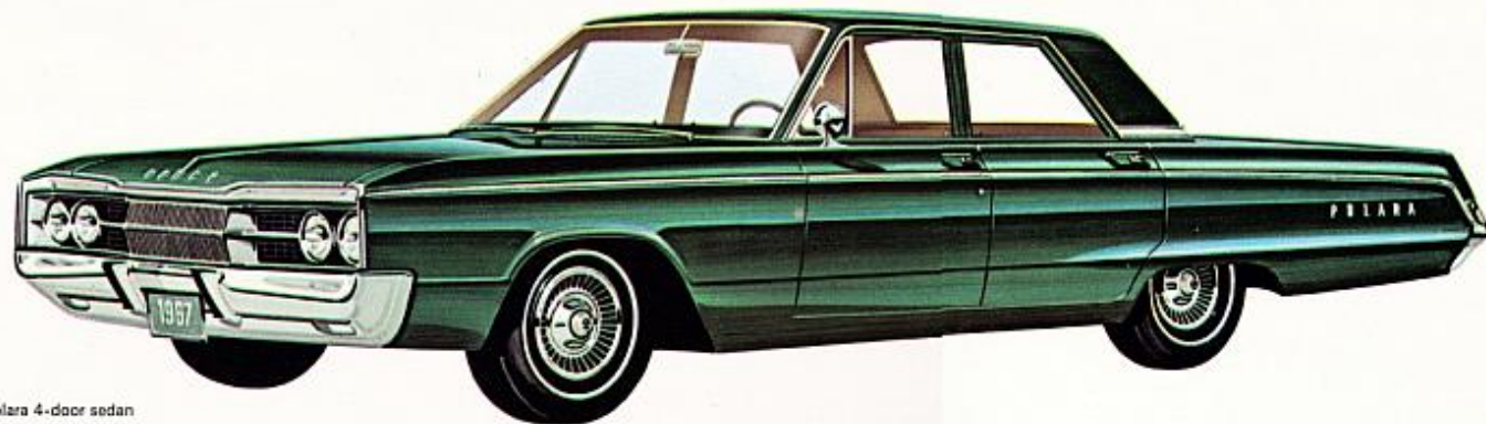
Polara 4-door sedan