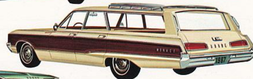
Monaco Station Wagon, 2 and 3 seat models