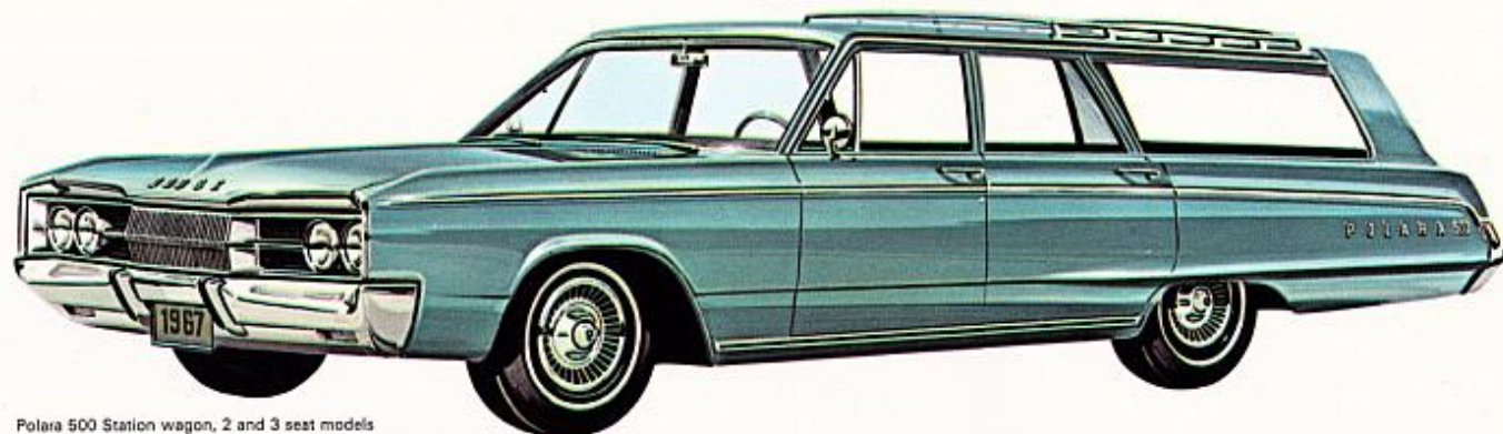
Polara 500 Station wagon, 2 and 3 seat models