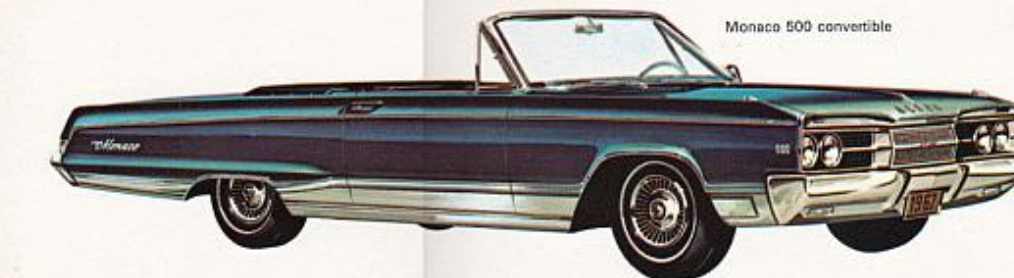
Monaco 500 convertible